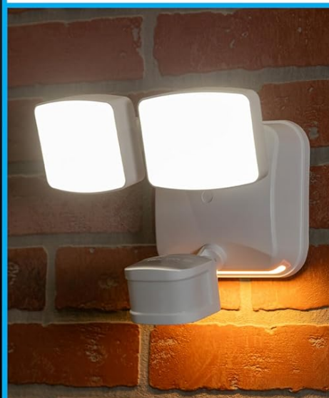
Figure 5: Flexible and adjustable floodlight heads.