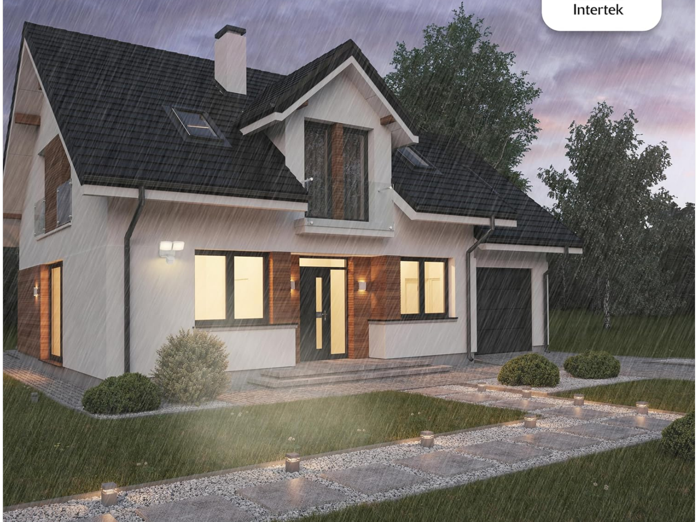
Figure 4: The dusk-to-dawn accent night light feature.