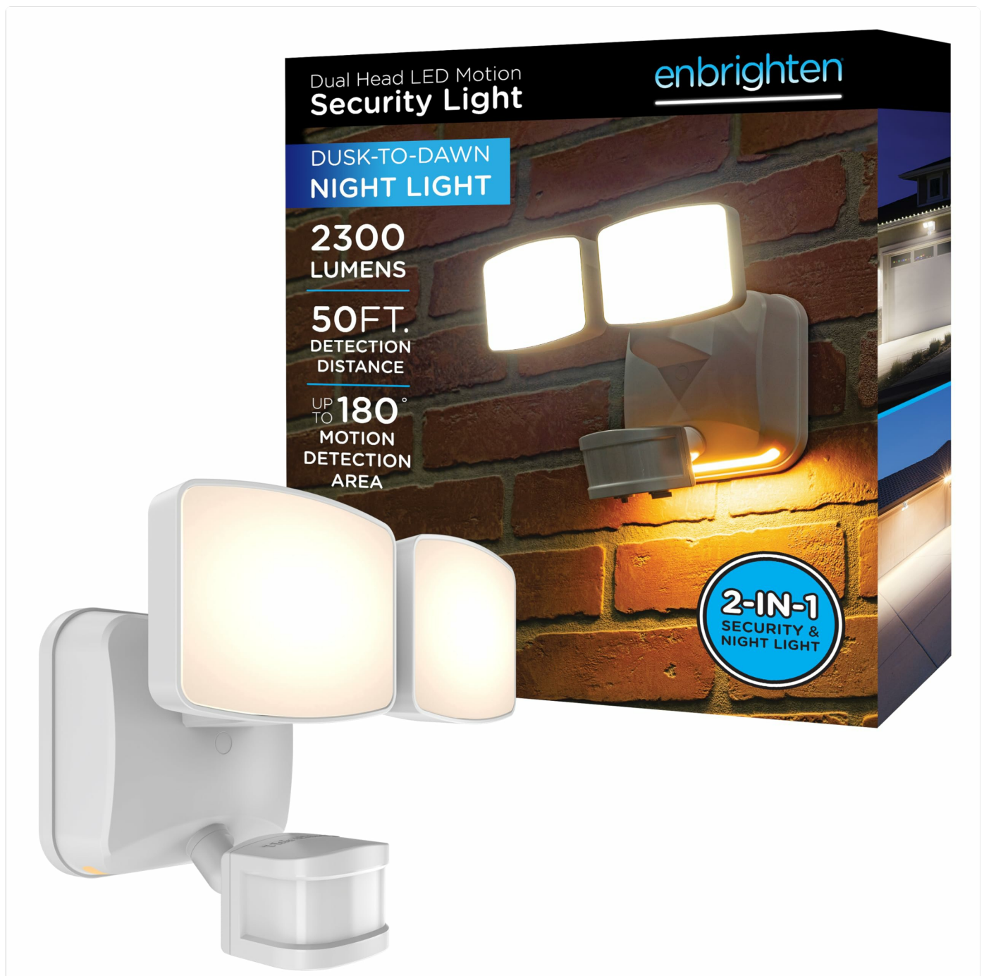
Figure 1: Enbrighten 73676-S1 LED Motion Security Light in an outdoor setting.