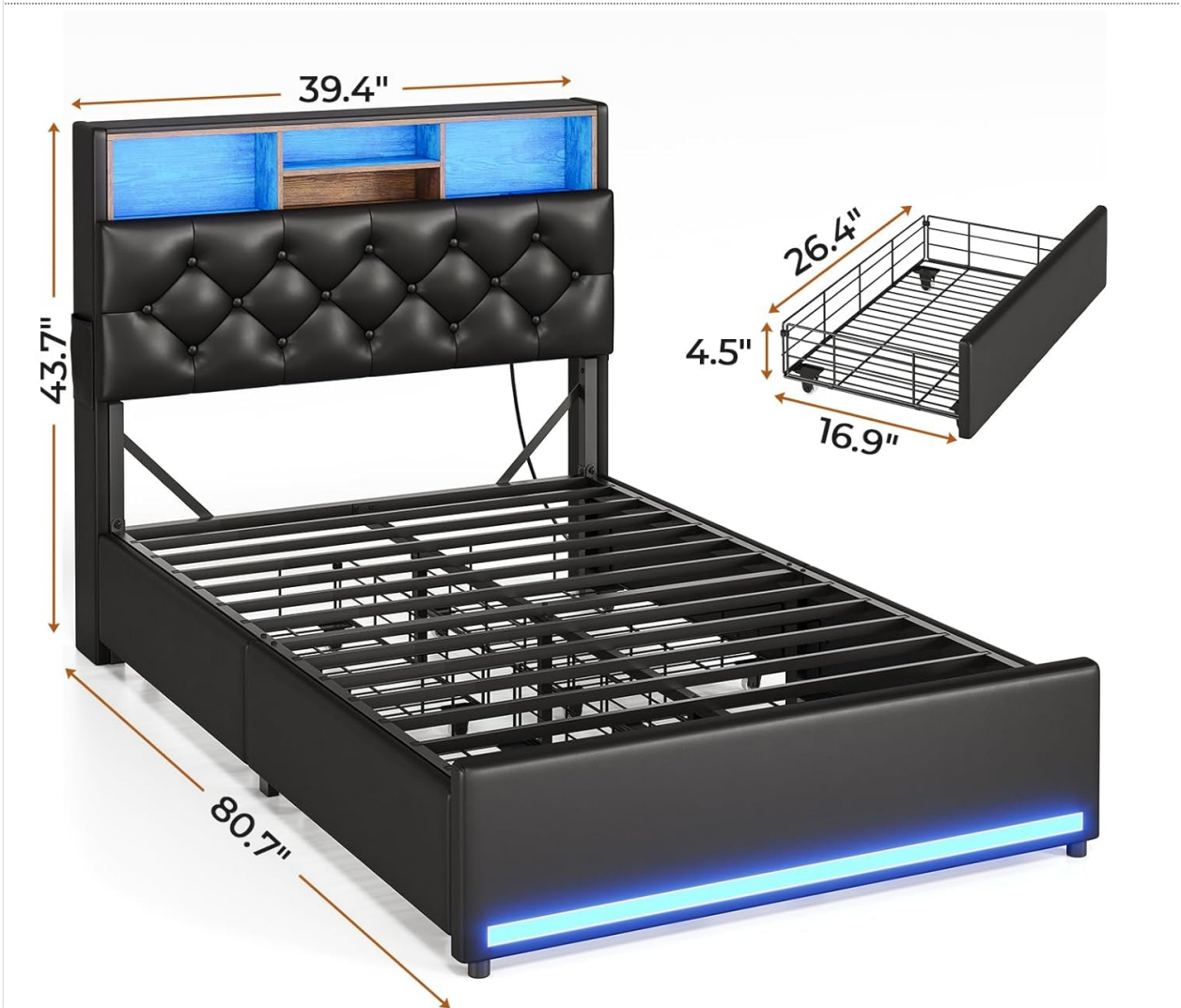
Image 4.1: Dimensions of the BTHFST Twin Bed Frame (80.7"L x 39.4"W x 43.7"H) and a close-up of the under-bed storage drawer with its dimensions (26.4"L x 16.9"W x 4.5"H).