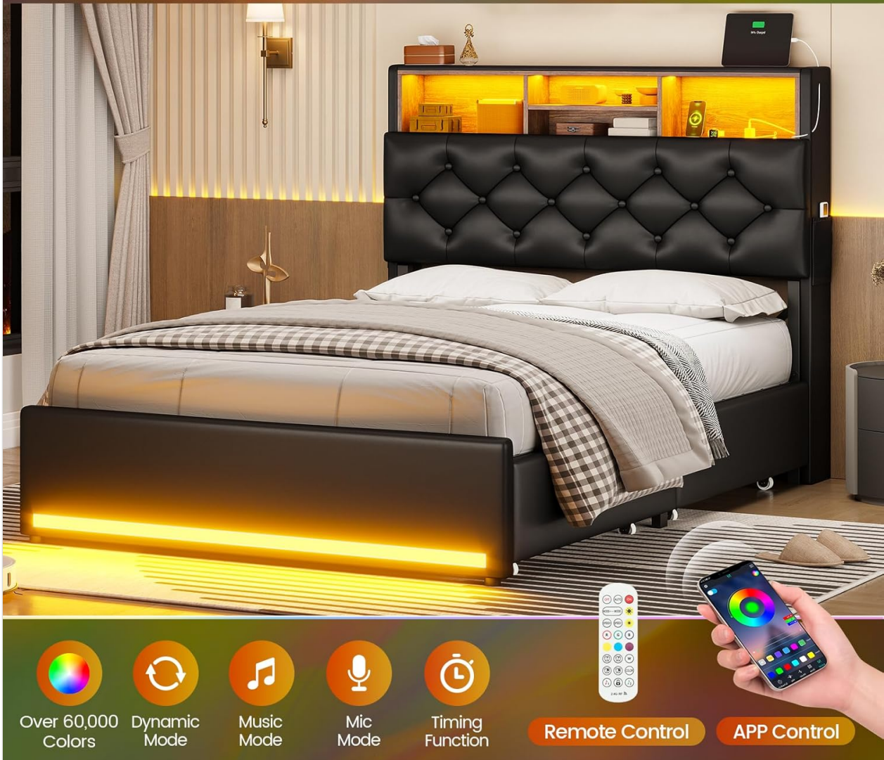
Image 5.1.1: The bed frame illuminated with orange RGB LED lights, demonstrating control options via remote and mobile application.