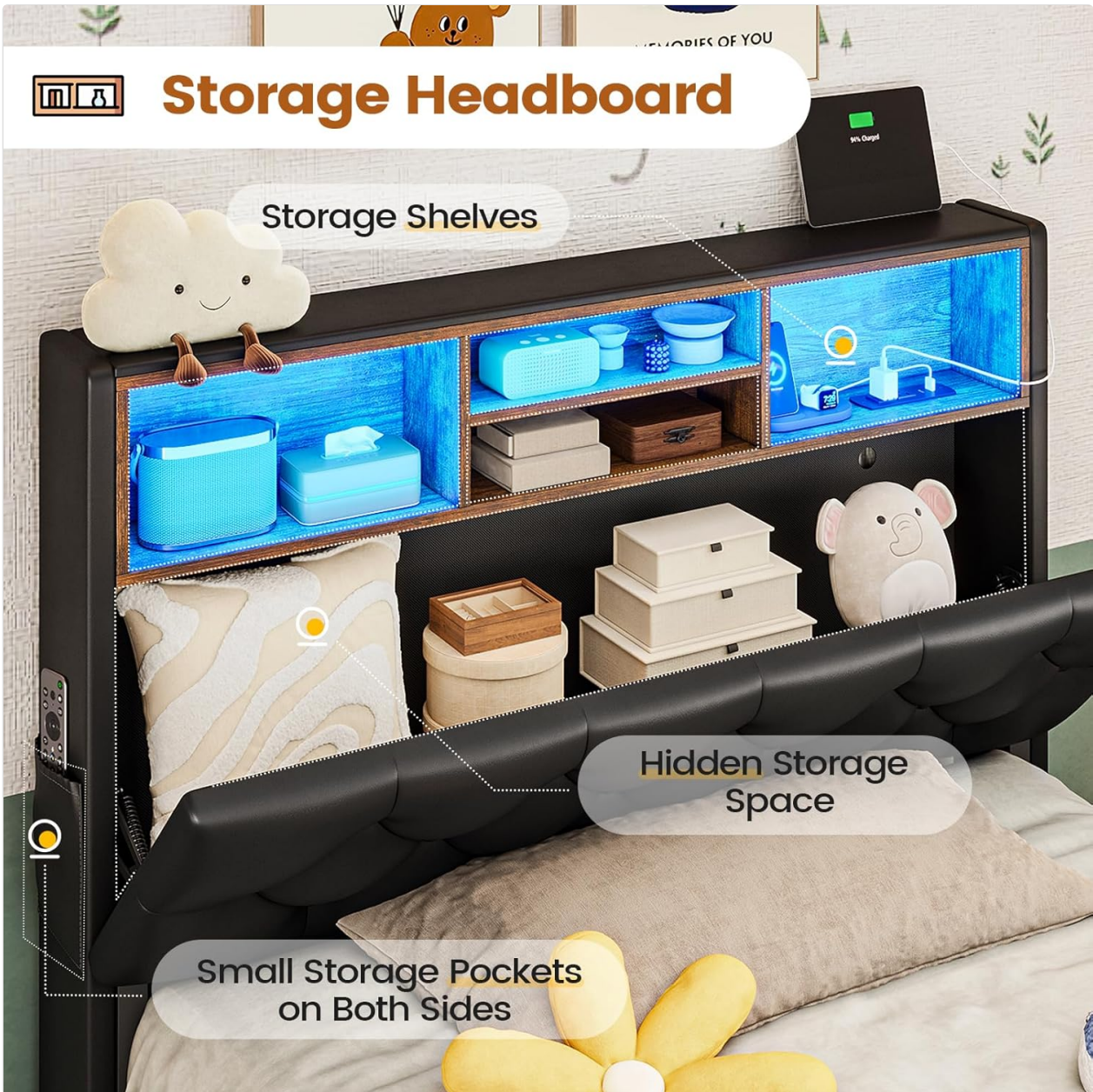
Image 5.3.1: A detailed view of the headboard's storage capabilities, including open shelves with blue LED lighting, a hidden storage compartment, and small side pockets for convenience.