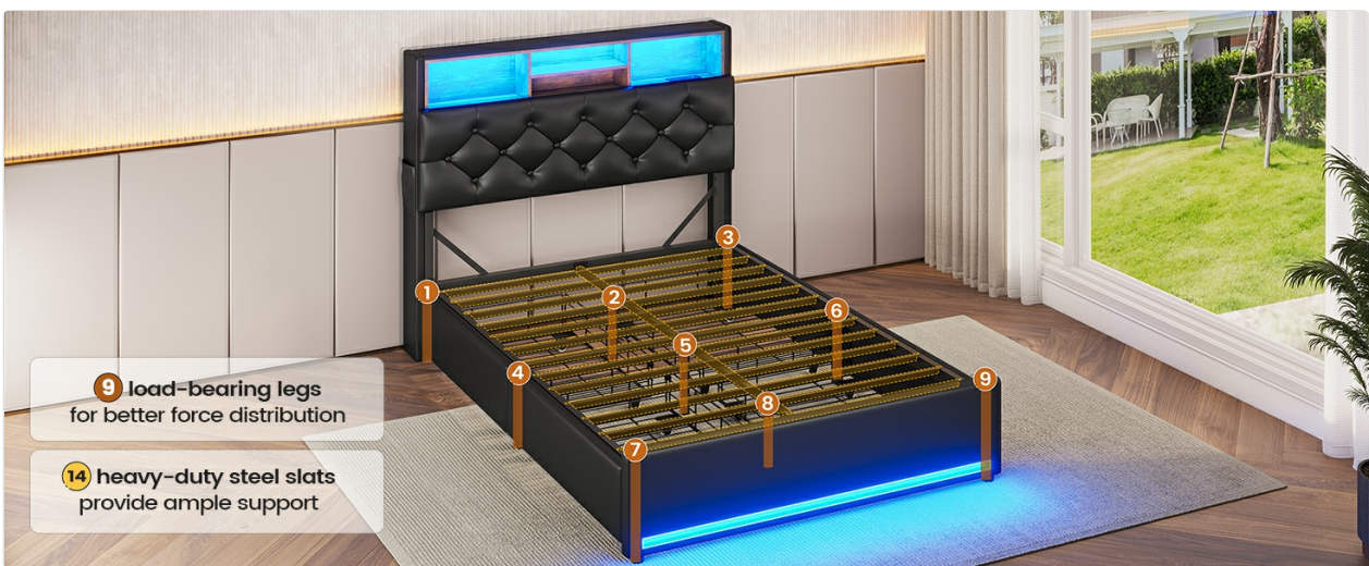
Image 4.2: Illustration of the bed frame's robust metal structure, highlighting the 9 load-bearing legs and 14 heavy-duty steel slats designed for stable support.