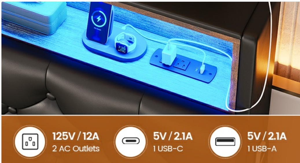
Image 5.2.2: A graphic detailing the power specifications of the charging station: two 125V/12A AC outlets, one 5V/2.1A USB-C port, and one 5V/2.1A USB-A port.