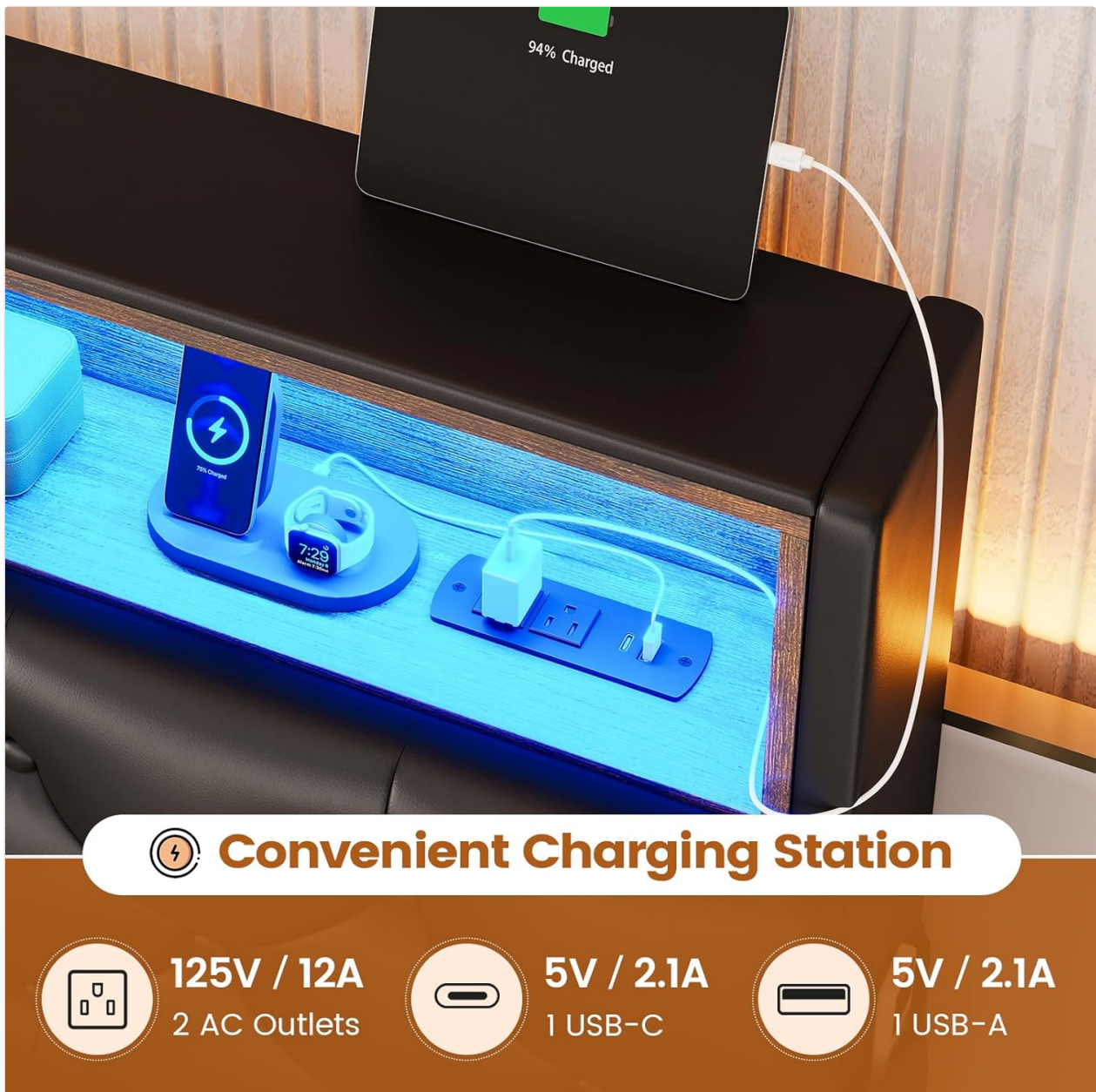
Image 5.2.1: A detailed view of the headboard's integrated charging station, showing a smartphone and other devices connected to the USB, Type-C, and AC outlets, illuminated by the headboard's blue LED lights.