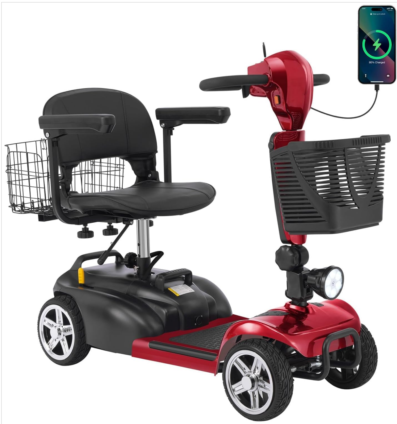
Figure 1: Ecomobi MS02 4-Wheel Mobility Scooter