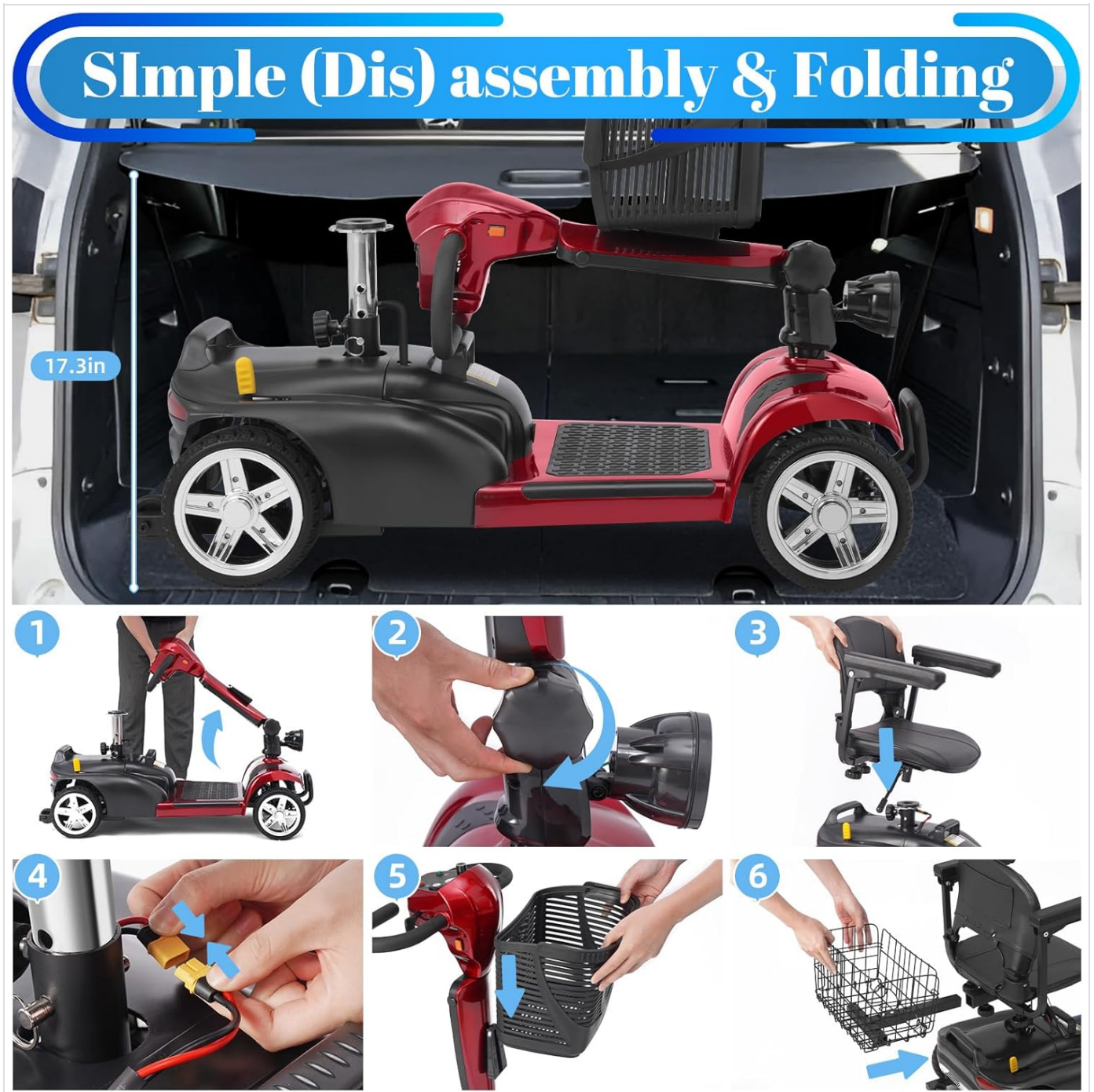
Figure 3: Simple Assembly and Folding Steps