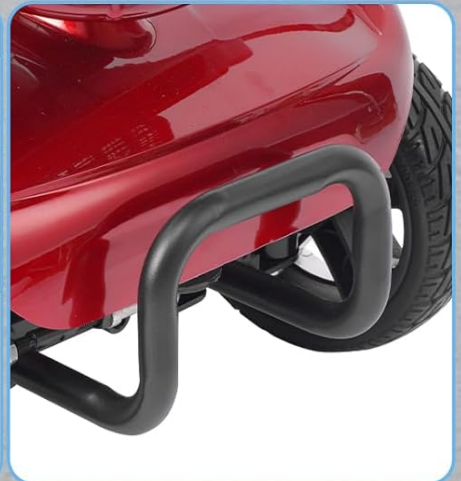
Front anti-collision beam