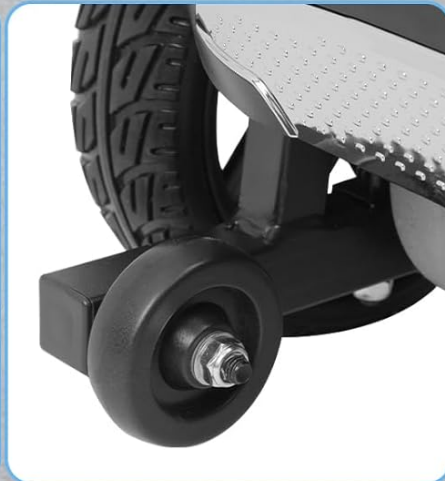
Rear anti-roll wheel