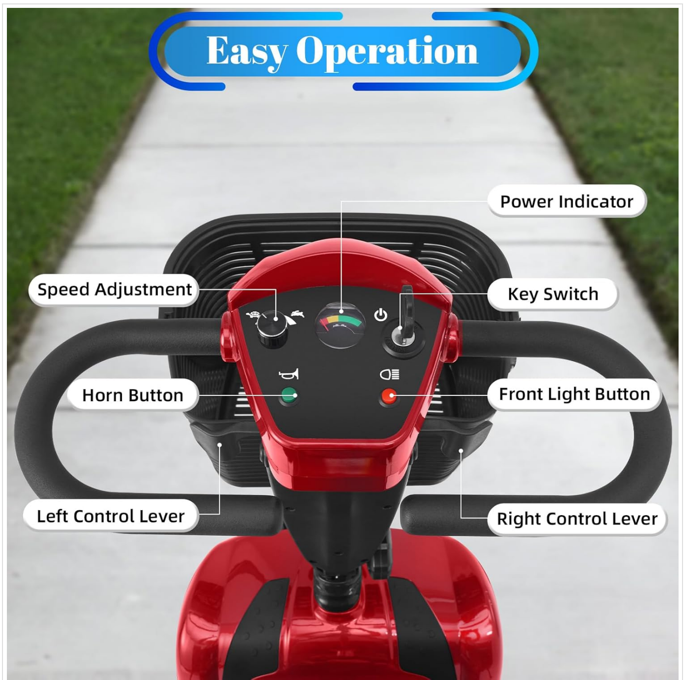
Figure 4: Control Panel Layout