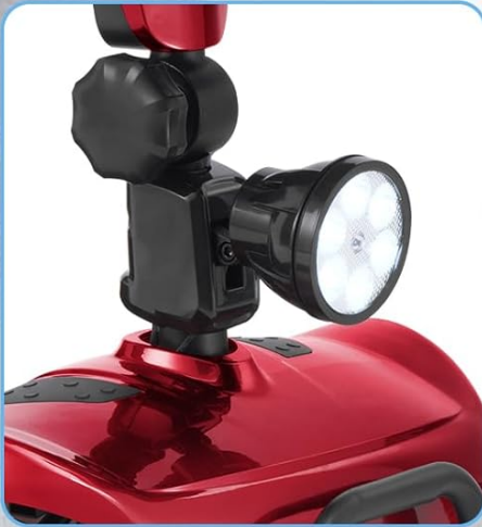
High brightness LED headlights