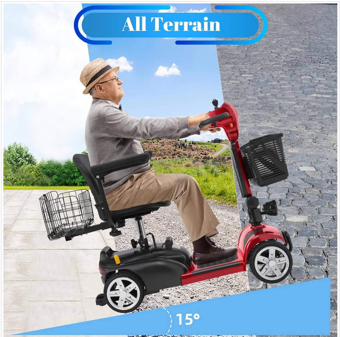
Figure 6: All-Terrain Capability (up to 15° incline)