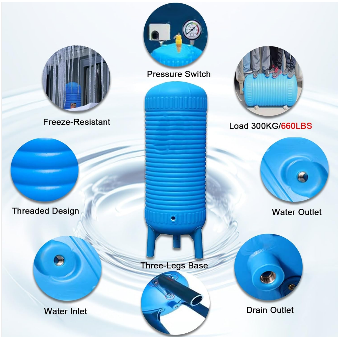
Figure 2: Key features of the pressure tank, including the pressure switch, freeze-resistant design, load capacity, threaded design, water outlet, three-legs base, water inlet, and drain outlet.