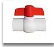
Sewage Ball Valve