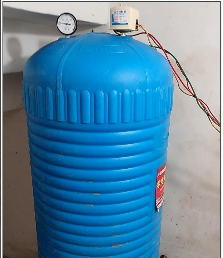
Figure 6: Various perspectives of the water pressure tank installed in different outdoor environments, demonstrating its adaptability.