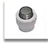
Water Outlet Connector