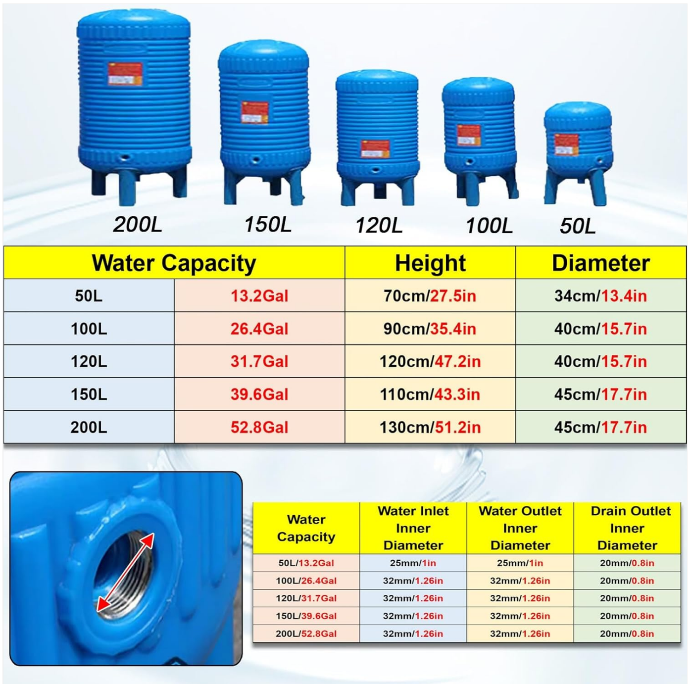
Figure 8: A comprehensive table detailing the various capacities (50L, 100L, 120L, 150L, 200L) with their corresponding heights, diameters, and inner diameters for water inlet, water outlet, and drain outlet.