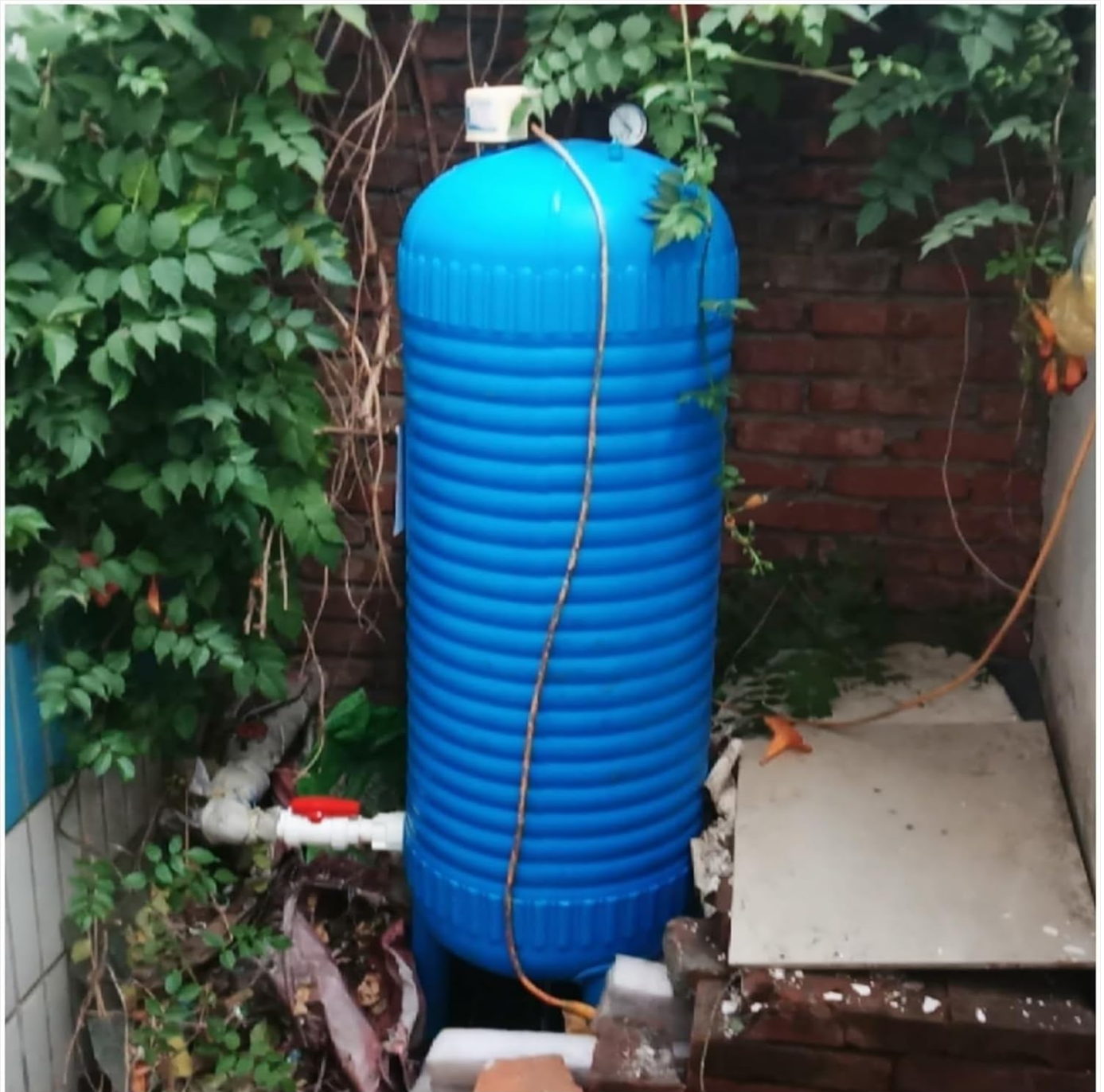
Figure 1: LZMZMQ Water Pressure Tank installed in an outdoor setting, surrounded by foliage.