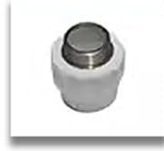
Water Inlet Connector