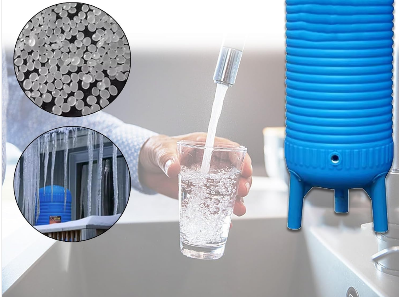
Figure 3: Demonstration of the food-grade PE material, similar to milk bottles, and the tank's freeze-resistant properties in cold conditions.

PE material for drinking water, the same material as milk bottle, safe and odorless; normal use in winter, freeze-resistant, -60^{\circ}\text{C} will not freeze.