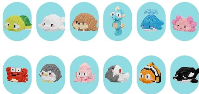
Image: Overview of the Jollnoia 12 Set Marine Life Mini Building Blocks, showing the packaging and the variety of sea animal models included.