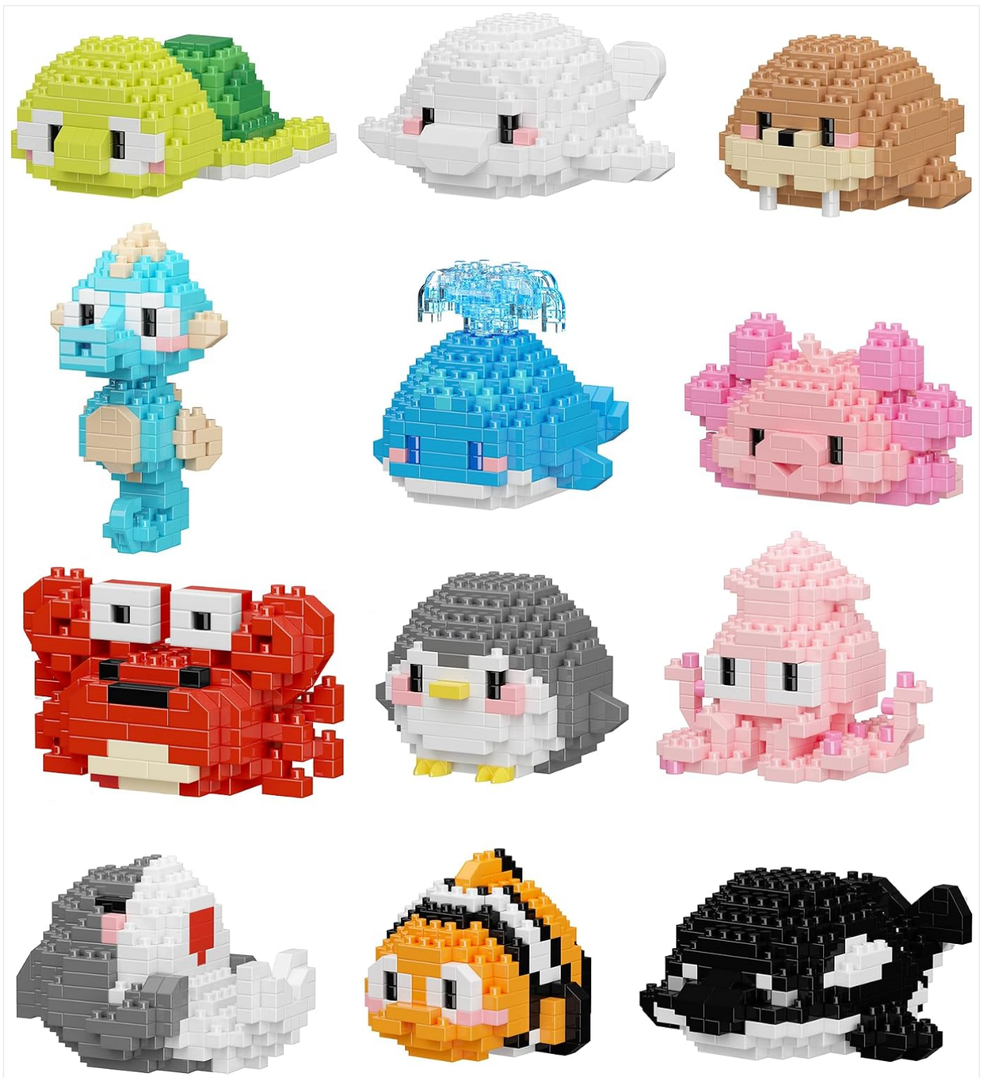
Image: A visual representation of all 12 unique sea animal models fully assembled, including a sea turtle, beluga whale, walrus, seahorse, blue whale, axolotl, crab, penguin, octopus, killer whale, clownfish, and shark.