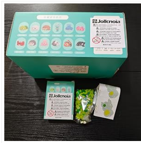
Image: Example of the contents for a single building block set, including the instruction booklet and bagged pieces.