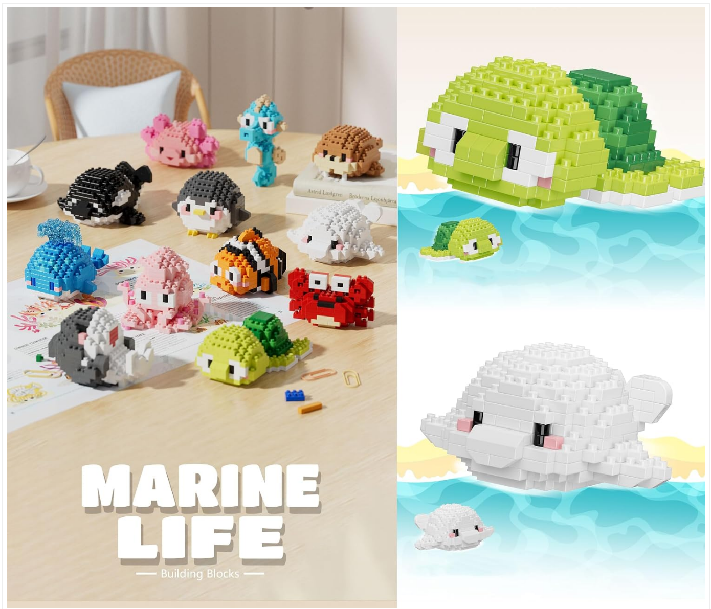
Image: Several assembled sea animal models arranged on a light-colored desk, demonstrating their use as decorative items.