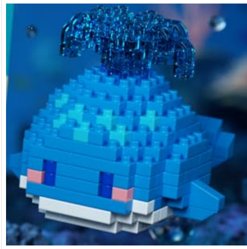
Image: A detailed view of the assembled blue whale model, highlighting the micro block construction and translucent water-spout piece.