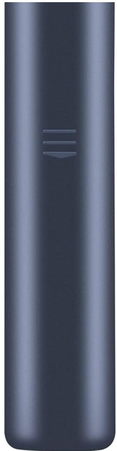
Image 2.1: Front and side view of the TCNOUMT RC802N YU14 remote control, highlighting its ergonomic design.