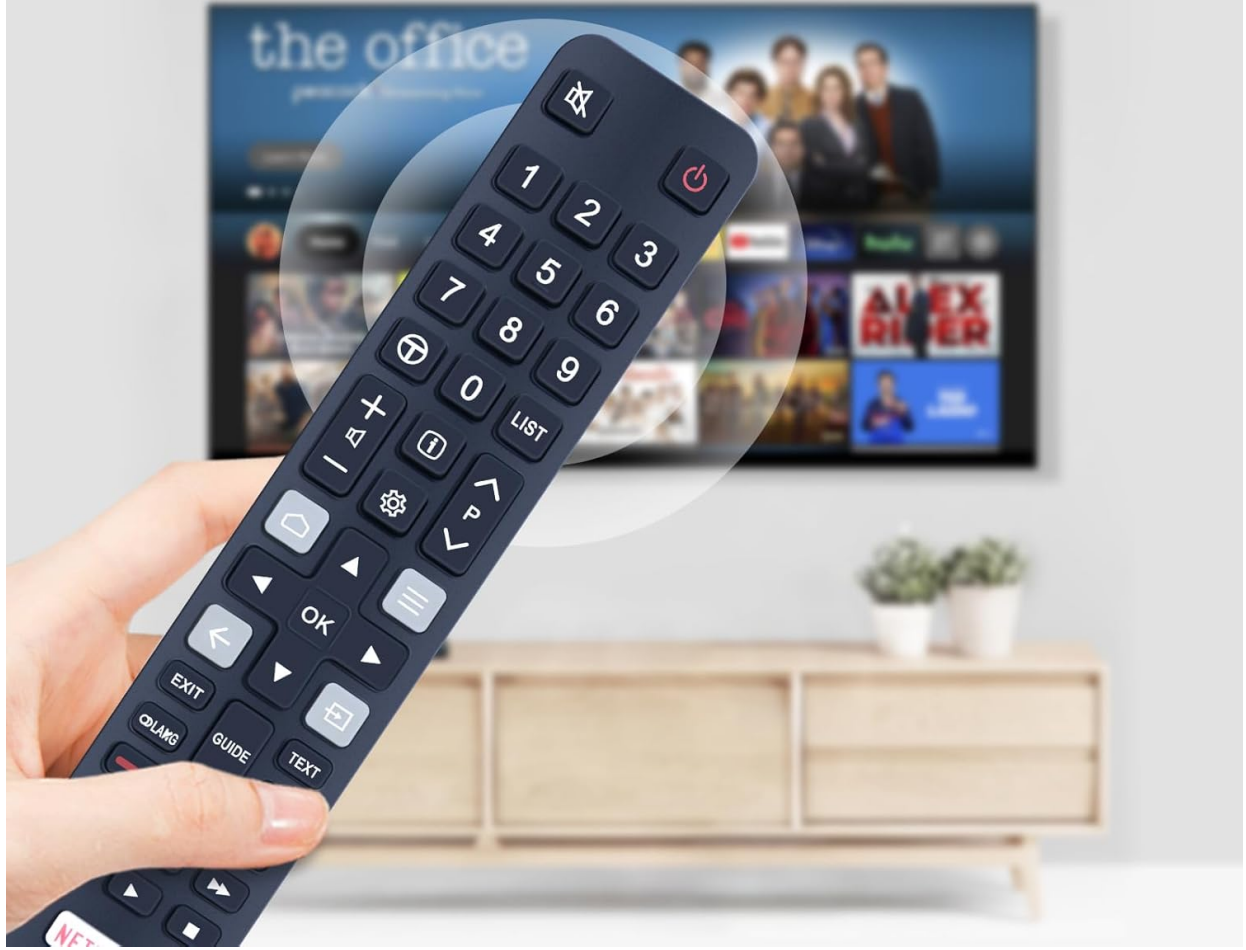
Image 4.2: Demonstrating the remote's long-distance infrared control capability, effective up to 10 meters.

Strongest signal by Infrared technology, further transmission for multi-angle induction. Precisely control far from 10 meters / 33 feet.