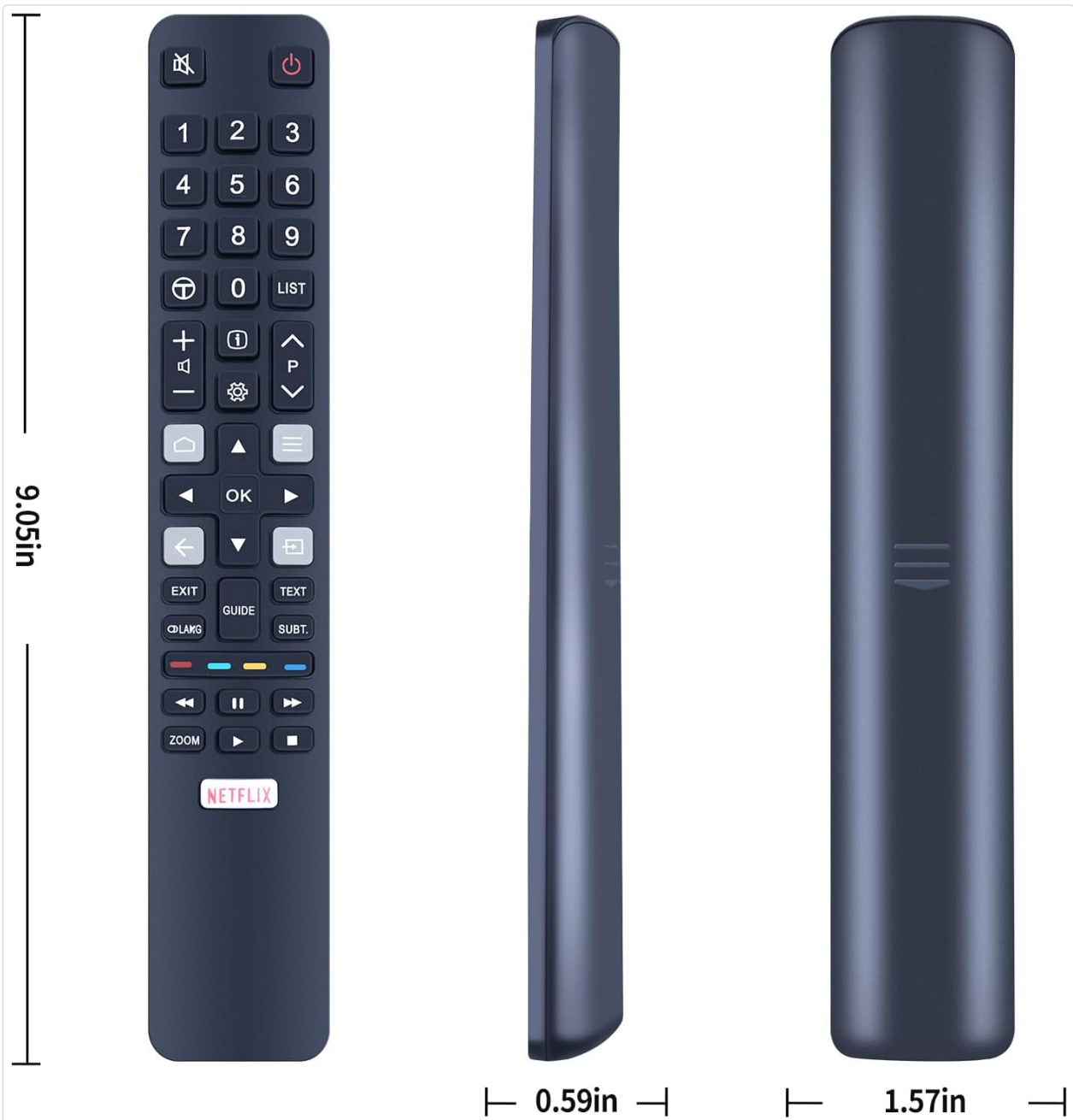
Image 7.1: Physical dimensions of the remote control for reference.