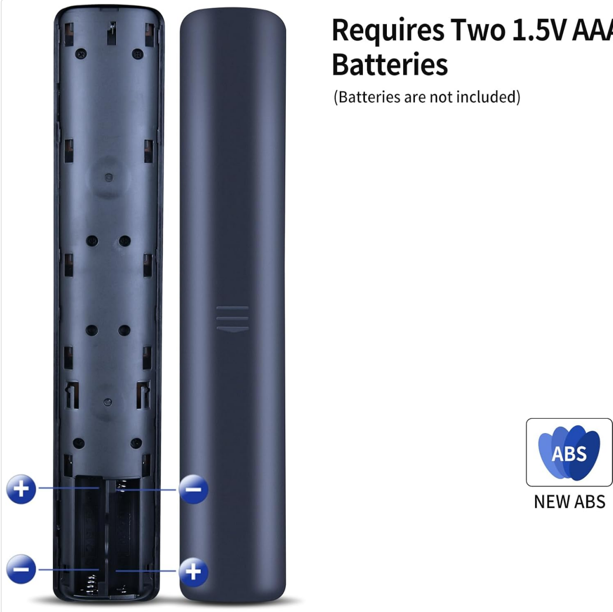
Image 3.1: Illustration of the battery compartment, indicating the correct orientation for AAA battery insertion.