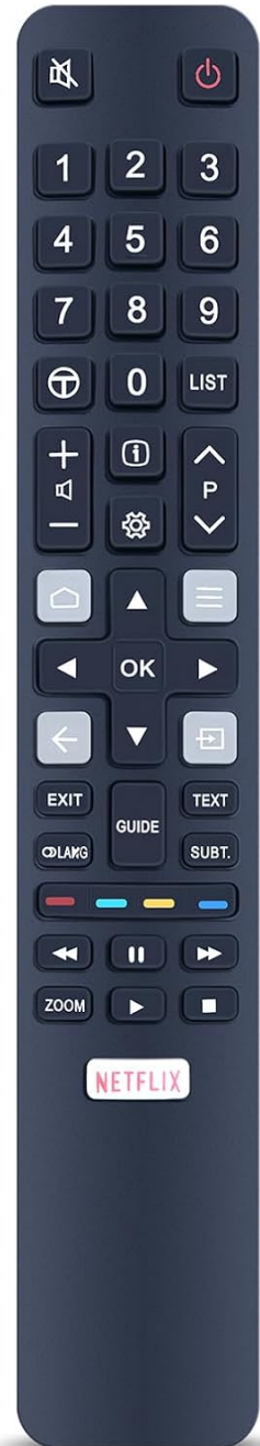
Image 4.1: The remote control featuring a dedicated Netflix shortcut button for quick access to streaming content.