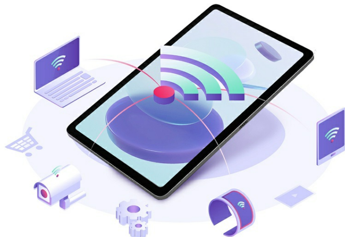
Image: Visual representation of WiFi 6 and Bluetooth 5.0 support, enabling seamless streaming, browsing, and downloading, and connecting to