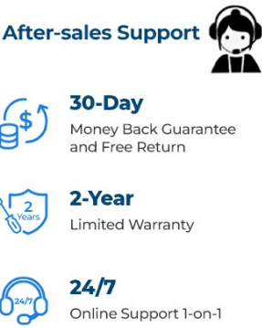
Image: Icons representing after-sales support, including a 30-day money-back guarantee, 2-year limited warranty, and 24/7 online support.

For further assistance, please refer to the warranty card included in your package or visit the official DOOGEE support website.