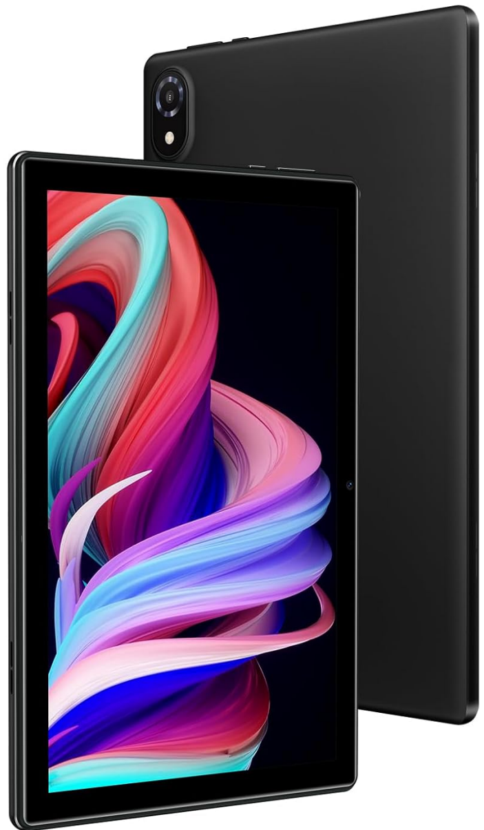
Image: Overview of DOOGEE U10 Tablet's main features including screen size, connectivity, OS, eye protection, memory, battery, and camera specifications.