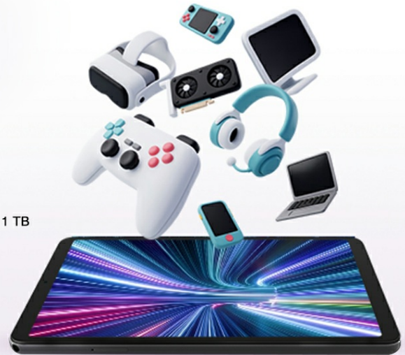
Image: Depiction of the tablet's 128GB ROM and 1TB expandable storage, illustrating ample space for media and files.

Das DOOGEE U10-Tablet verfügt über 128 GB integrierten Speicher für alle Ihre hochauflösenden Videos, Fotos und Dateien. Sie können es mit einer microSD-Karte für noch mehr Speicherplatz erweitern – bis zu 1 TB