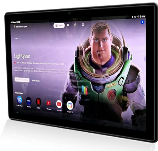
Image: The tablet displaying streaming service logos (Hulu, Amazon, HBO Max) and content, indicating Widevine L1 support for premium content playback.