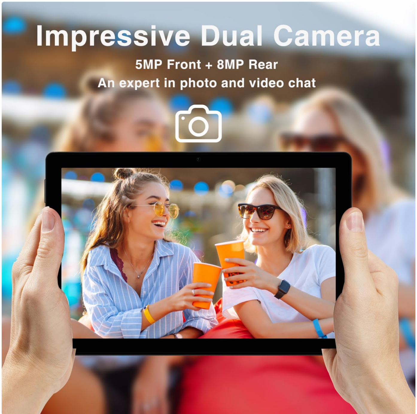
Image: Close-up of the tablet's dual camera system, highlighting the 5MP front and 8MP rear cameras, suitable for photos and video chats.

The DOOGEE U10 features an 8MP rear camera and a 5MP front camera. Open the Camera app to capture photos and videos. Switch between front and rear cameras using the icon on the screen.