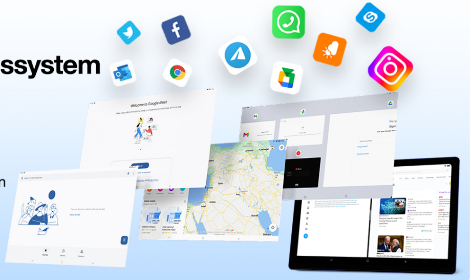
Image: Visual representation of the Android 14 operating system interface, highlighting faster app starts and battery optimization.