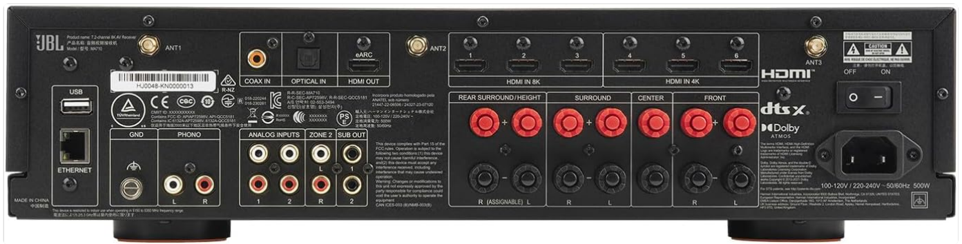
Figure 3.1: Rear panel connections of the JBL MA710, including HDMI, speaker terminals, and audio inputs.