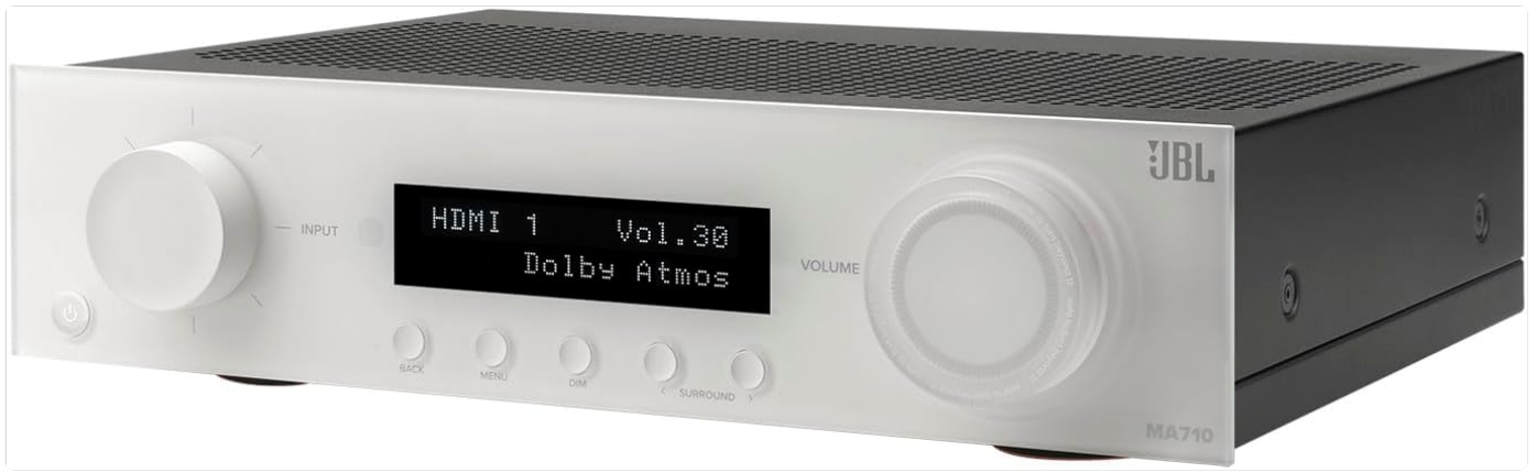
Figure 1.1: Front angled view of the JBL MA710 7.2-Channel 8K AV Receiver in white.