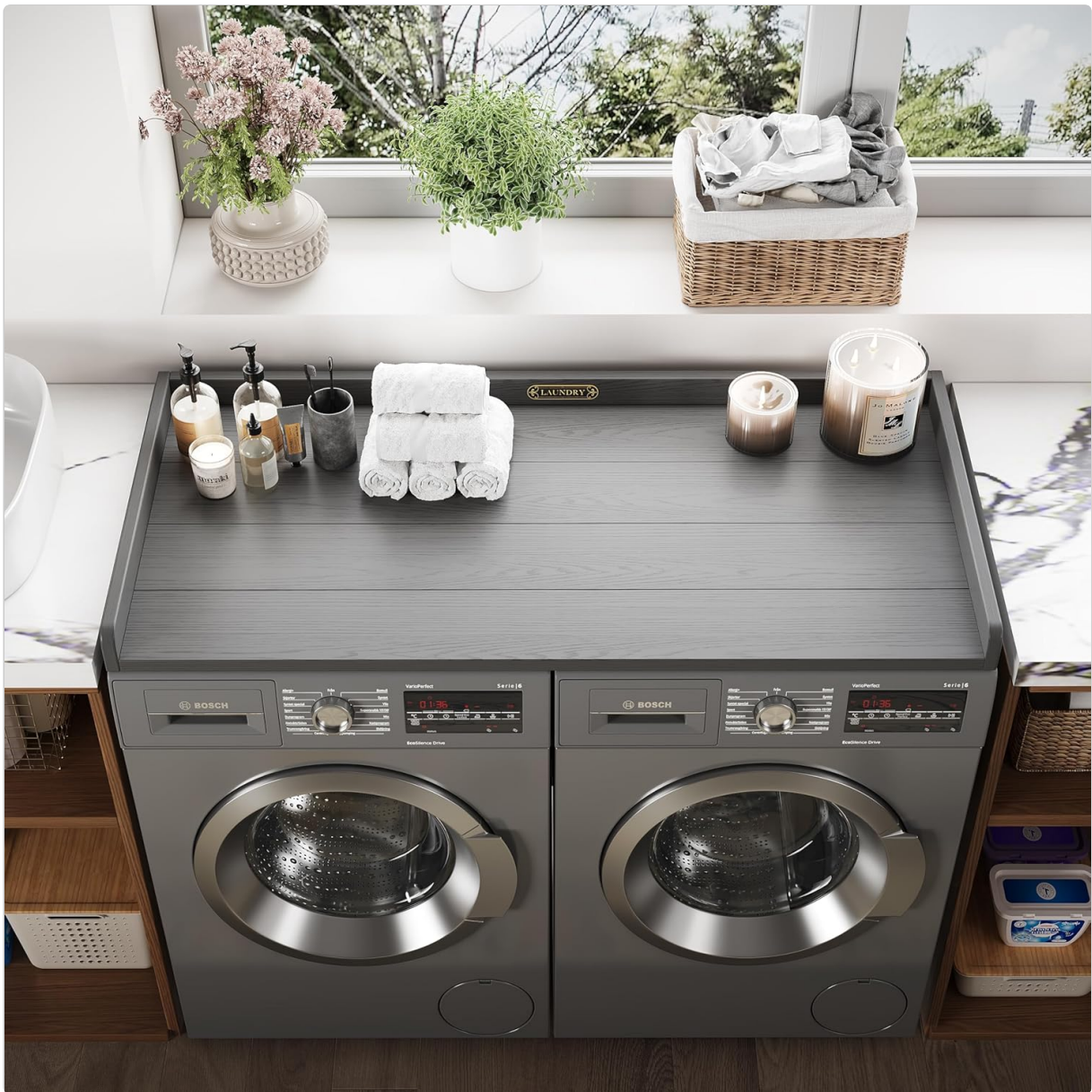
Figure 3: The countertop provides ample space for organizing laundry essentials and folding clothes.