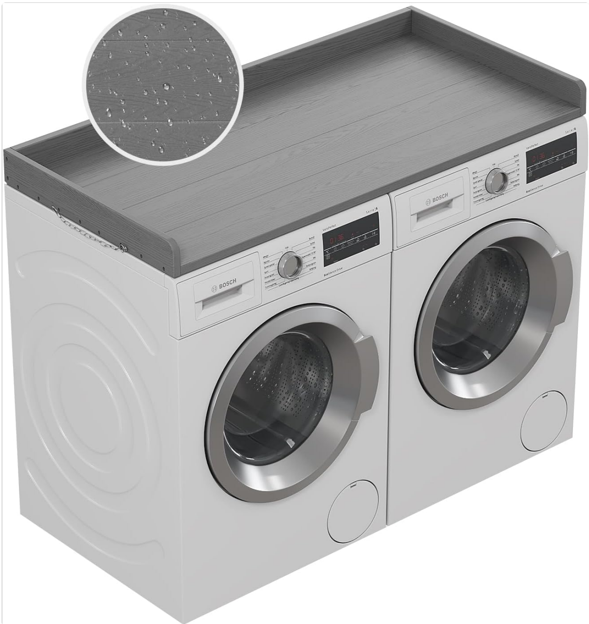
Figure 1: ClimbHope HDPE Washer Dryer Countertop in gray, positioned over a washer and dryer.