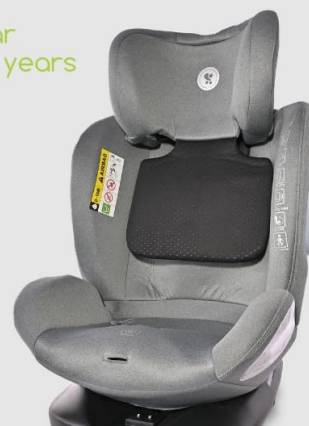
Image: Close-up view of the soft body cushion and the sound alarm feature for an unfastened buckle.