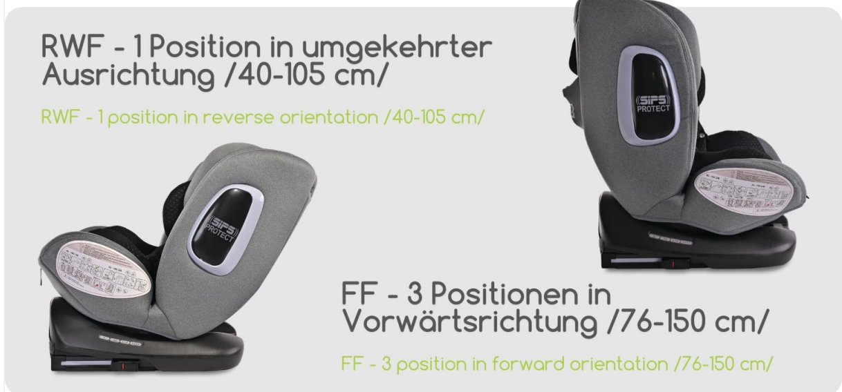
Image: Diagram illustrating the rear-facing (RWF) position for children 40-105 cm and forward-facing (FF) position for children 76-150 cm.