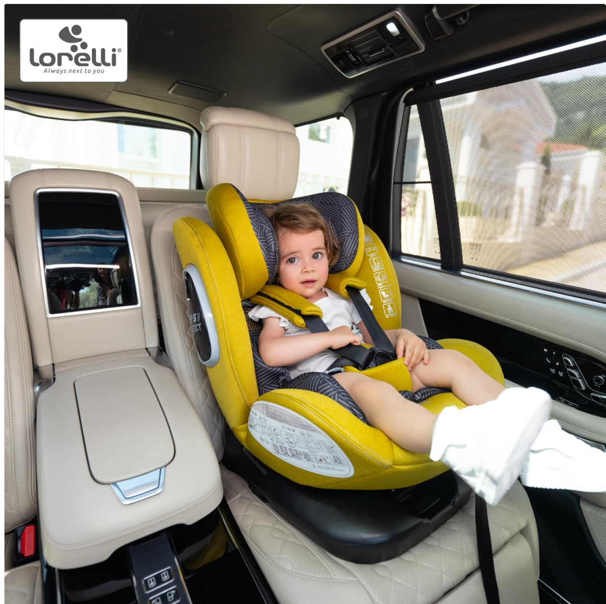
Image: The soft head cushion providing additional comfort and support.