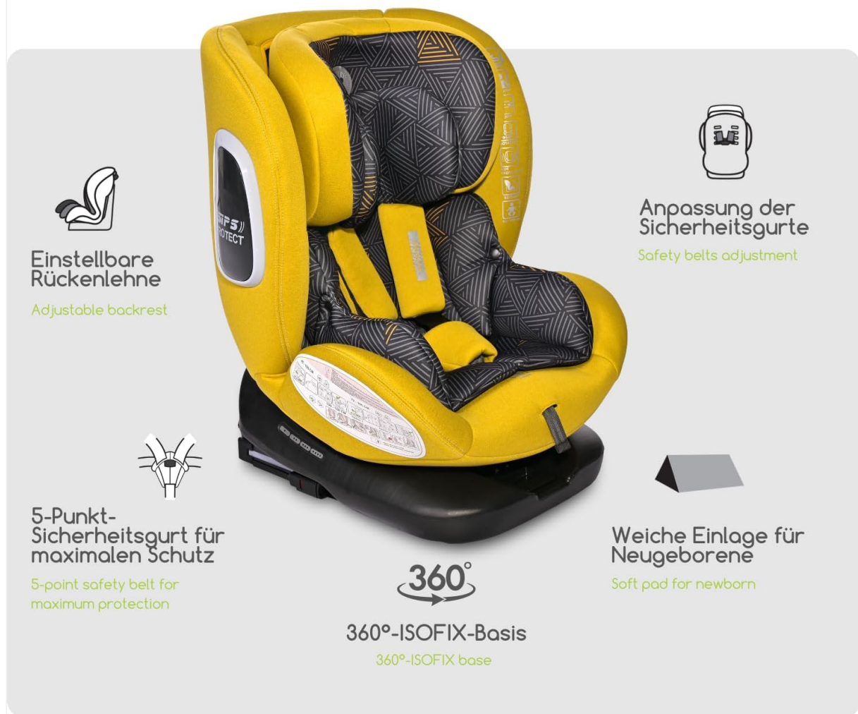
Image: Lorelli Phoenix i-Size Car Seat highlighting key features such as the adjustable backrest, 5-point safety belt, soft pad for newborns, and the 360-degree ISOFIX base.

i-Size Ab Geburt bis 12 Jahre 40-150 cm From birth up to 12 years