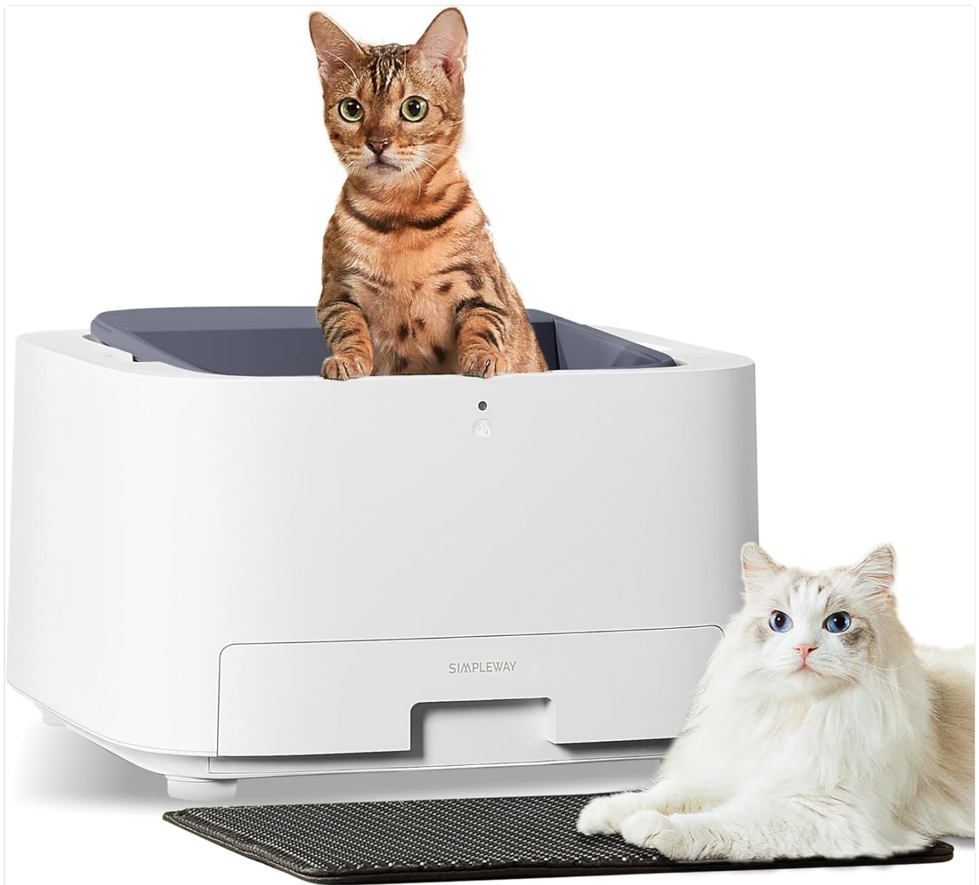
Figure 3: Open-top design suitable for all cat sizes.