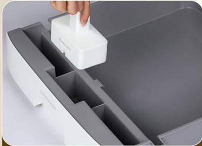
Sealed Waste Bin