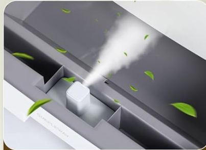
Air Purifying Refills