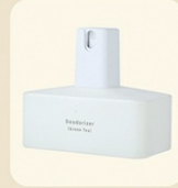
Air Purifying Refills