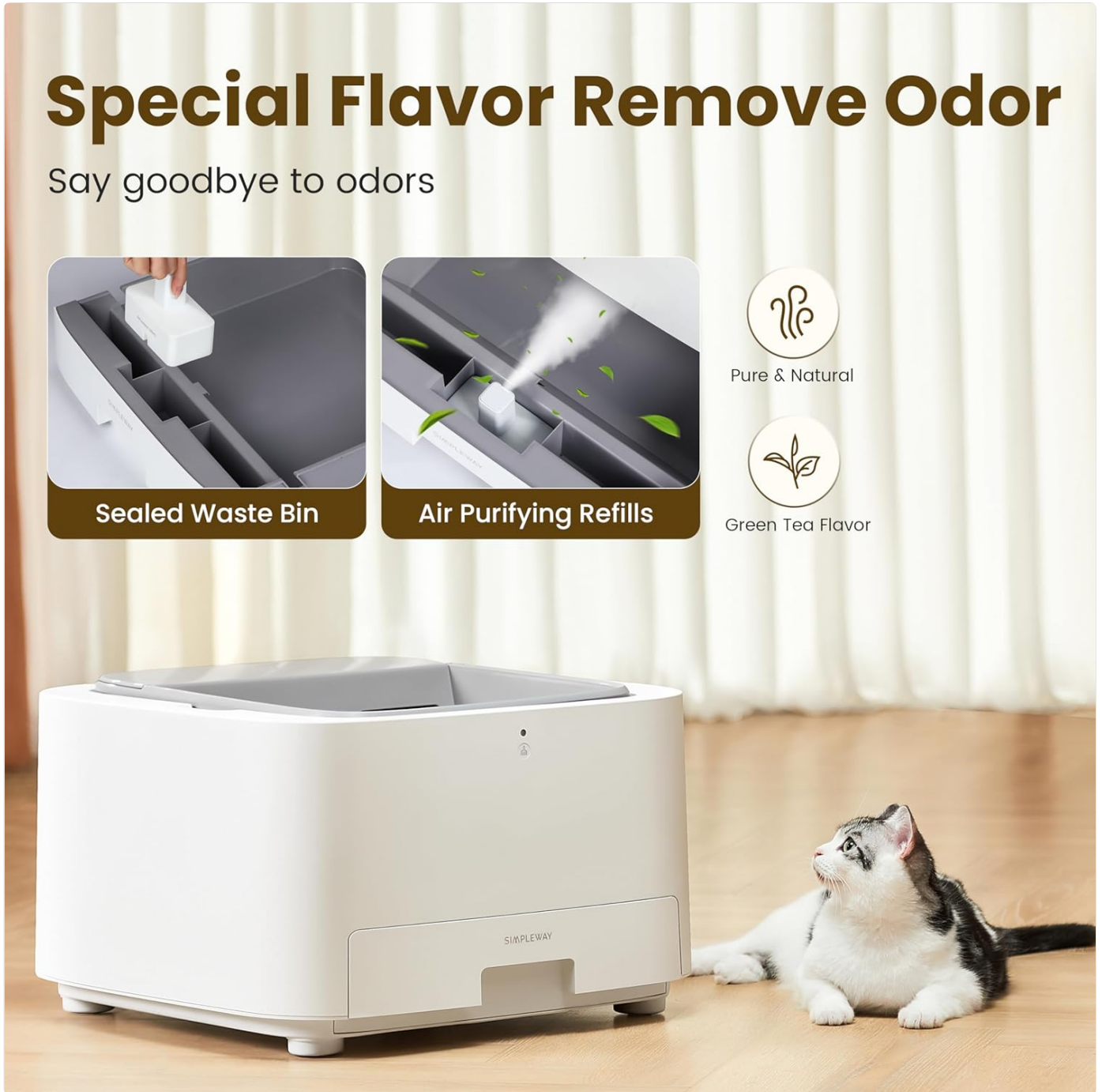
Figure 6: Odor removal system with air purifier and sealed waste bin.