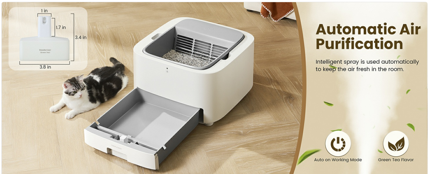
Figure 7: Automatic air purification for a fresh home environment.