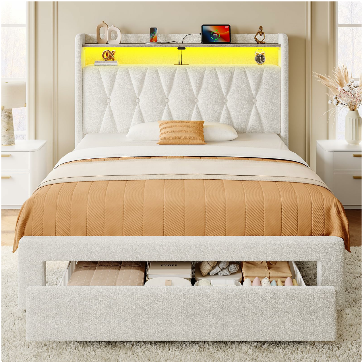
Overall view of the Rolanstar Twin Bed Frame in beige, highlighting its storage headboard and under-bed drawer.