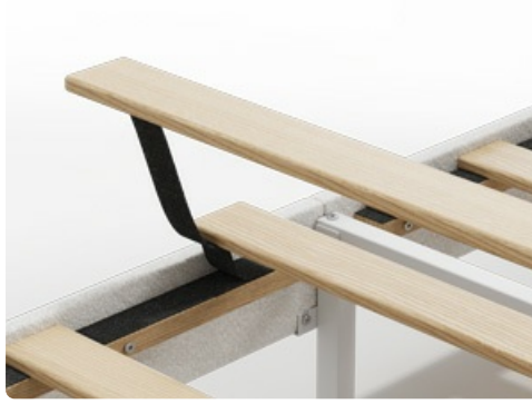
Image illustrating the ease of assembly for the bed frame.

Assembly of the Rolanstar Twin Bed Frame is designed to be straightforward. All necessary tools, illustrated instructions, and numbered parts are included to facilitate a hassle-free setup experience. No professional skills are required.