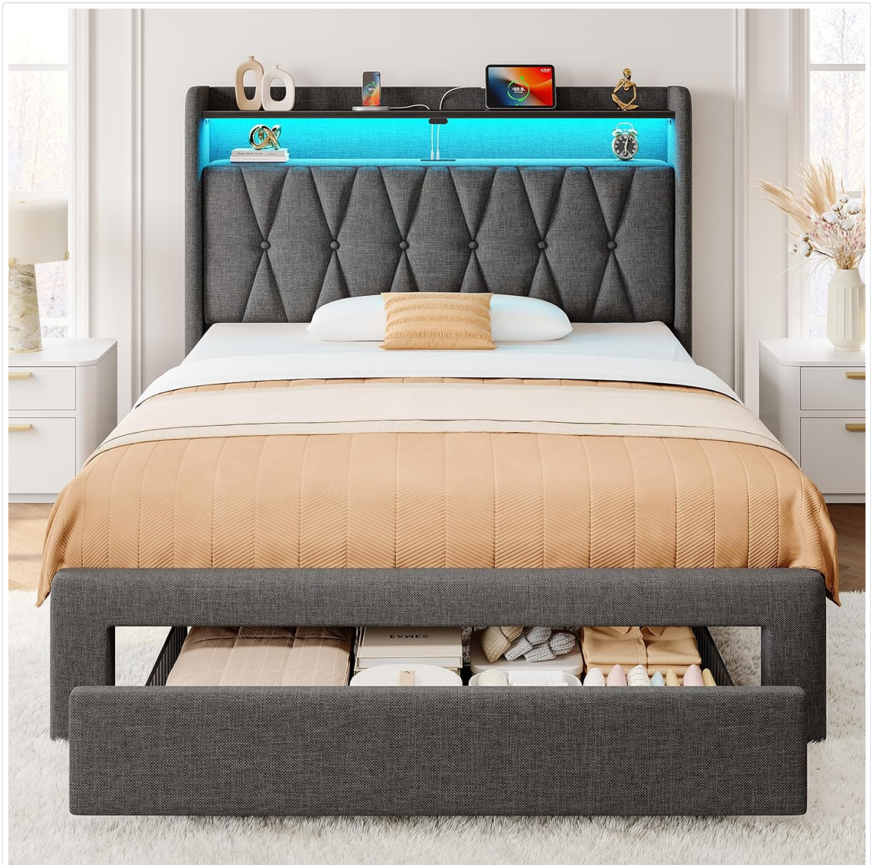
Image: Rolanstar Twin Bed Frame dimensions and weight capacity.