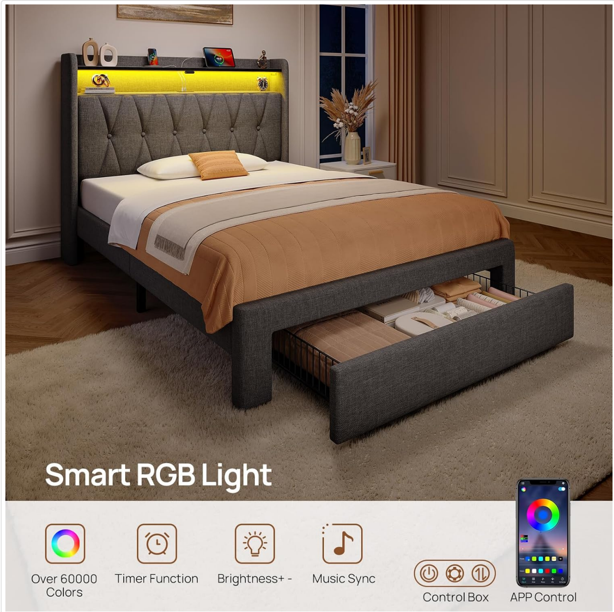
Image: Bed frame with LED lights active, demonstrating color options and the storage drawer.

Alternatively, a physical control box may be present on the headboard for basic functions like power on/off and color cycling.