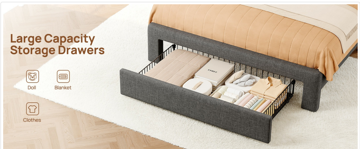
Image: Under-bed storage drawer with contents.