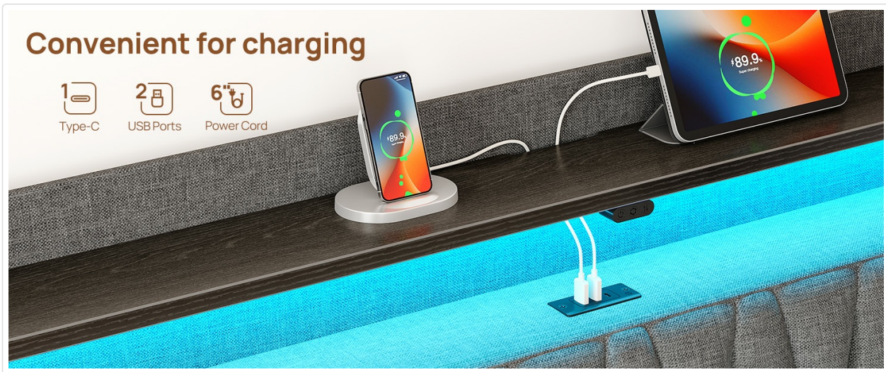
Image: Convenient charging ports on the headboard.