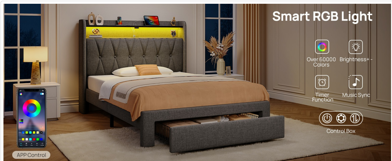
Image: RGB LED light strip and mobile app control interface.