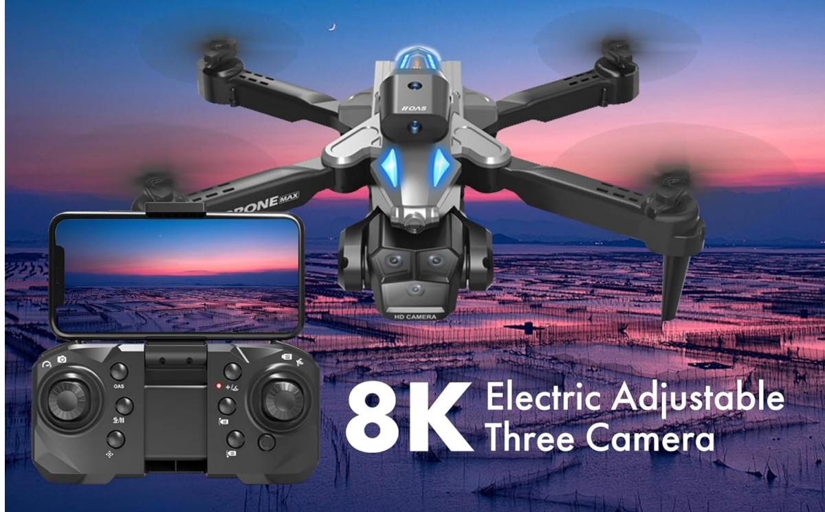
Image: The drone's remote controller with a smartphone mounted, showing the live video feed from the drone's camera via the mobile application.

Through the cell phone APP, you can watch the real-time images captured by the drone in real time, high-definition transmission without delay