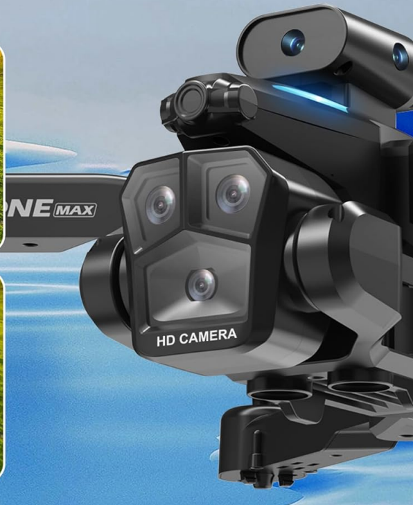
Image: A detailed view of the drone's camera module, emphasizing its capabilities including 90-degree remote control adjustment, 120-degree wide-angle view, and 50x zoom.