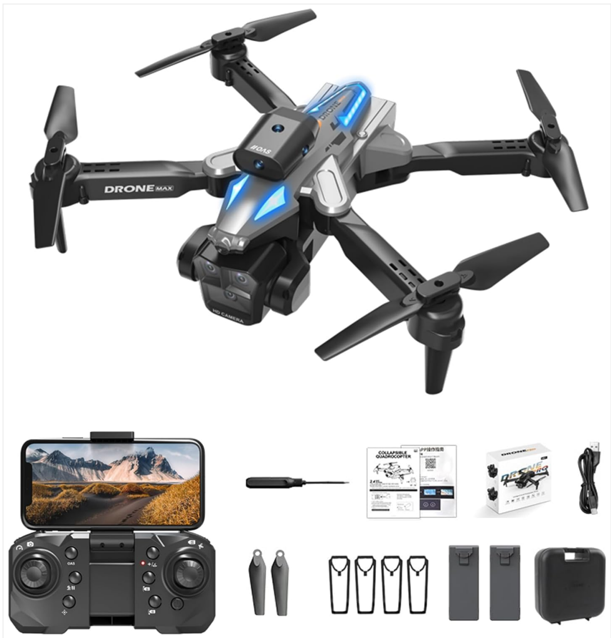
Image: The TIMEONIA C10 Mini Drone with its remote controller, spare propellers, batteries, USB charging cable, screwdriver, and protective case.