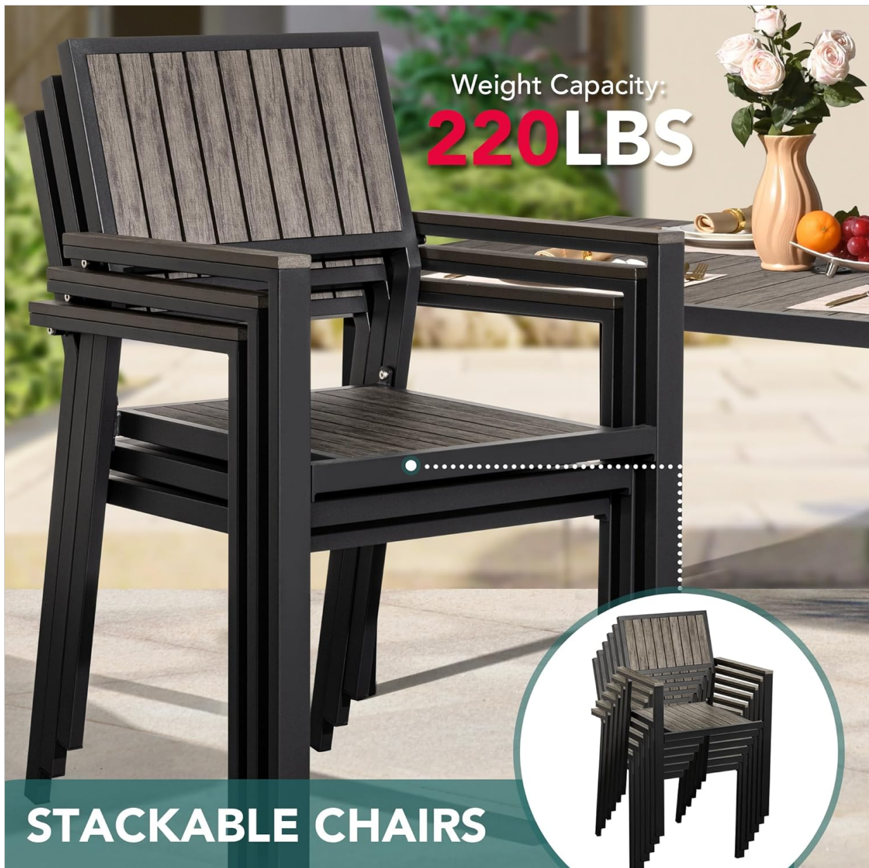
Image 3.1: The chairs feature a stackable design for convenient storage.