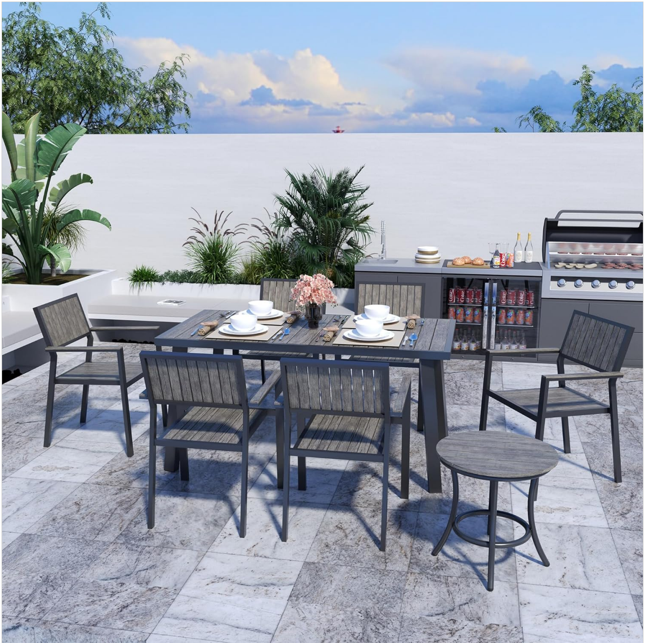
Image 1.1: The Pamapic Aluminum Outdoor Dining Set in a patio environment.