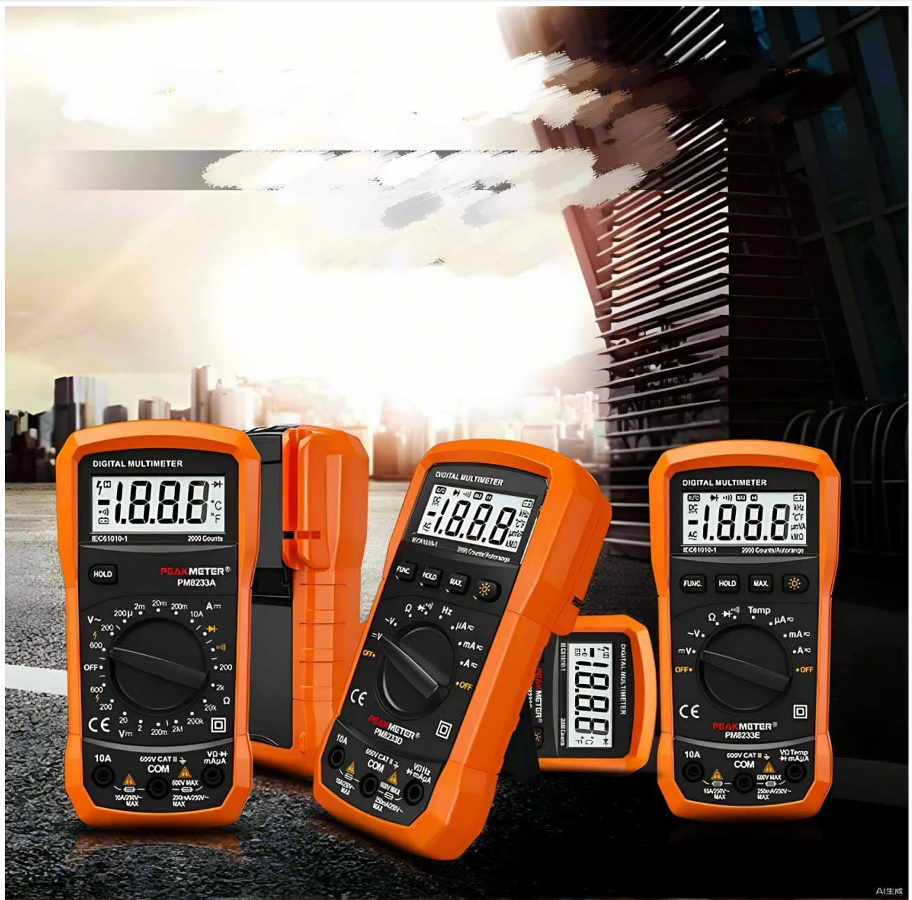
Figure 1: PEAKMETER PM8233D Digital Multimeter.