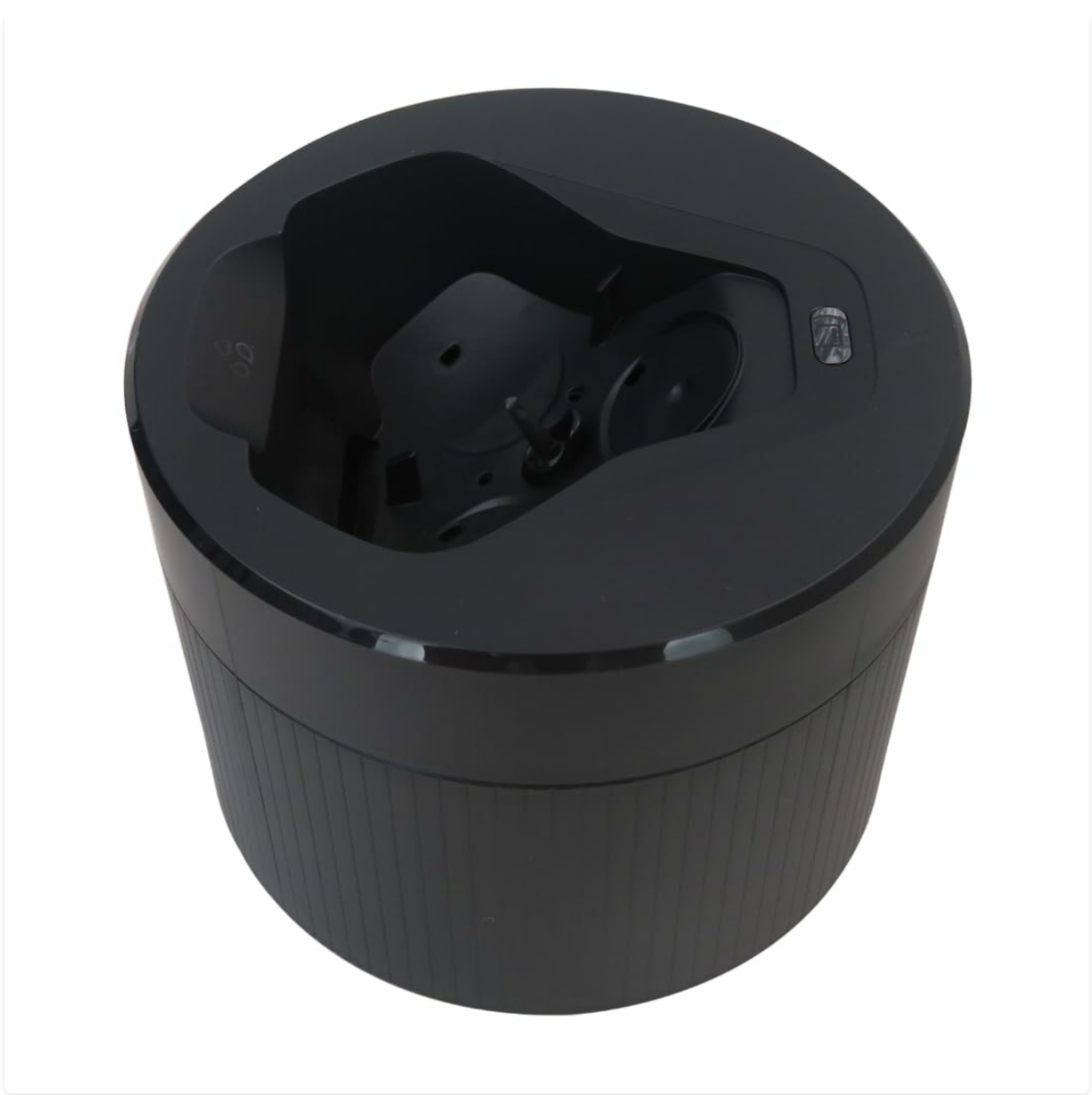
A top-down view of the Acupress Quick Clean Pod, showing the internal compartment where cleaning solution is added.