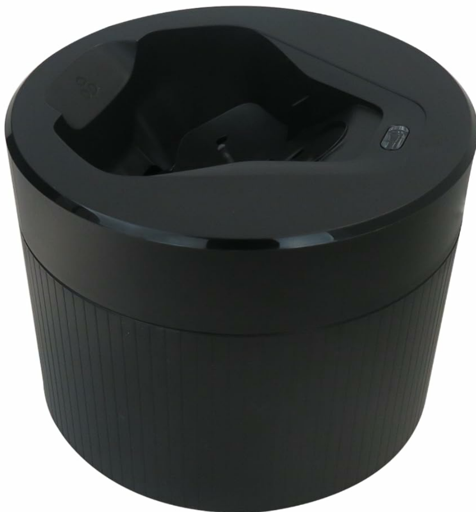
A detailed view of an electric shaver correctly positioned within the Acupress Quick Clean Pod, ready for a cleaning cycle.