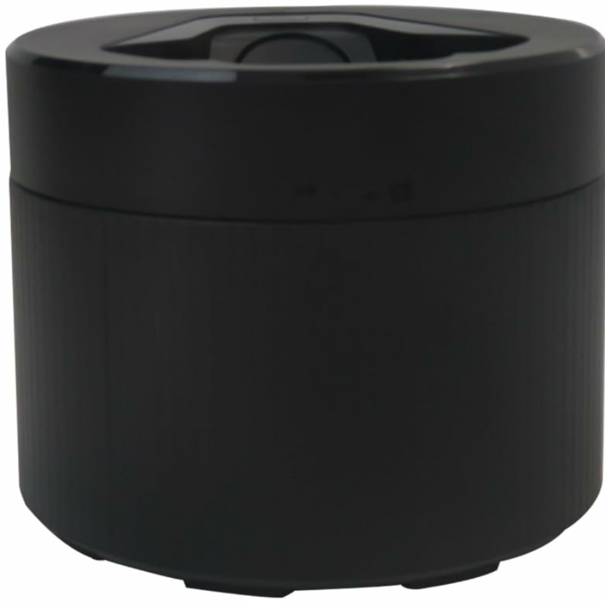
A black cylindrical Quick Clean Pod, designed for cleaning Philips Norelco electric shavers.