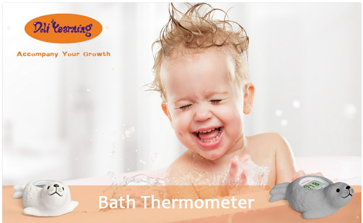
Image: A happy baby splashing in a bathtub with the Doli Yearning thermometer floating nearby, illustrating its use during bath time.