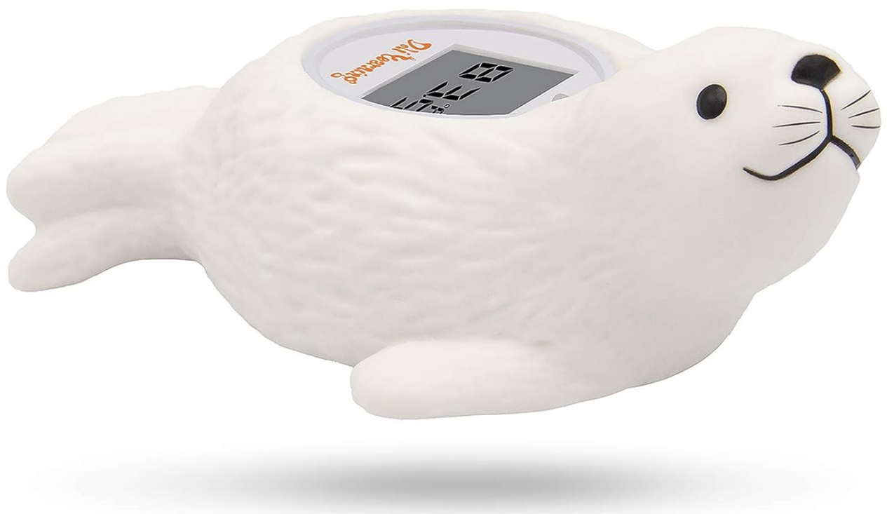
Image: The Doli Yearning Seal Shape Baby Bath Thermometer, showing its white, seal-like form with a digital display on its back.