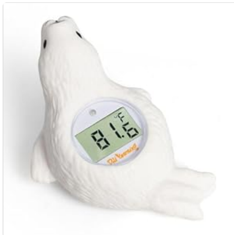
Image: A close-up of the seal-shaped thermometer floating in water, with its digital display showing a temperature reading.

Place the thermometer directly into the bath water. The large LCD display will show the water temperature within approximately 1 second. The thermometer will float, allowing for continuous monitoring during bath time.