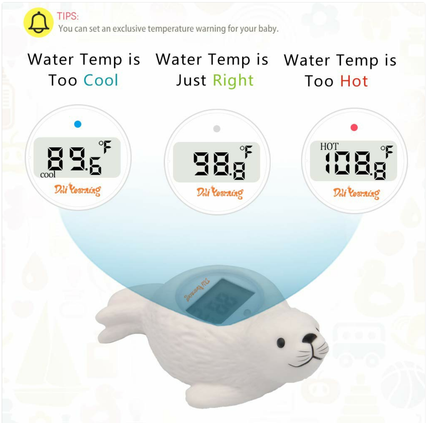
Image: A diagram illustrating the thermometer's display for different water temperatures: 'Too Cool' with a blue dot, 'Just Right' with no dot, and 'Too Hot' with a red dot and 'HOT' warning.