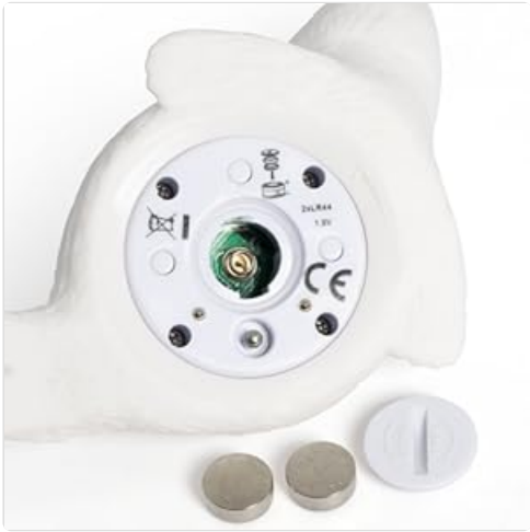
Image: A visual guide showing the battery compartment opened with two LR44 button batteries removed, illustrating the battery replacement process.

When the display becomes dim or unresponsive, it is time to replace the batteries. Follow the steps outlined in the "Setup" section (Section 4). It is crucial to ensure the battery cover is securely fastened after replacement to maintain the device's waterproof rating.