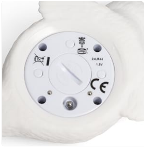
Image: A close-up view of the thermometer's battery compartment, showing the circular cover and the screw that secures it.