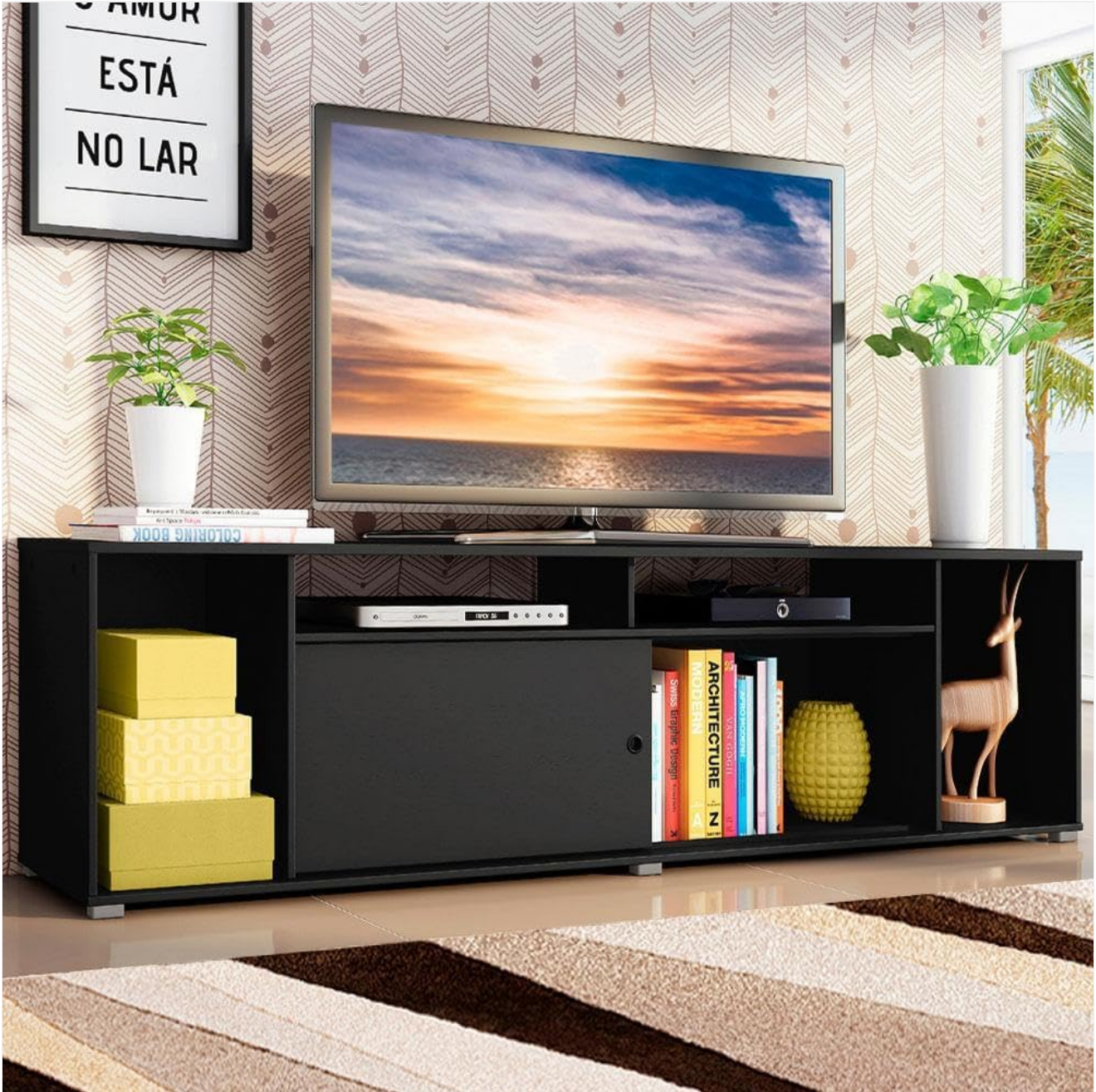
Figure 4.1: Fully assembled Madesa Cancun TV Stand, showcasing its design and capacity for a television and various media accessories.

Follow these steps carefully for proper assembly. It is recommended to assemble the unit on a soft, clean surface to prevent scratches.