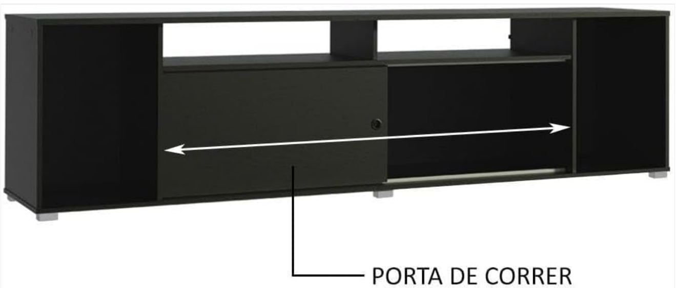
Figure 4.4: Illustration of the sliding door feature, indicating its movement along the track to reveal or conceal compartments.