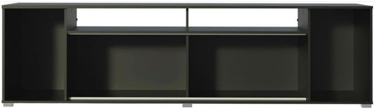
Figure 4.8: Front view of the TV stand, illustrating the open compartments and the functionality of the sliding door.