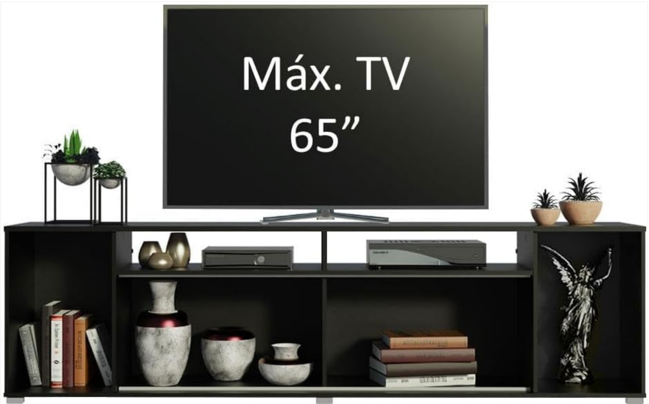
Figure 4.3: The TV stand is designed to support televisions up to a maximum size of 65 inches.