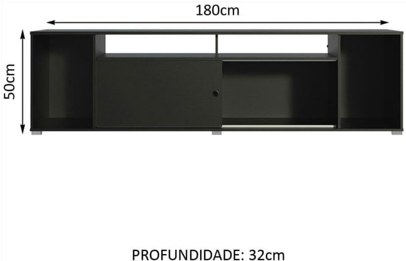
Figure 4.2: Key dimensions of the TV stand, showing a width of 180 cm, a height of 50 cm, and a depth of 32 cm.