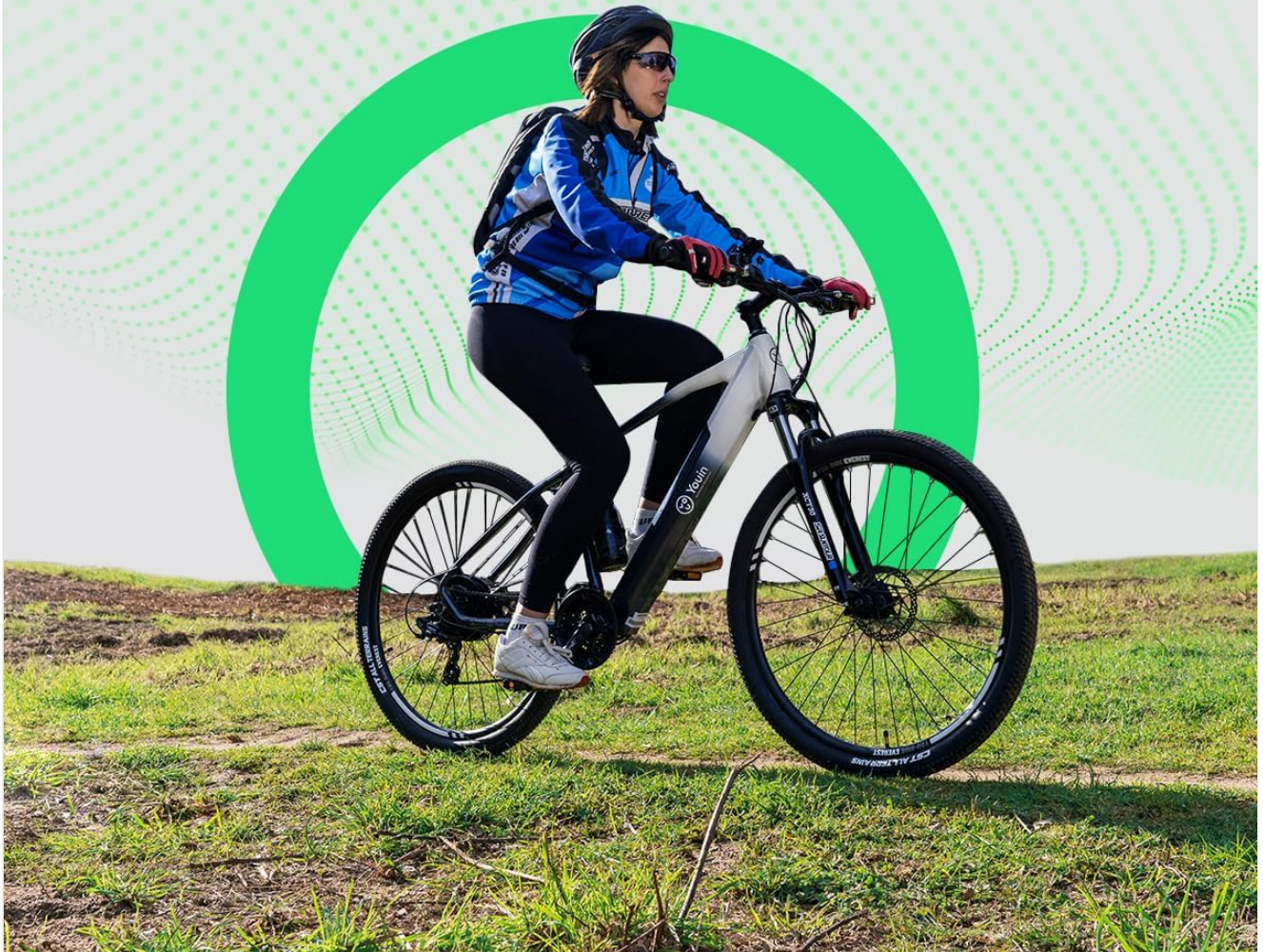
Figure 4: A rider comfortably navigating terrain on the Youin Everest, demonstrating its stable and comfortable ride.