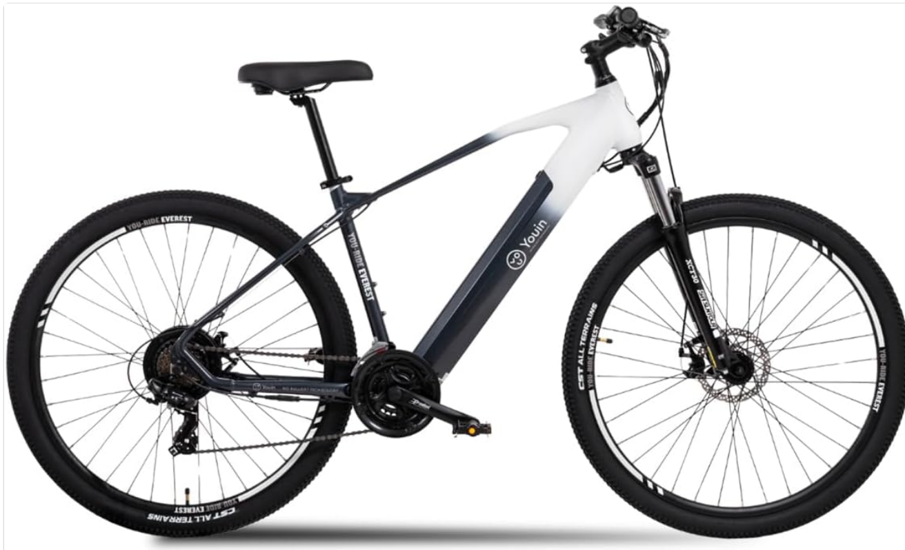
Figure 1: The Youin Everest Electric Mountain Bike, showcasing its sleek design and robust frame.

The Youin Everest is designed for both mountain adventures and urban routes, offering a robust aluminum alloy frame, front suspension, and powerful electric assistance to enhance your riding experience.