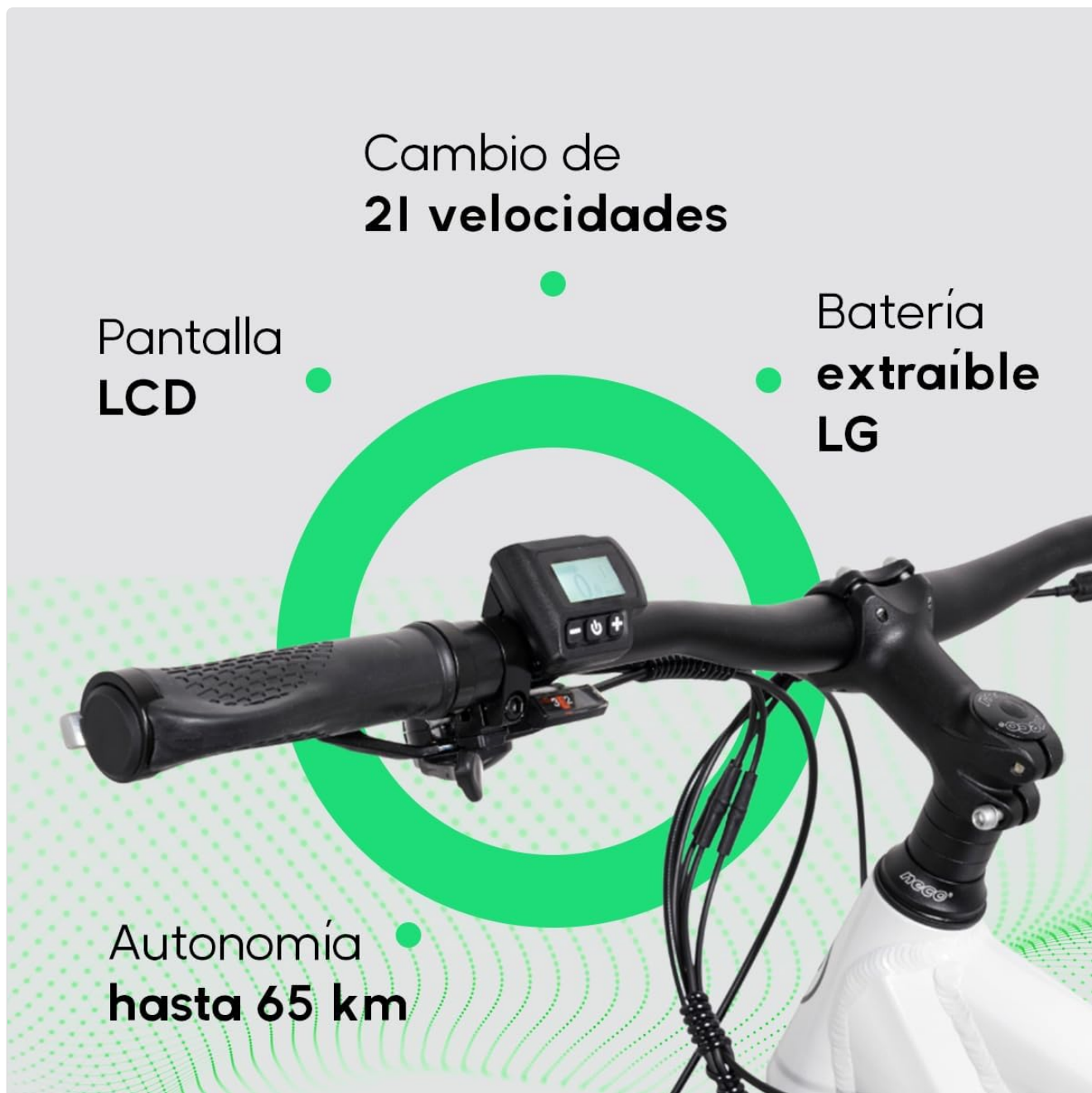
Figure 2: Close-up of the Youin Everest's handlebars, showing the LCD display and control buttons for electric assistance.