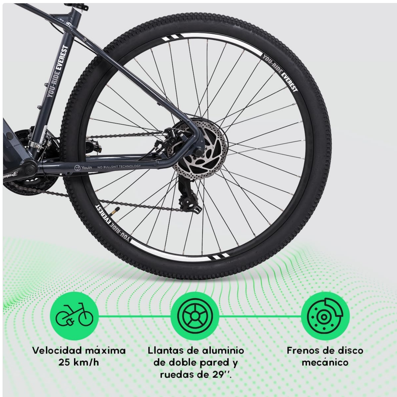
Figure 3: Detail of the Youin Everest's rear wheel, highlighting the mechanical disc brake and double-walled aluminum rim.

The bike features Ruipute DSC-730A mechanical disc brakes on both front and rear wheels for reliable stopping power in various conditions. Apply both brakes simultaneously for effective and controlled deceleration. Avoid sudden, hard braking, especially at high speeds.