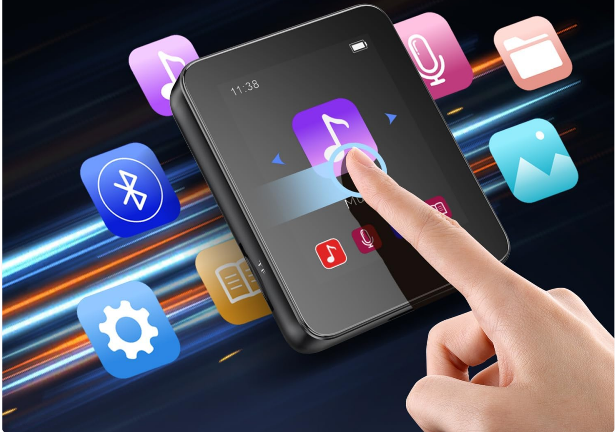
Image 4.1: The EAKKOR T10's sensitive full-screen touch interface, showing various application icons for user-friendly navigation.

simple and intuitive design for quick start and smooth function switching