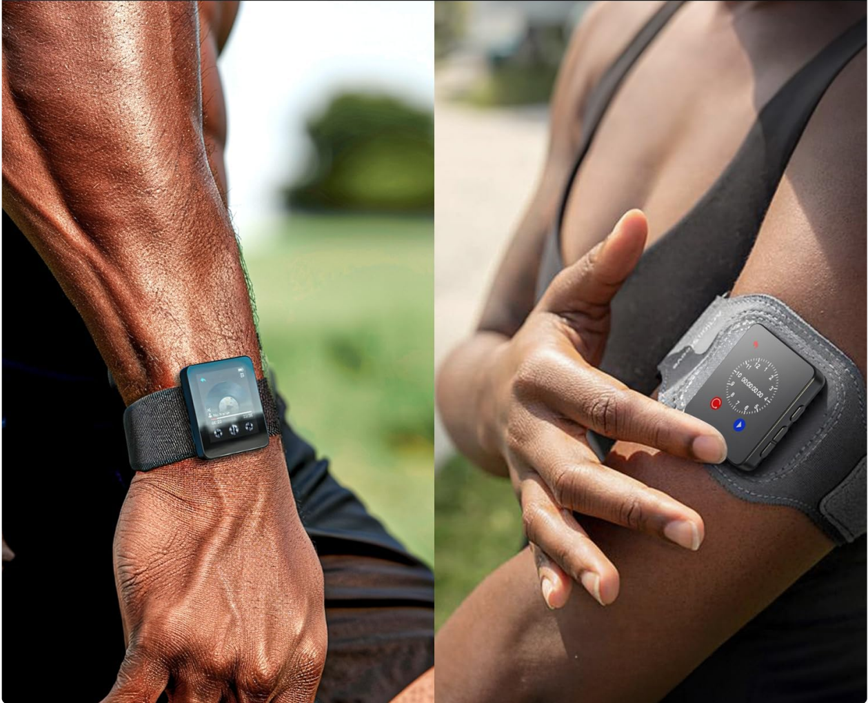
Image 1.1: Front view of the EAKKOR T10 Voice Activated Recorder, showcasing its compact design and display.