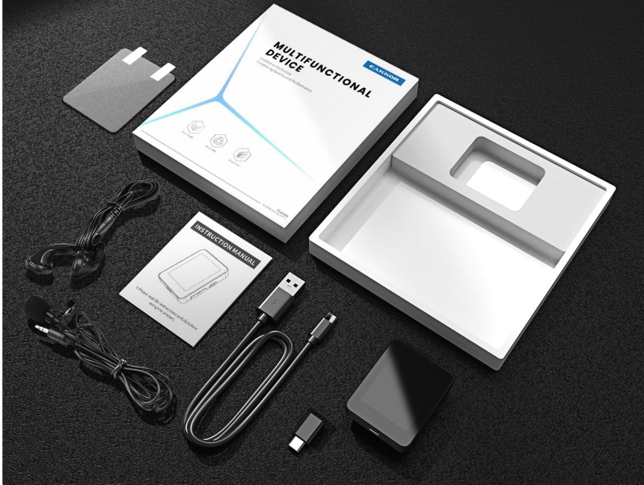
Image 2.1: All components included in the EAKKOR T10 Voice Activated Recorder package, laid out for inspection.