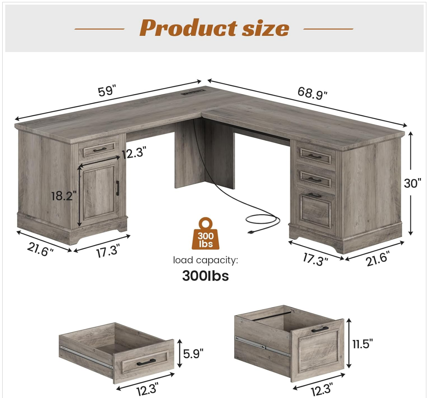
Figure 3.1: Product Dimensions and Load Capacity. This diagram illustrates the overall size of the desk and its individual components, along with the maximum weight it can support.

Important Safety Note: Always assemble the desk according to the provided instructions. Ensure all screws are tightened securely, especially at the tabletop, to maintain stability and prevent accidents.