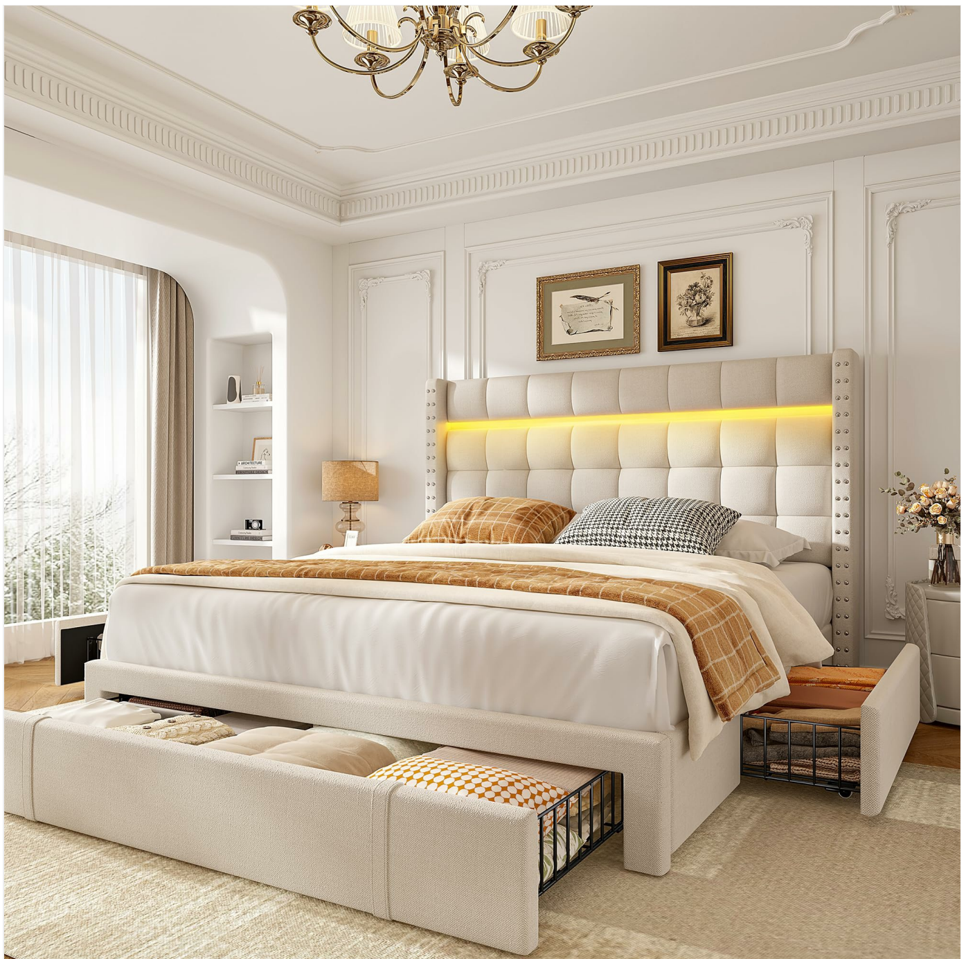
Image: The EnHomee Full Bed Frame in beige, showcasing its upholstered headboard with LED strip, three storage drawers, and overall dimensions.