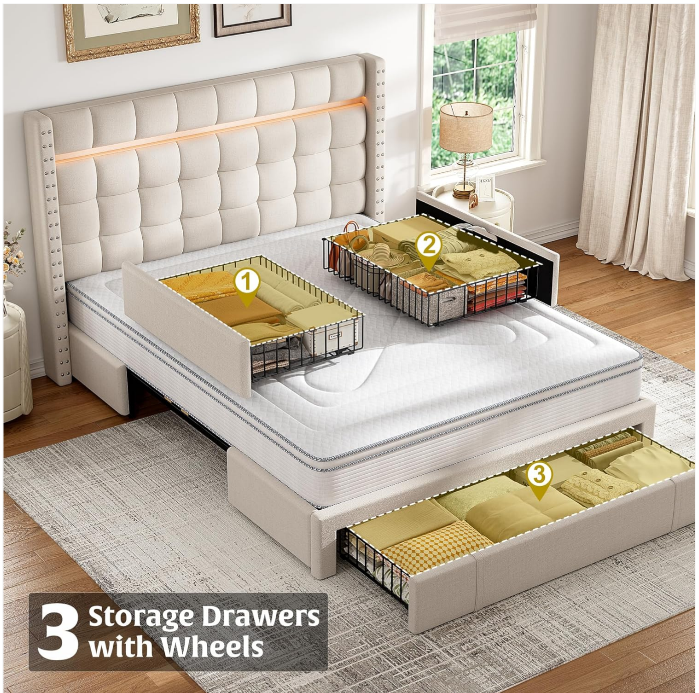
Image: Illustration of the three storage drawers, highlighting their individual design and placement under the bed frame.