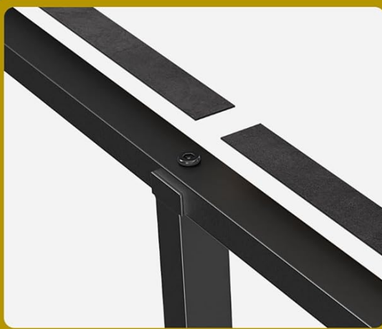
Thickened buffer foam