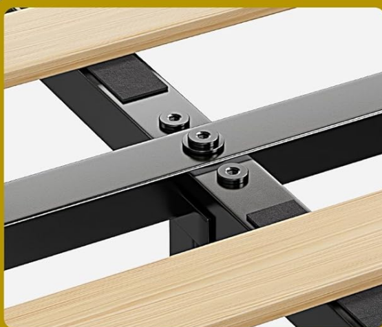
Heavy Duty Metal Frame