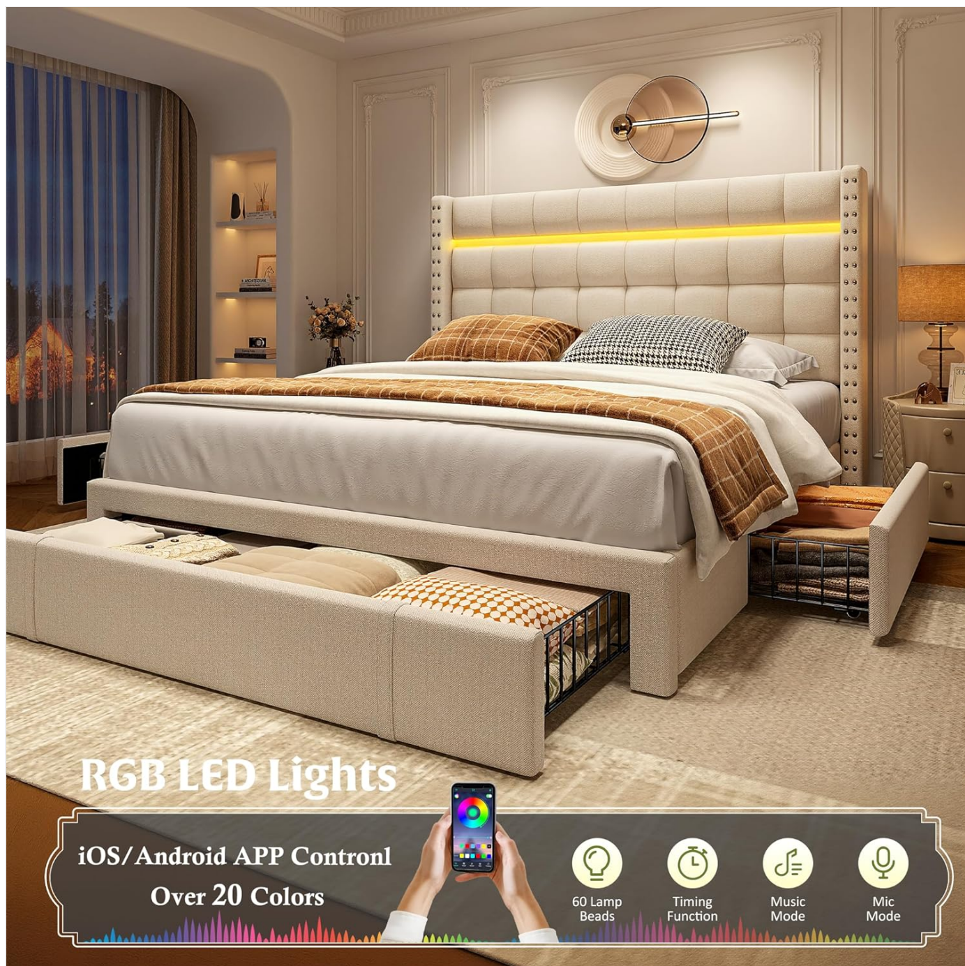
Image: The upholstered headboard with its integrated LED lighting strip, demonstrating various color options and control via a mobile app.