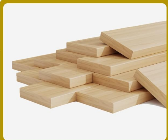
12 Sturdy Wooden Slats

Image: Close-up view of key components including thickened buffer foam, convenient assembly points, heavy-duty metal frame, and 12 sturdy wooden slats.