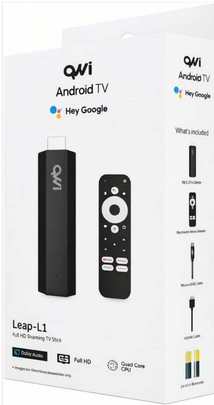
Image 3.2: Front of the QWi Leap L1 product box, showing the device and remote.