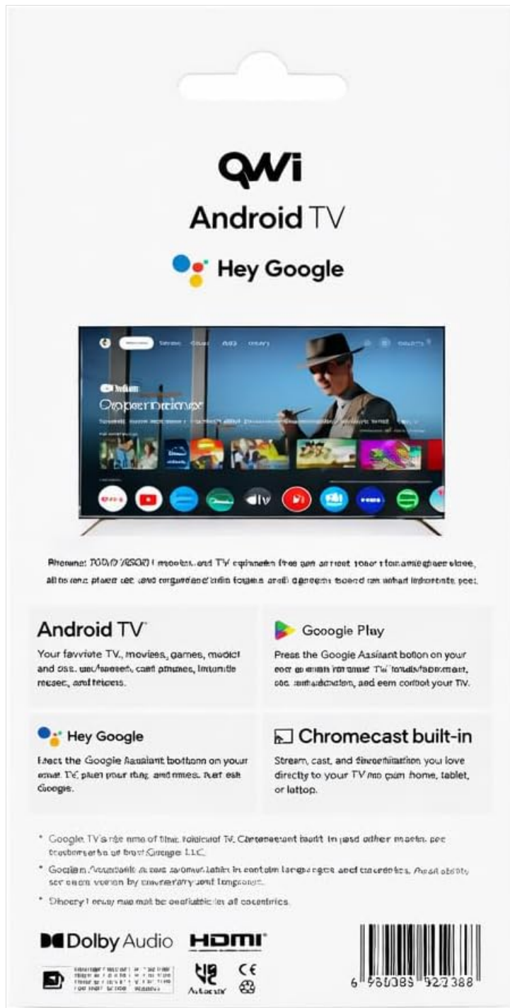
Image 4.2: Detailed view of the QWi Leap L1 TV Stick, showing the QWi logo.