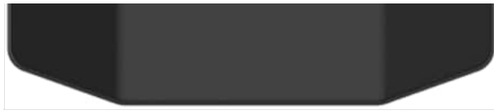
Image 4.3: Back of the product box, highlighting key features such as Android TV, Google Assistant, and Chromecast.