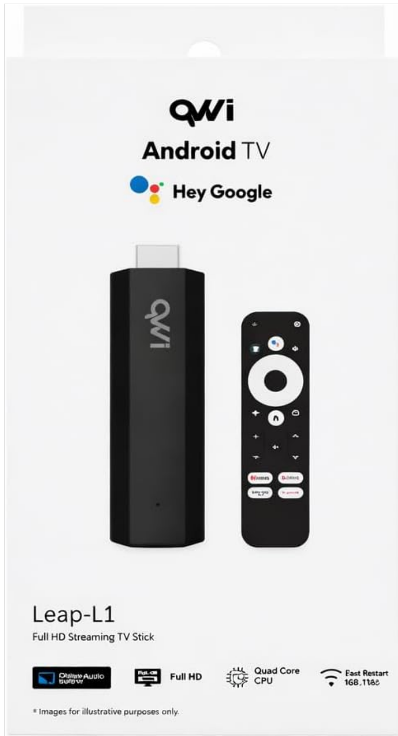
Image 4.1: Various angles of the QWi Leap L1 TV Stick, highlighting its compact design and ports.