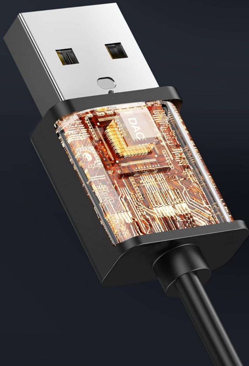
Image: USB plug with smart IC, detailing built-in safety protections against over-charge, short-circuit, and over-heating.