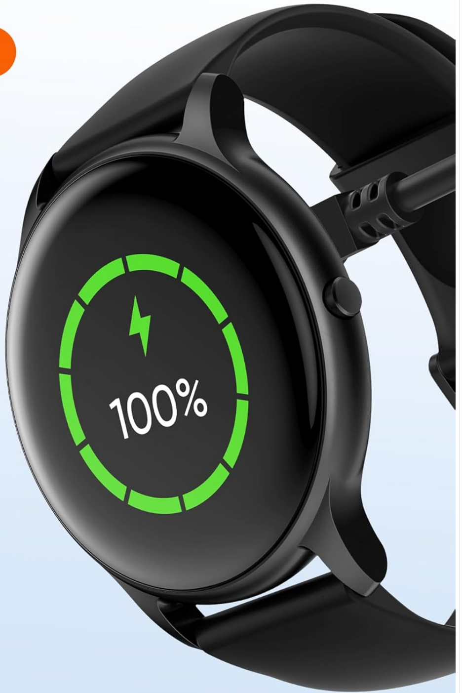
Image: Smartwatch charging, emphasizing the cable's durability with a 3000+ bend lifespan and copper cord construction.