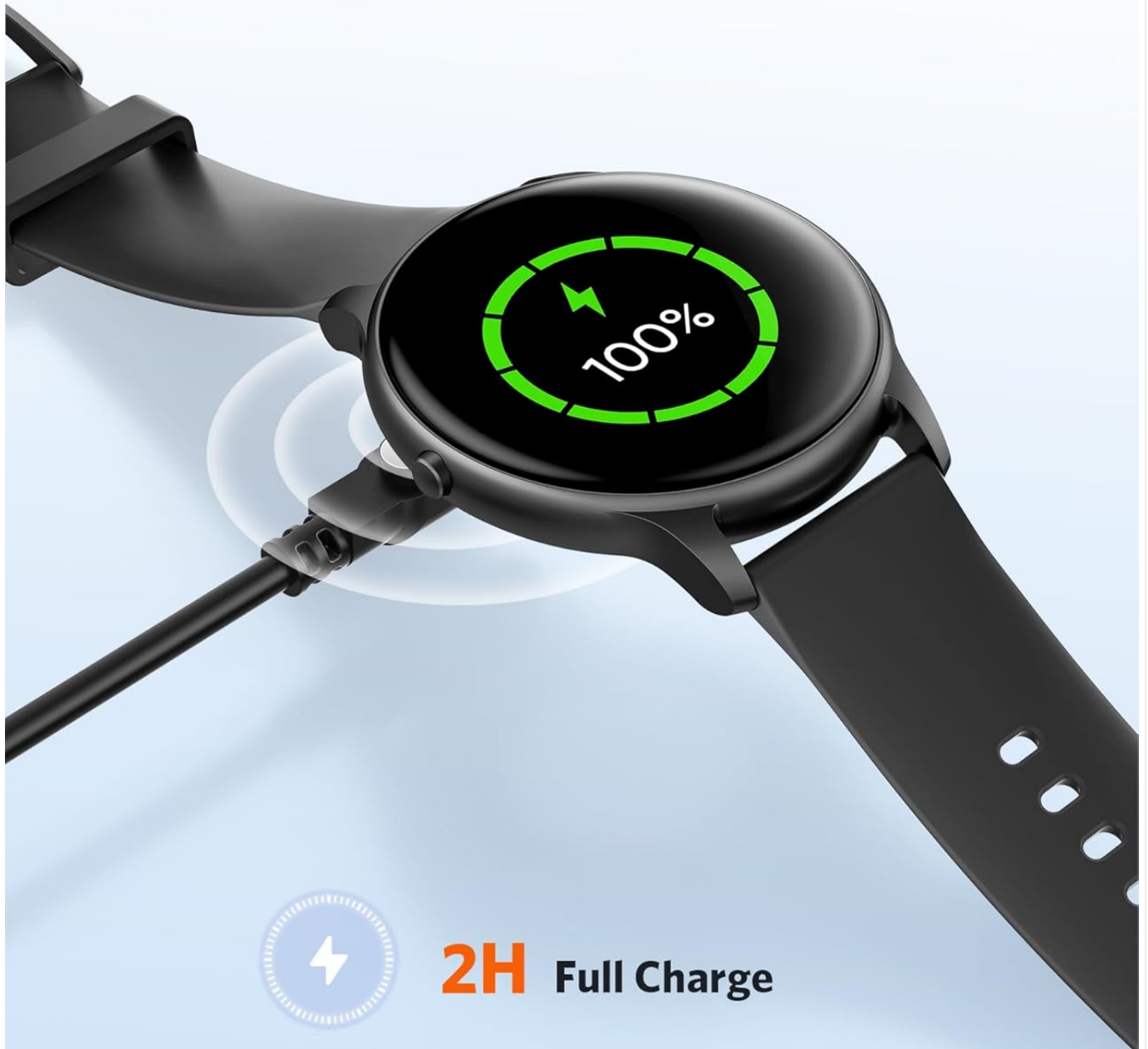
Image: Smartwatch charging, highlighting magnetic and fast charge capabilities, with an estimated 2-hour full charge time.