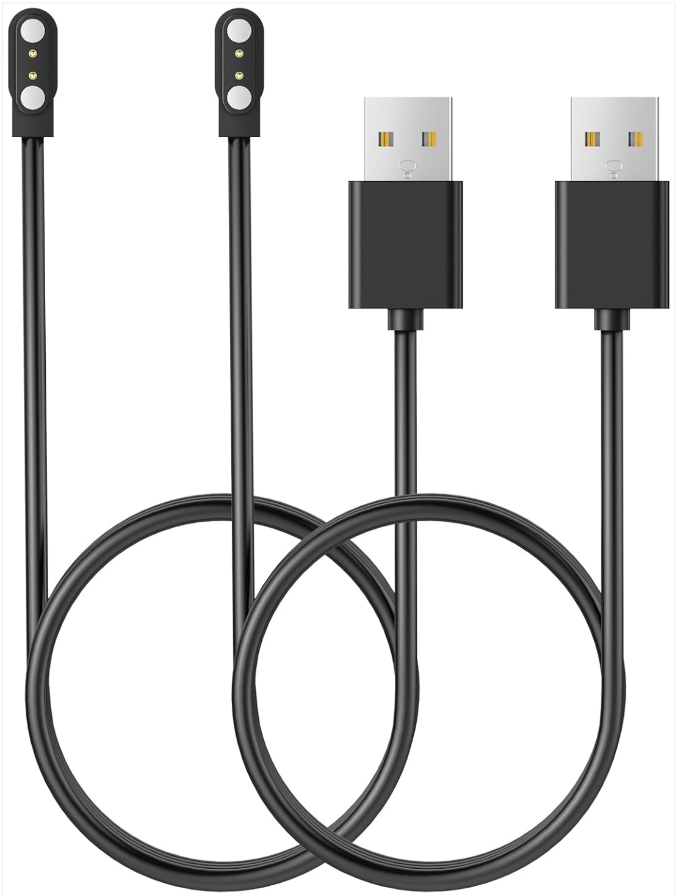
Image: Two Parsonver magnetic USB smartwatch charging cables, illustrating the dual-pack design.