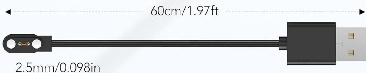
Image: Detailed view of the charger cable's construction, highlighting the pure copper probe, durable ABS+PC materials, and flexible PVC cable, along with its dimensions.

Flexible PVC Cable Easy to roll and store