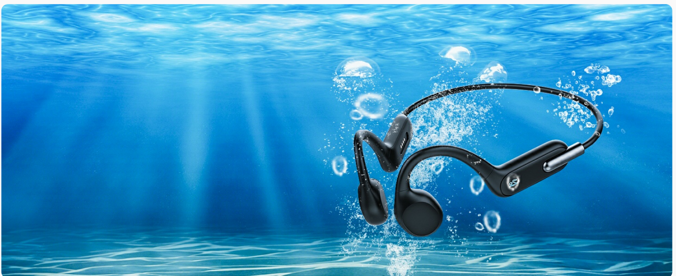
Image: The headphones fully submerged in water, showcasing their robust waterproof capabilities.

Your browser does not support the video tag.