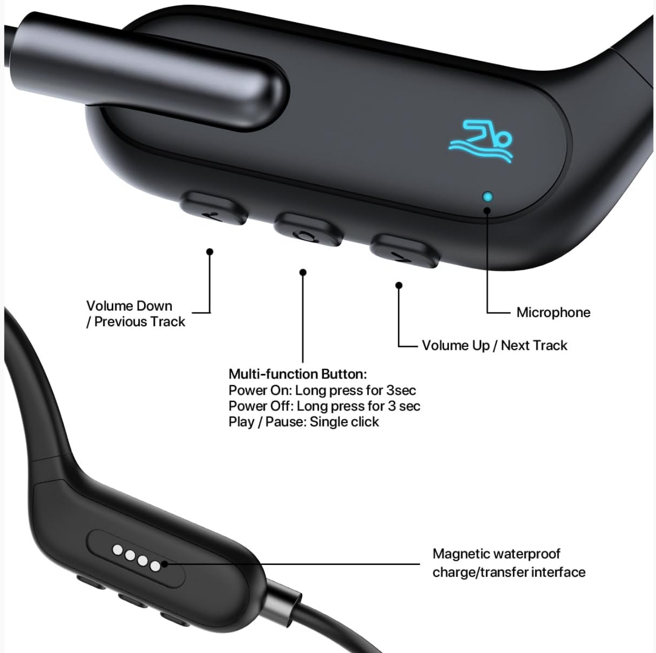
Image: Close-up of the headphone controls, indicating the multi-function button, volume buttons, and microphone.