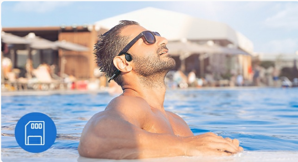
Image: A man enjoying music in a swimming pool, highlighting the use of MP3 mode for underwater listening.

Your browser does not support the video tag.