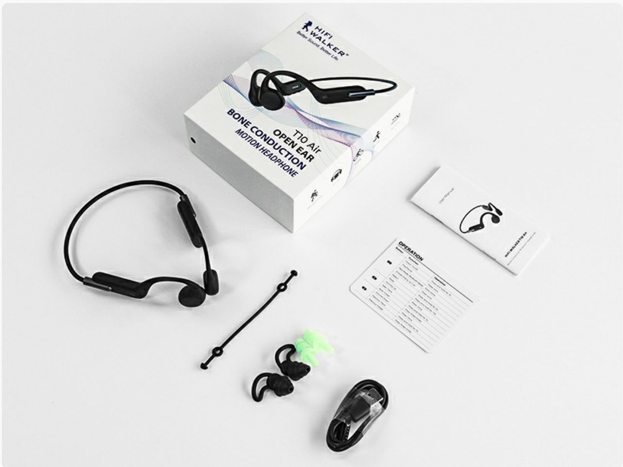
Image: The HIFI WALKER T10 Air headphones, magnetic charging cable, earplugs, and user manual laid out next to the product box.