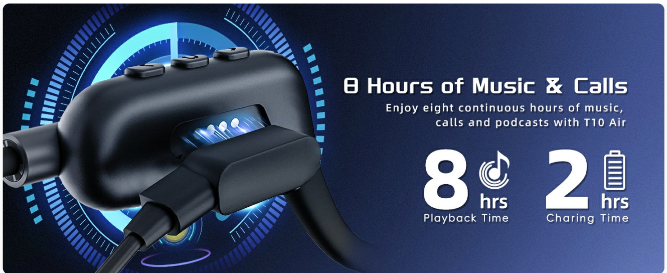
Image: The headphones connected to the magnetic charging cable, illustrating the charging process and battery life.