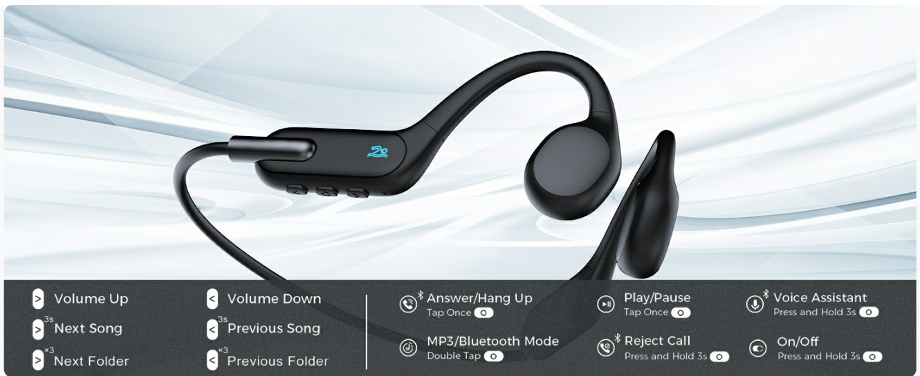
Image: A comprehensive guide to the headphone controls, detailing actions for volume, track selection, calls, and voice assistant.