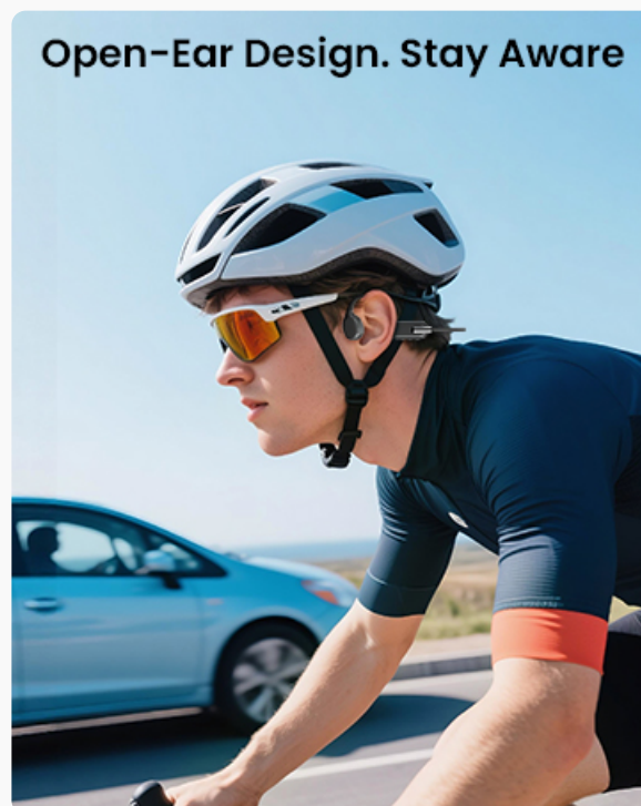
Image: A man smiling while wearing the HIFI WALKER T10 Air headphones, demonstrating their comfortable and discreet fit.

The HIFI WALKER T10 Air Bone Conduction Headphones offer an open-ear listening experience, transmitting sound through your cheekbones. This design allows you to remain aware of your surroundings while enjoying audio, making them suitable for various activities. Featuring IPX8 waterproofing and a built-in 32GB MP3 player, these headphones are designed for versatility and durability.