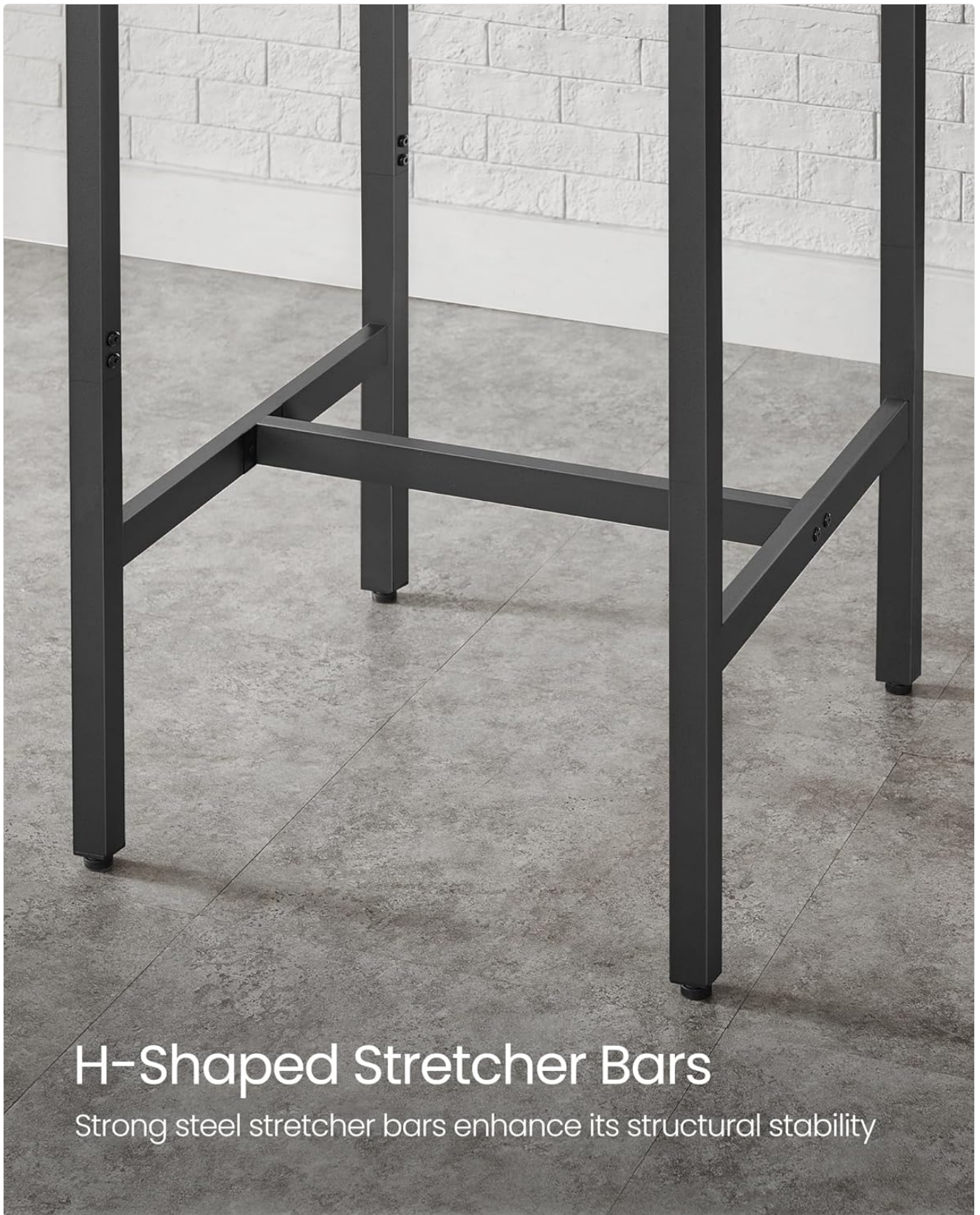
Image 4.1: Detail of the H-shaped stretcher bars, enhancing structural stability.