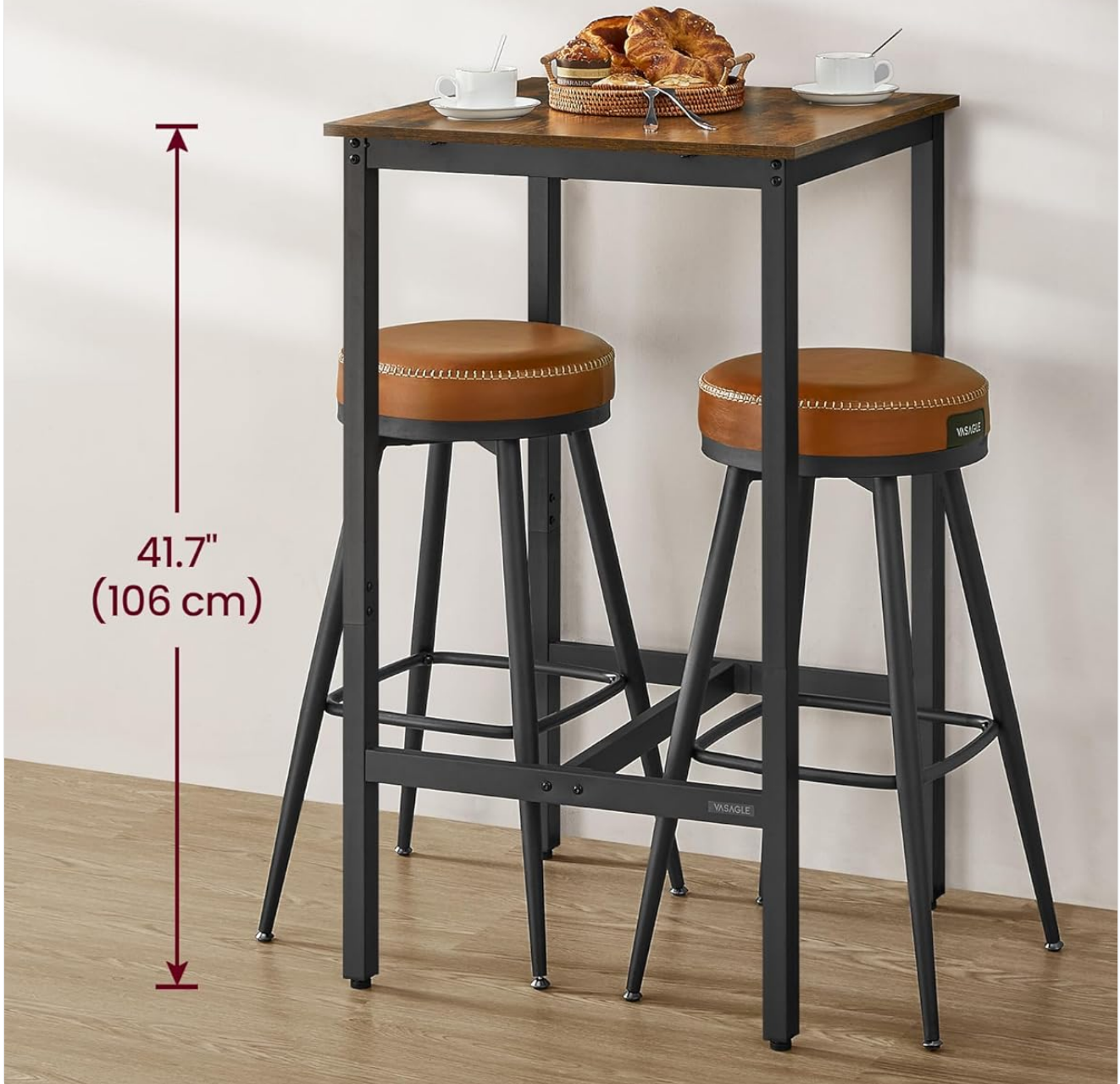
Image 5.2: Visual representation of the table's height (41.7 inches) and recommended stool height (28-33 inches).

Matches with 71-84 cm (28"-33") high bar stools (not included) that also fit under the table