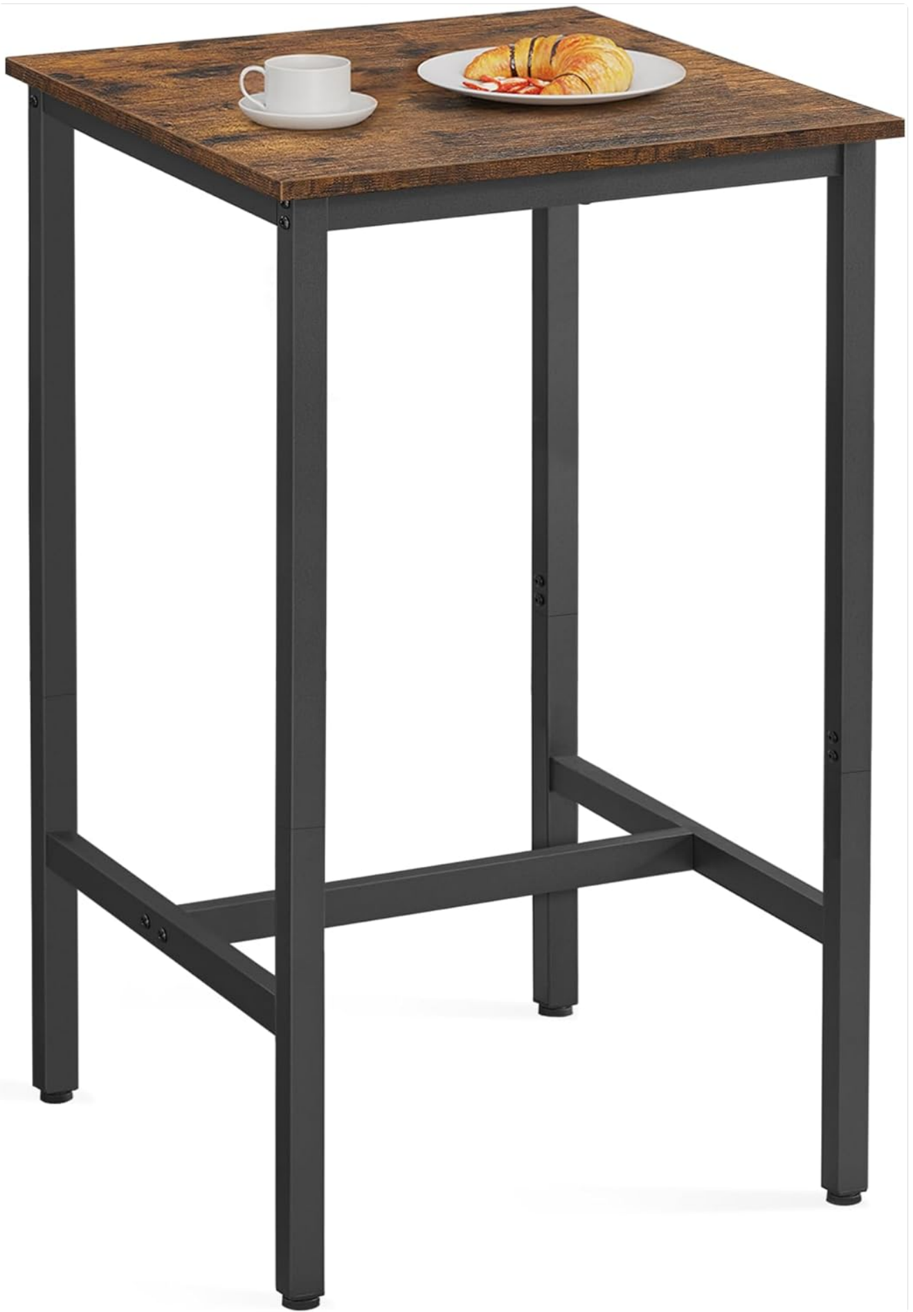
Image 1.1: The VASAGLE Bar Table, showcasing its rustic brown top and black metal frame.