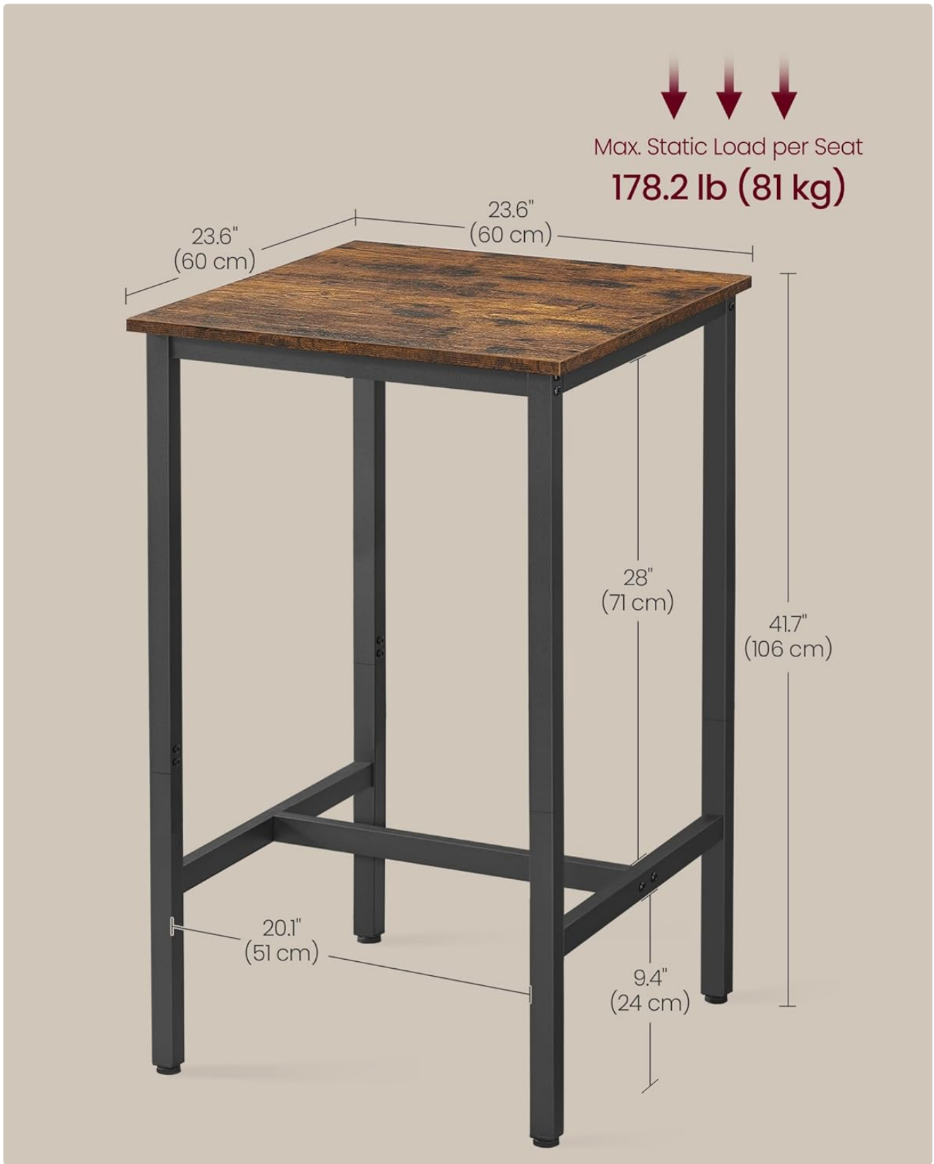
Image 8.1: Detailed dimensions of the bar table, including height, width, and depth.