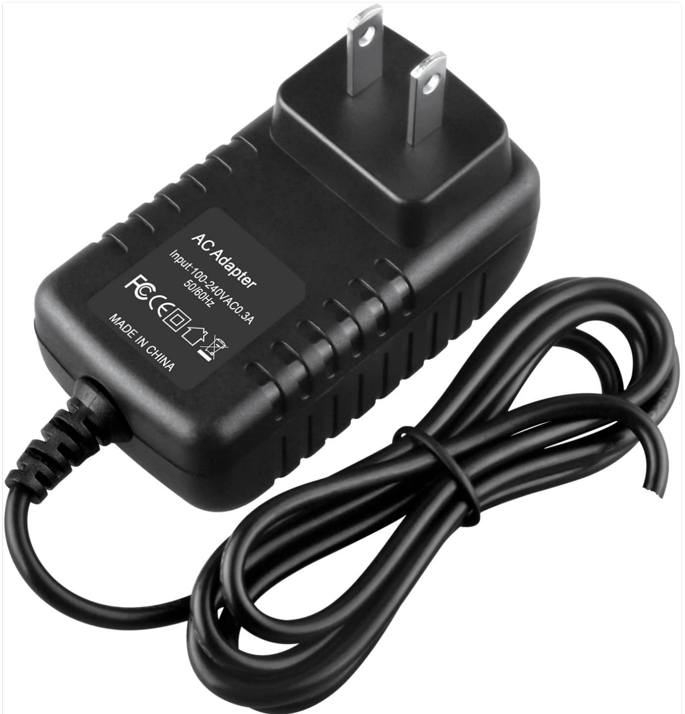
Image: A comprehensive view of the XMHEIRD AC/DC Adapter, showcasing its compact design and the attached power cord.