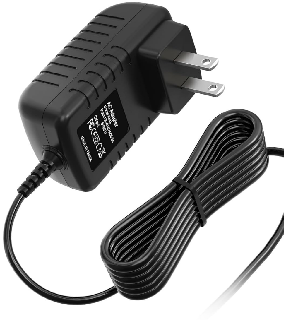
Image: Close-up details of the adapter, highlighting its American plug type, the robust thick copper core within the cable, and the designed flexibility of the power cord for durability.