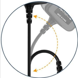
The Flexibility of the power cord