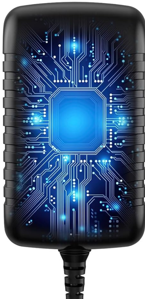
Image: A visual representation of the adapter's integrated safety features, designed to protect against common electrical hazards.