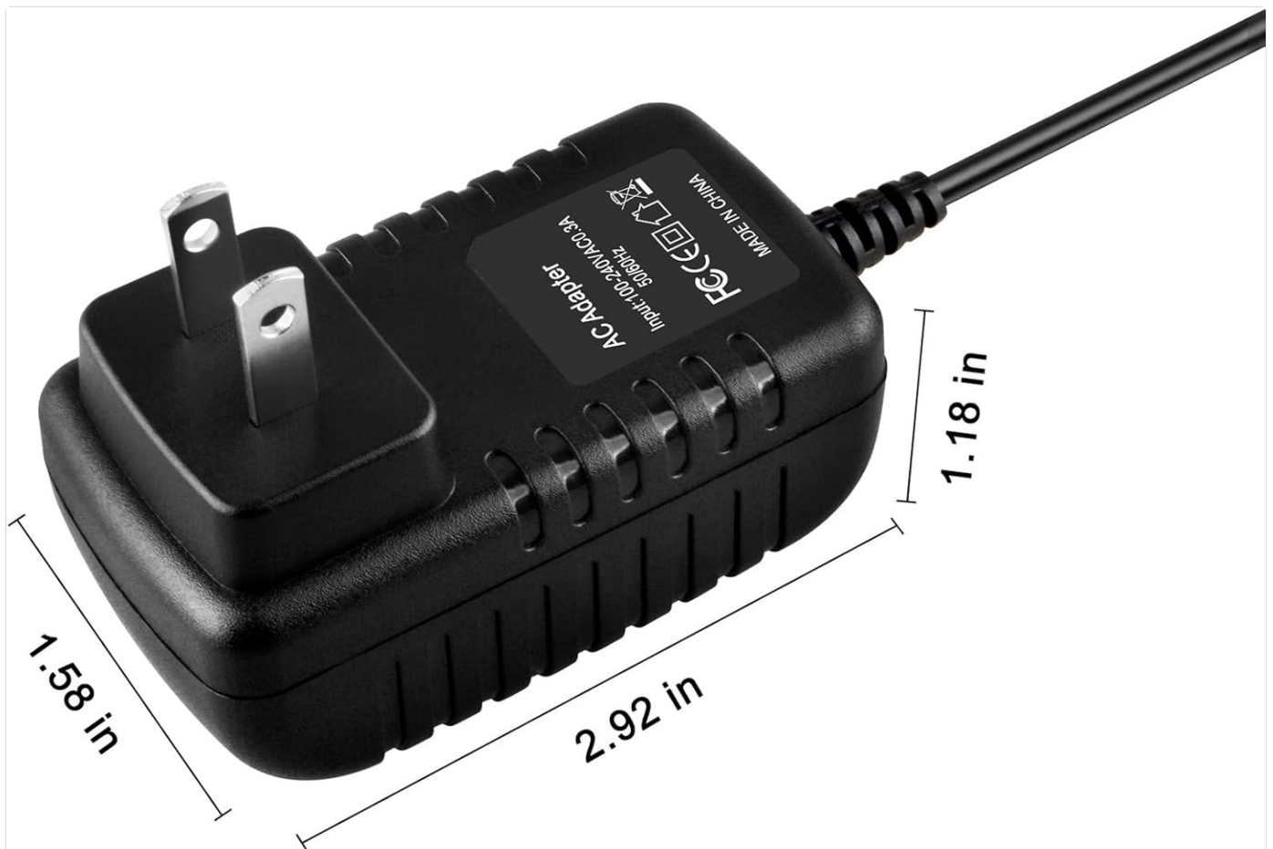
Image: A visual representation of the adapter's dimensions, indicating its length (2.92 inches), width (1.58 inches), and height (1.18 inches).