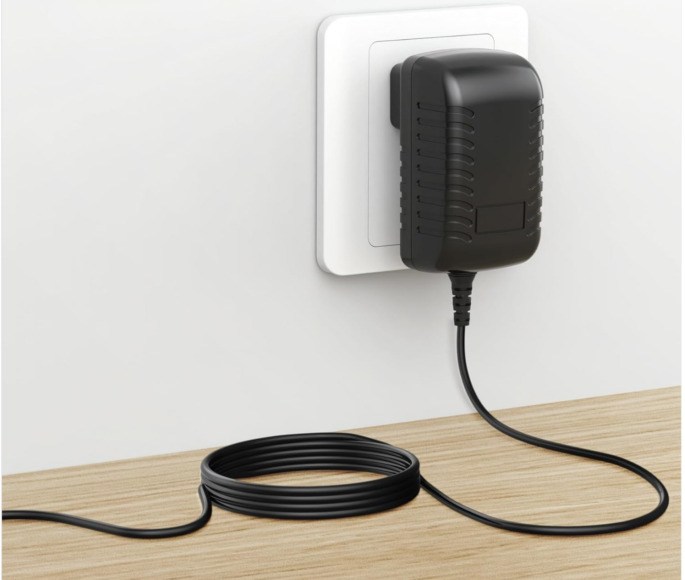
Image: The XMHEIRD AC/DC Adapter securely plugged into a standard wall outlet, ready to provide power.