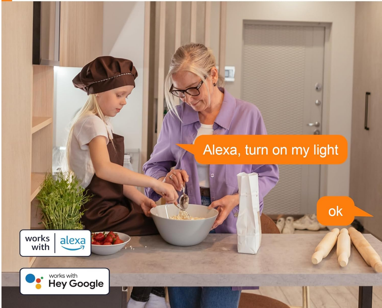
Image: A family interacting with voice assistants to control a smart plug, demonstrating compatibility with Alexa and Google Assistant.

This smart single plug can be controlled via Alexa and Google Assistant.