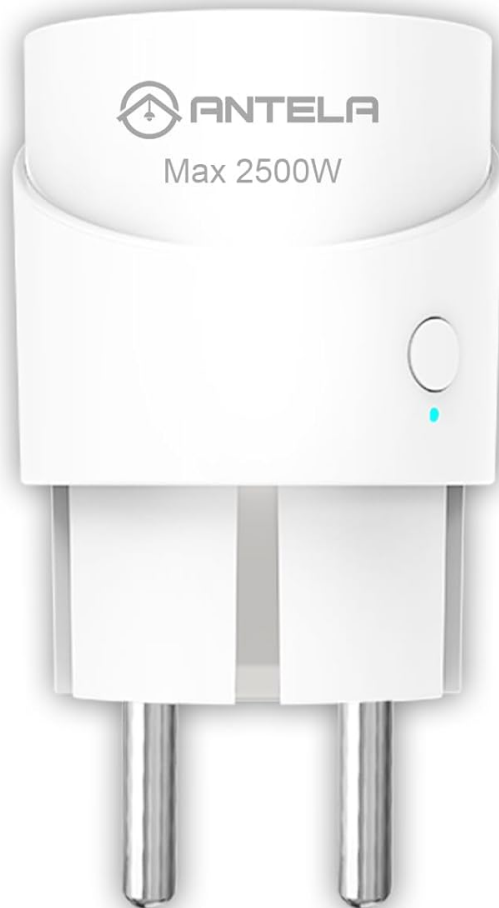
Image: The ANTELA Smart Mini Plug highlighting its safety features including flame-retardant PC shell, child safety shrapnel, short circuit protection, overcurrent protection, overload protection (12A), overvoltage protection (280V AC), undervoltage protection (90V AC), and surge protection (L-N 1KV).