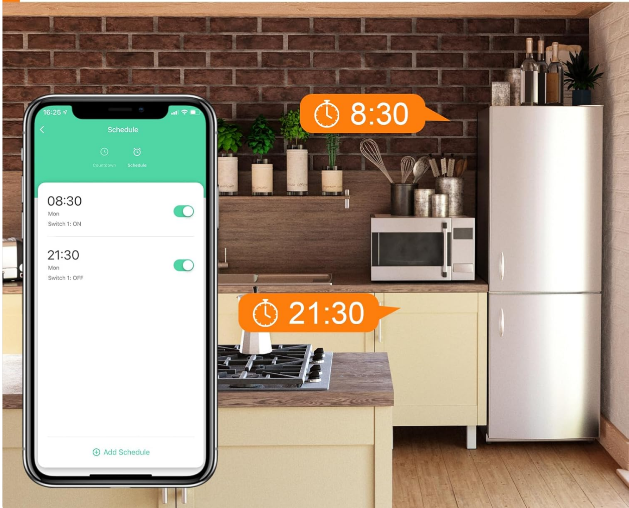
Image: A smartphone screen showing the scheduling interface within the app, allowing users to set specific on/off times for the smart plug.

You can set a schedule or timer to automatically turn on or off the device at the time point