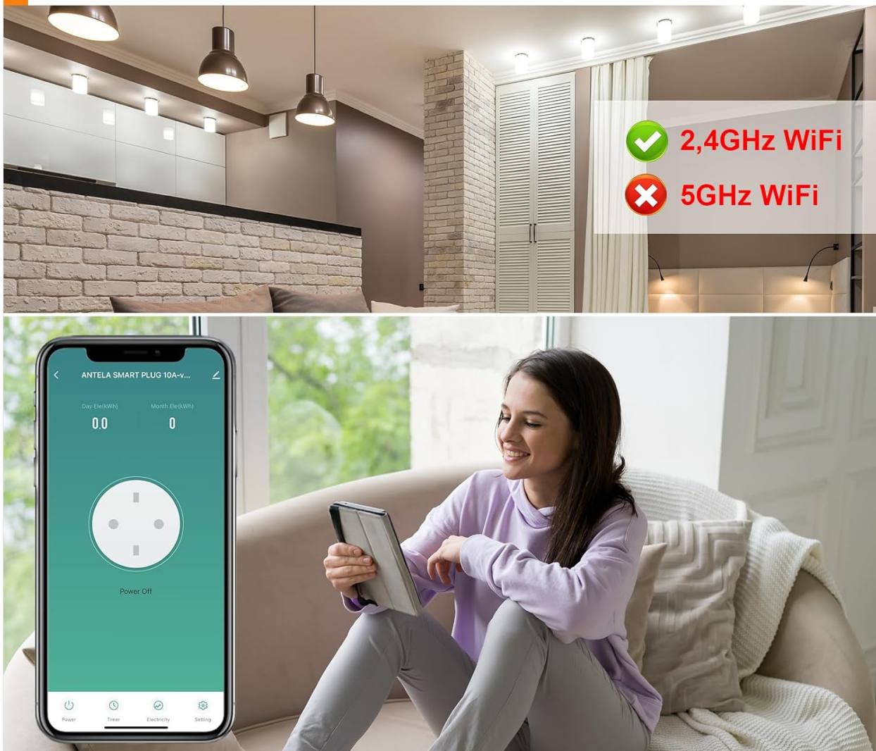
Image: A smartphone displaying the Smart Life app interface for remote control of the ANTELA Smart Mini Plug, indicating 2.4GHz Wi-Fi compatibility.