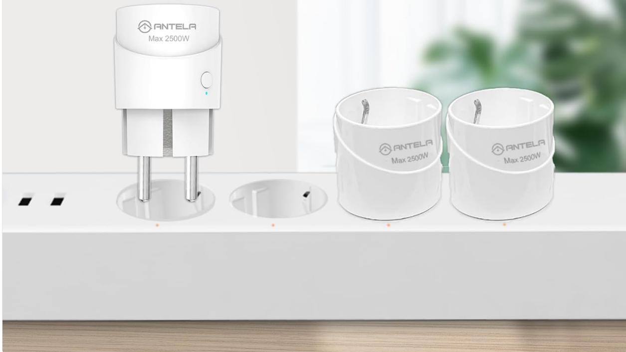
Image: The ANTELA Smart Mini Plug showcasing its compact size and key features including Wi-Fi connection, voice control, remote control, timer setting, app control, and energy monitoring.