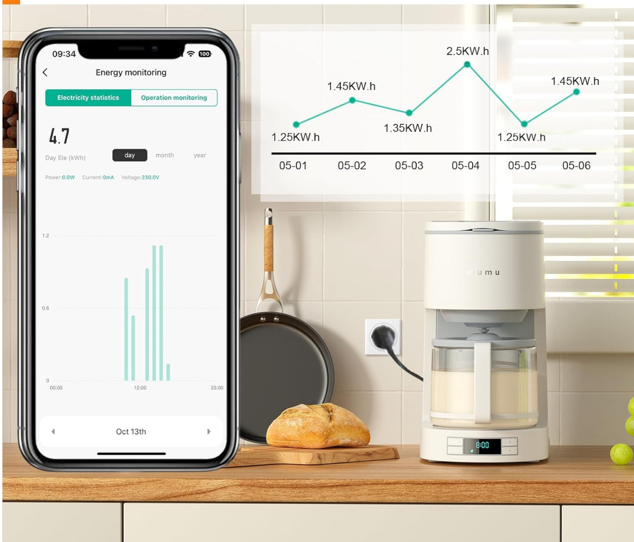
Image: A smartphone displaying energy consumption statistics and a graph, illustrating the energy monitoring capability of the smart plug.