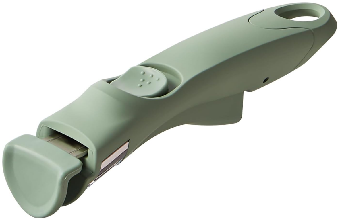
Image: The Redchef Removable Cookware Handle, showcasing its design and color.

secure grip, while the striped rubber enhances slip resistance. The handle is designed with three adjustable models to accommodate varying pan body thicknesses, ensuring a snug and stable fit for a wide range of cookware. This design promotes optimal stack storage, saving up to 75% more space in your kitchen.