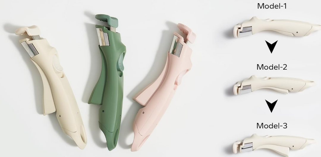
Image: Illustration of the handle's adjustable models (Level 1, Level 2, Level 3) for varying pan thicknesses.

Adapts to different thickness of pan body