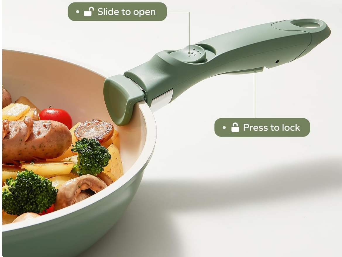
Image: Visual guide for attaching the handle: 'Slide to open' and 'Press to lock'.