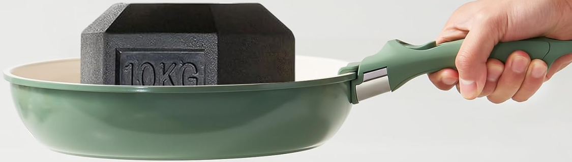
Image: The handle's durability, holding a 10kg weight in a pan.