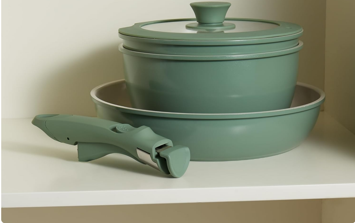
Image: Easy storage of cookware with the handle detached, saving space.