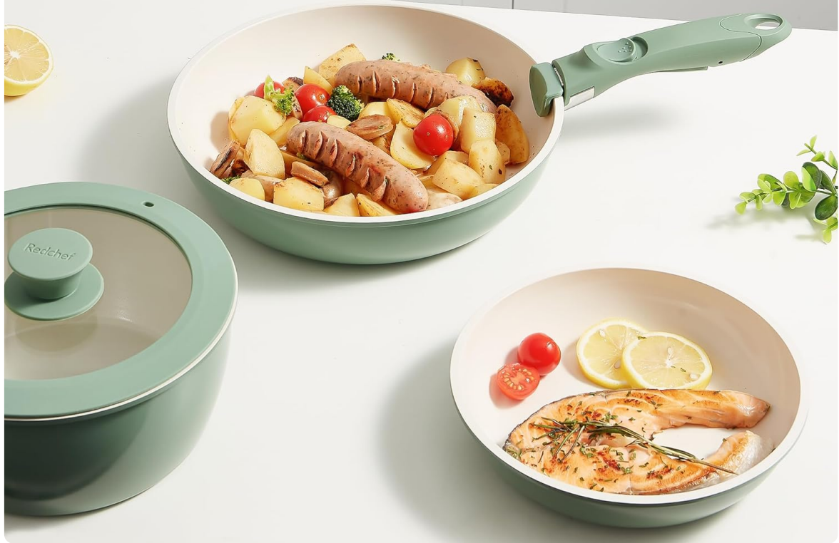
Image: Demonstrates the multi-functional use of the handle, transitioning from stove to oven and fridge.