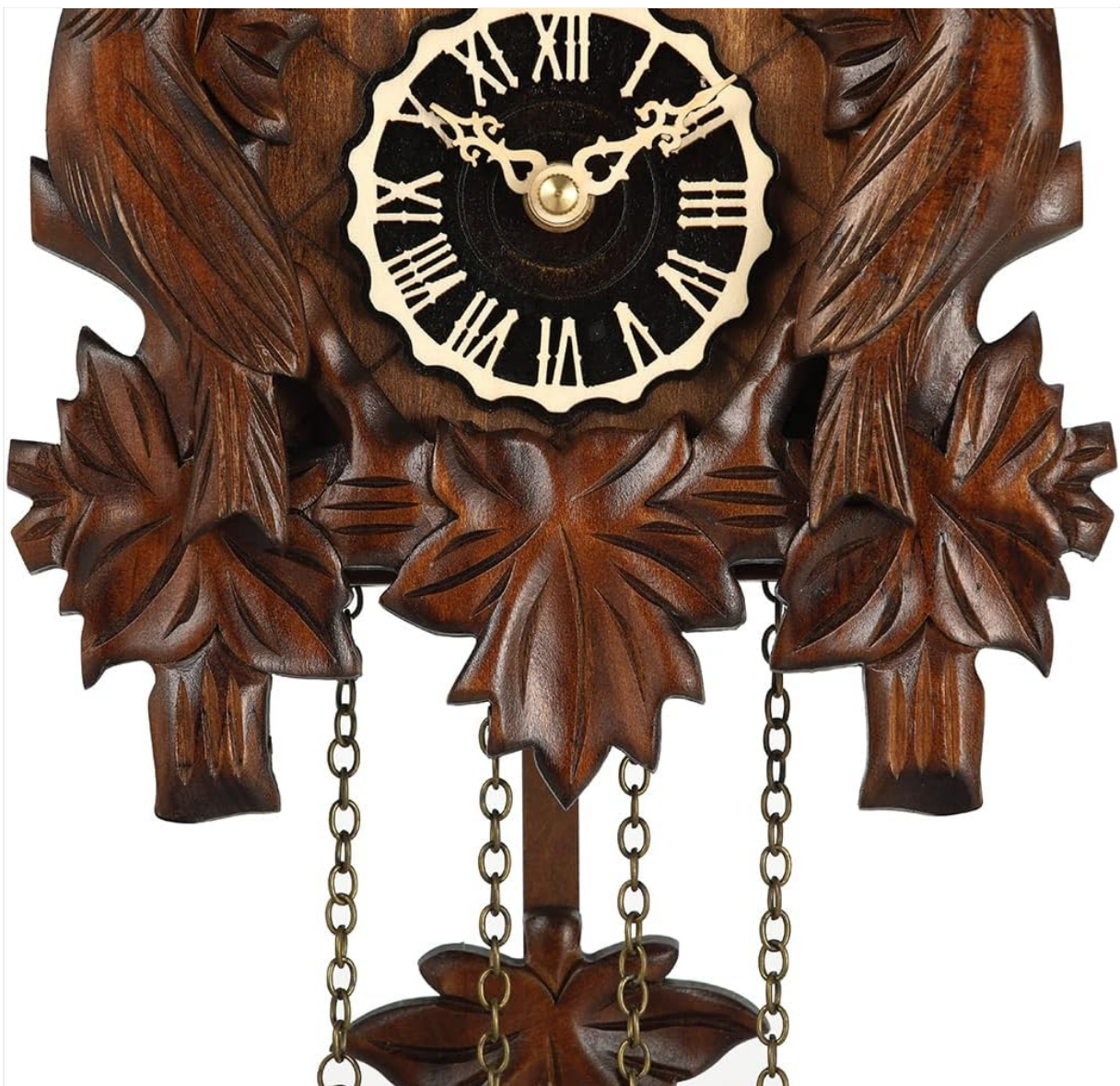
Image 3.1: Close-up of the clock face with Roman numerals and ornate hands, indicating the time display area.