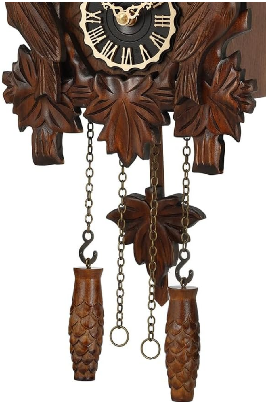
Image 1.1: Front view of the Kintrot Cuckoo Clock, Model KT816W, showcasing its traditional Black Forest design with carved birds and maple leaves, a round clock face with Roman numerals, and decorative weights and pendulum.