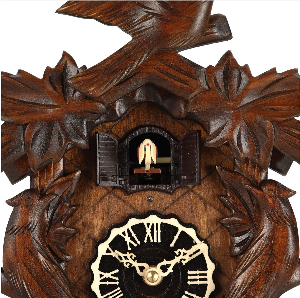
Image 4.1: Close-up view of the small cuckoo bird figure emerging from its miniature door above the clock face.

At specific intervals, a cuckoo bird will emerge from its nest, sing, and call "coo coo." The clock also plays one of 12 different melodies after the cuckoo call.