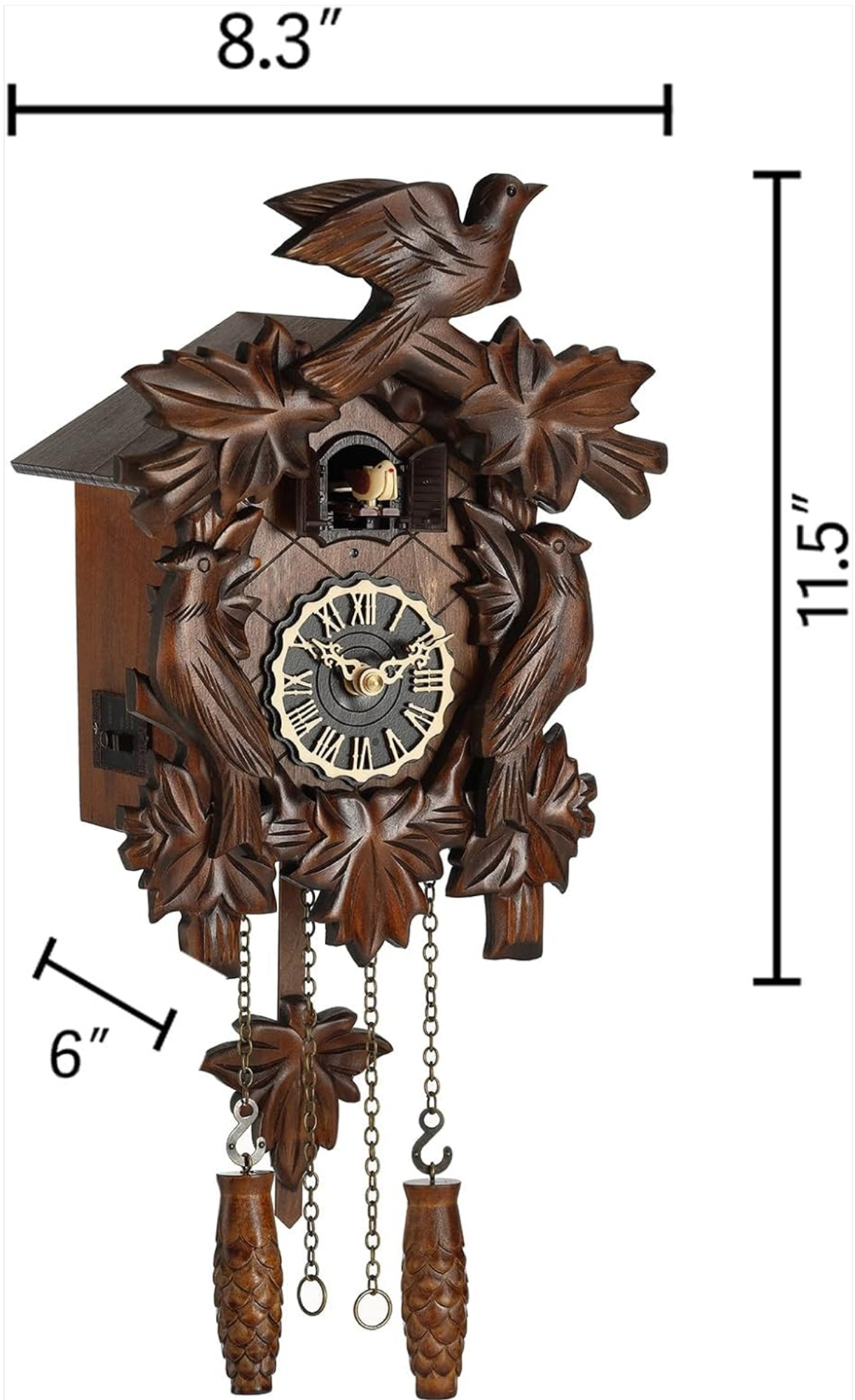
Image 3.2: Diagram showing the approximate dimensions of the cuckoo clock: 8.3 inches wide, 11.5