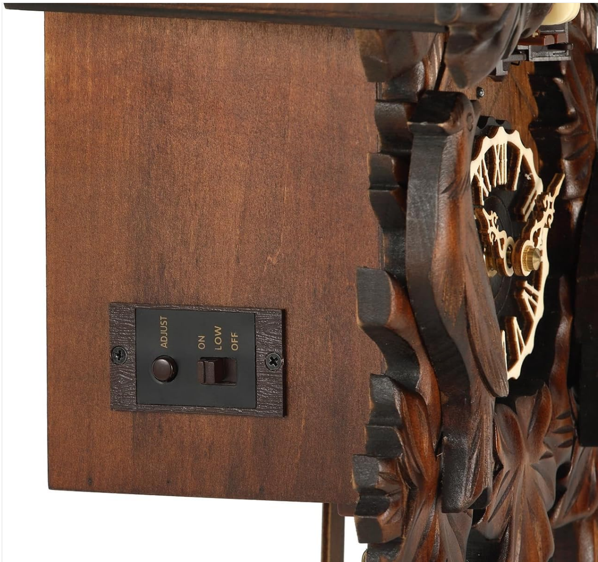
Image 4.2: Side view of the clock showing the control panel with an 'Adjust' button and a three-position switch labeled 'ON', 'LOW', and 'OFF'.