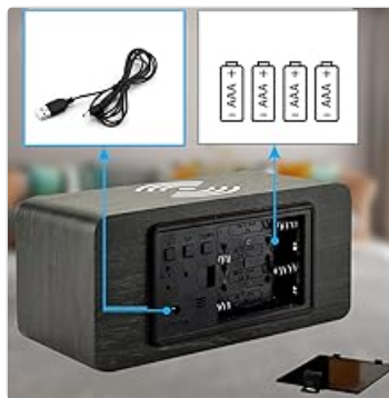
Image: The rear view of the alarm clock, highlighting the USB cable connection point and the battery compartment where four AAA batteries can be inserted for backup power.