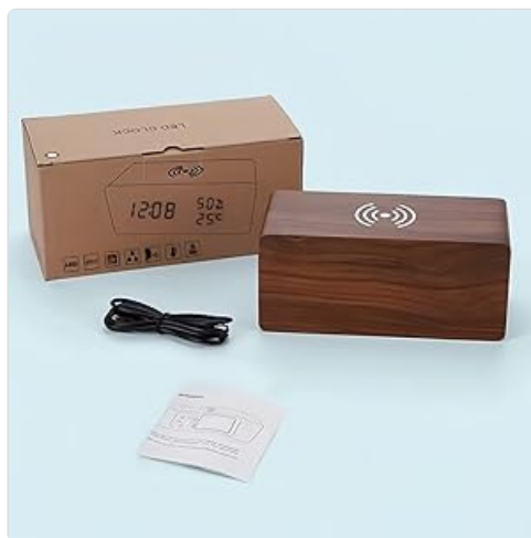
Image: The product packaging box, the Lancoon Wooden Digital Alarm Clock, a USB power cable, and the user manual are shown together, illustrating the typical contents of the package.