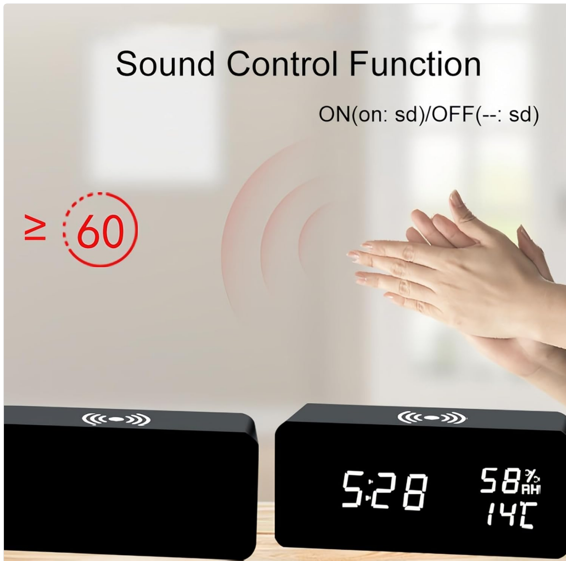
Image: Two alarm clocks are shown, one with its display off and another with its display on after a pair of hands clap. Text indicates that a sound greater than or equal to 60dB will activate the display in sound control mode, with 'ON: sd' and 'OFF: sd' options.