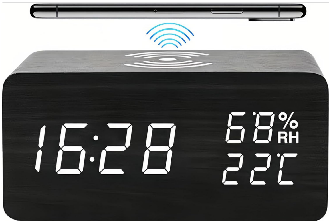
Image: The Lancoon Wooden Digital Alarm Clock displaying the time, humidity percentage, and temperature in Celsius. The top surface shows a wireless charging icon, indicating its charging capability.

Thank you for purchasing the Lancoon Wooden Digital Alarm Clock. This device combines a modern aesthetic with practical features, including an LED time display, wireless charging capability, real-time temperature and humidity monitoring, adjustable brightness, and sound control. Please read this manual carefully to ensure proper use and optimal performance of your alarm clock.