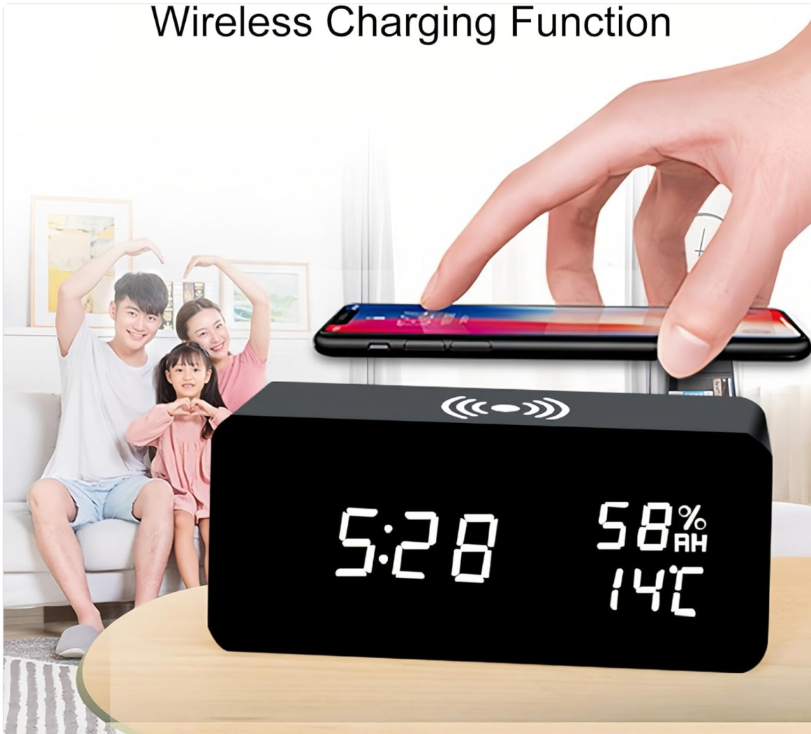
Image: A hand is shown placing a smartphone onto the top surface of the Lancoon Wooden Digital Alarm Clock, demonstrating the wireless charging function. The clock displays time, humidity, and temperature.