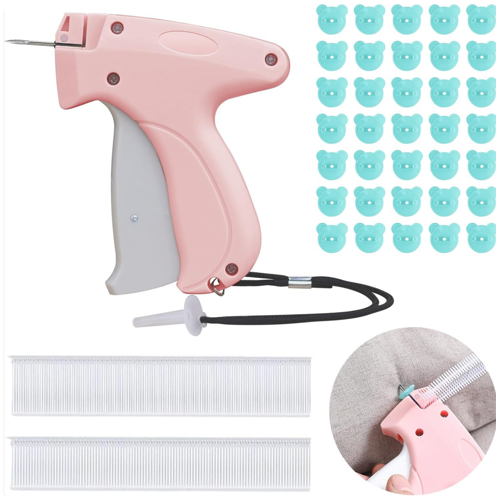
Image 1.1: Overview of the Smartmak Quick Clothing Fixer and included accessories.