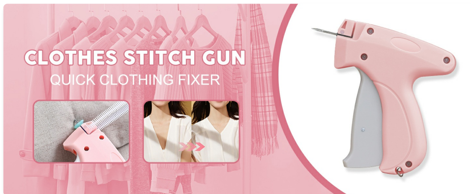
Image 2.1: Visual representation of the items included in the package.