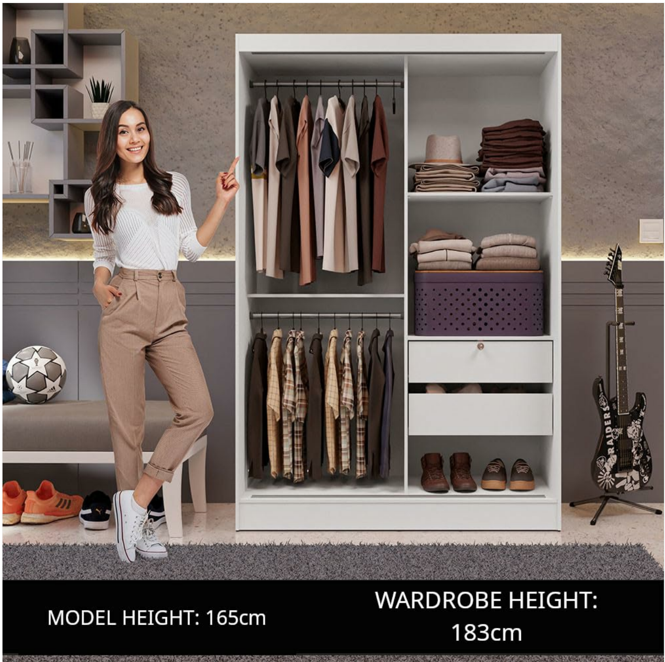
Image: The Madesa Luke Wardrobe shown with a person for scale, illustrating its internal organization with hanging space, shelves, and drawers.