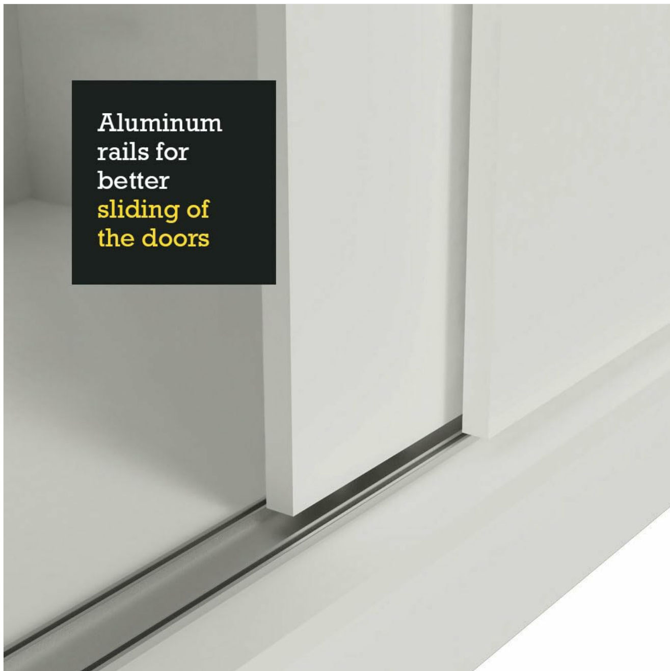
Image: Close-up view of the aluminum rails, designed for smooth and silent operation of the sliding doors.

Aluminum rails for better sliding of the doors