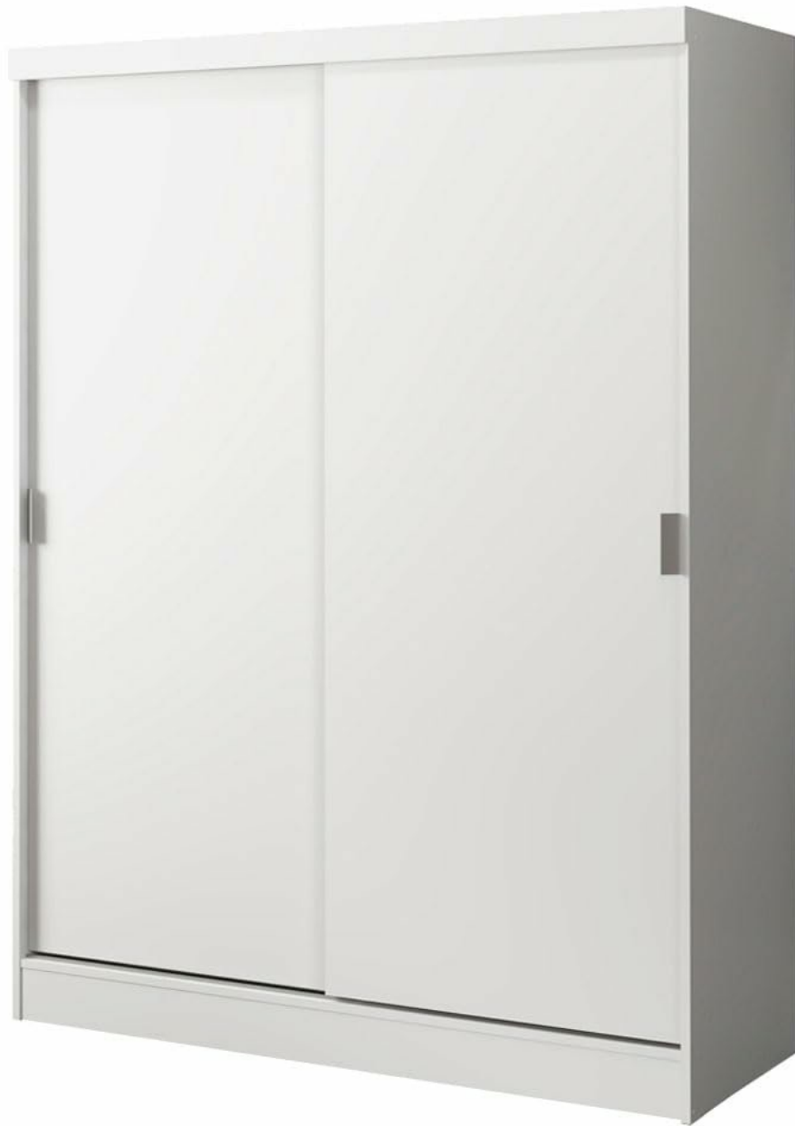
Image: Front view of the Madesa Luke 2-Door Sliding Wardrobe, showcasing its clean white finish and two sliding doors.