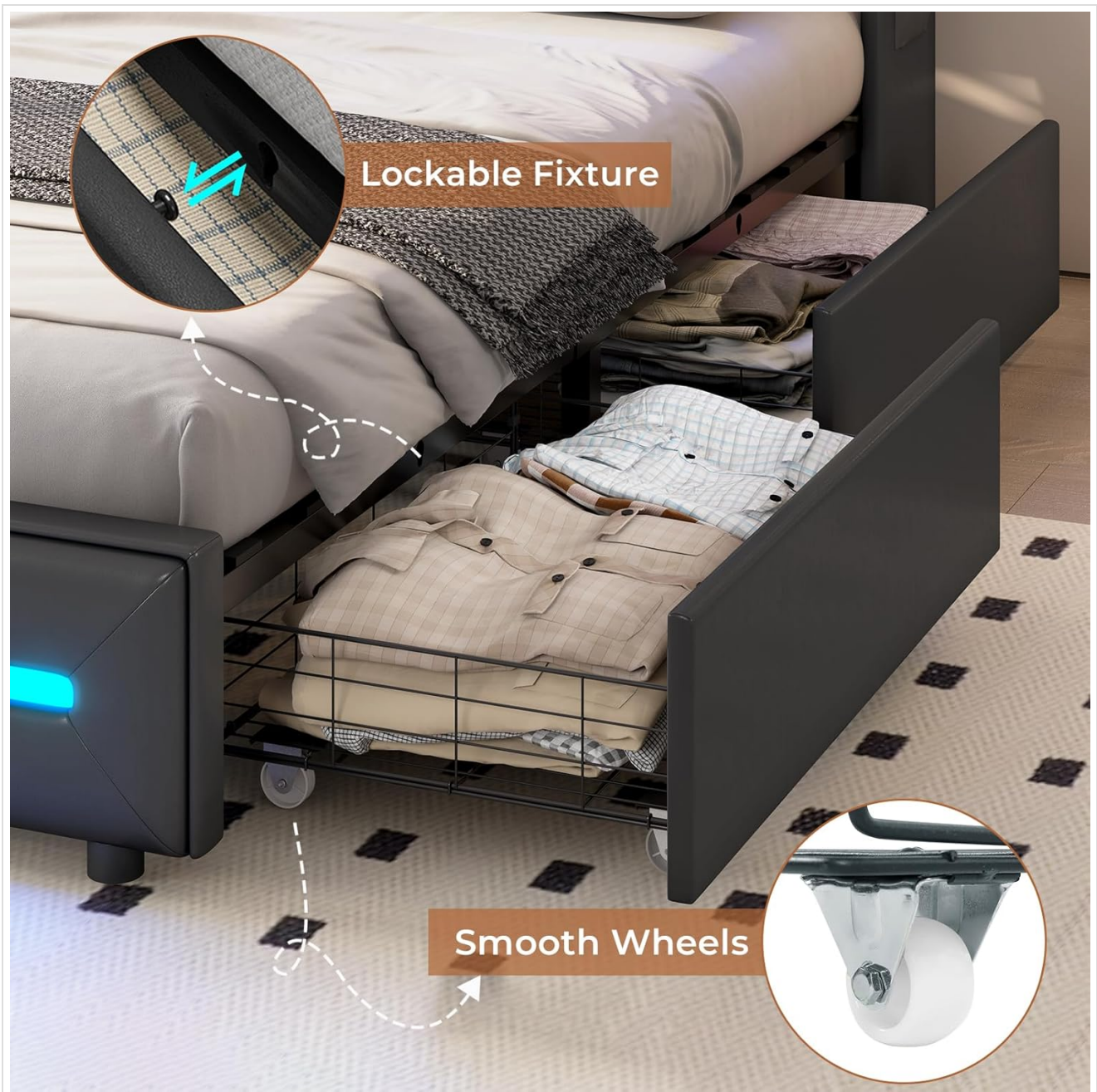
Image 3.3: Under-bed storage drawer demonstrating wheels and lockable fixture.