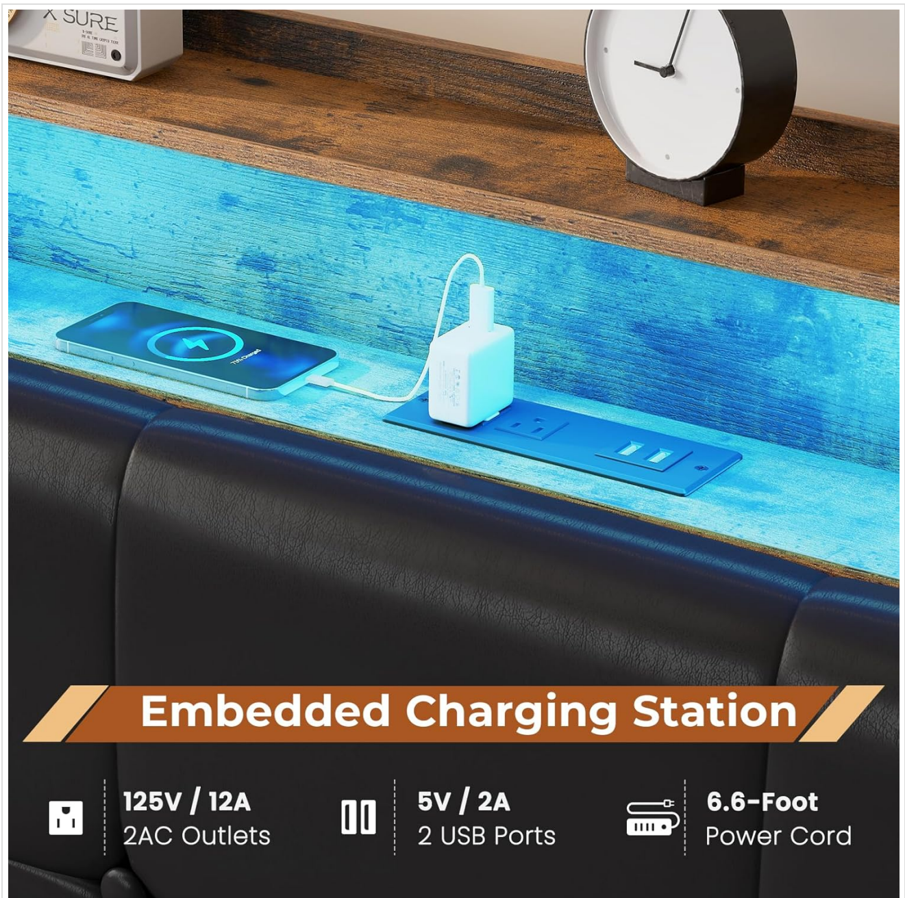
Image 3.2: Detailed view of the charging station with USB ports and AC outlets.