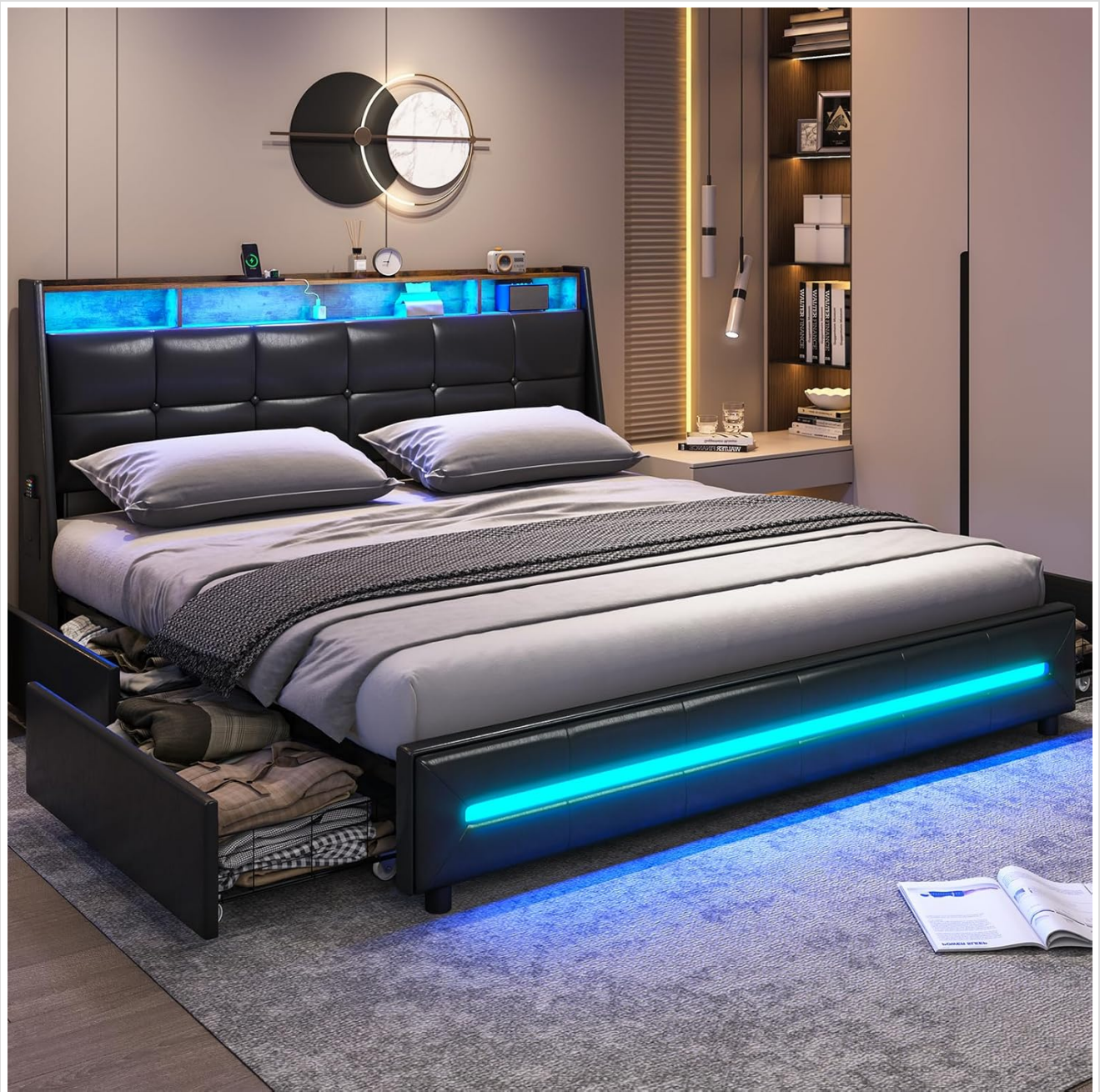
Image 1.1: MSmask King Size Bed Frame with blue LED lighting and open storage drawers.