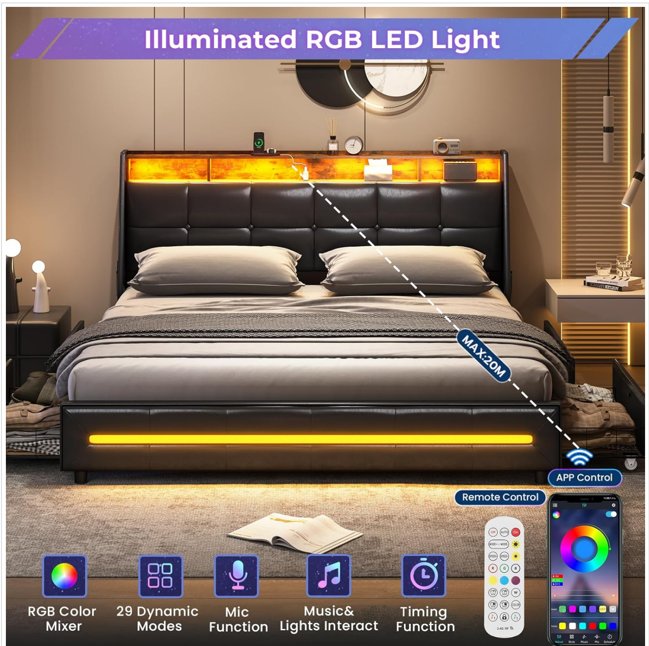
Image 3.1: Bed frame with LED lights, illustrating remote and app control capabilities.