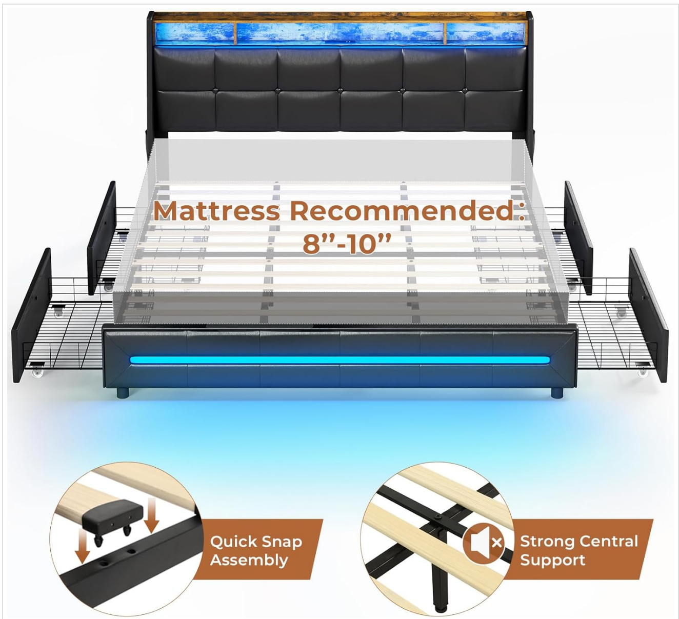
Image 2.2: Illustration of the quick snap assembly system for slats and the strong central support structure.