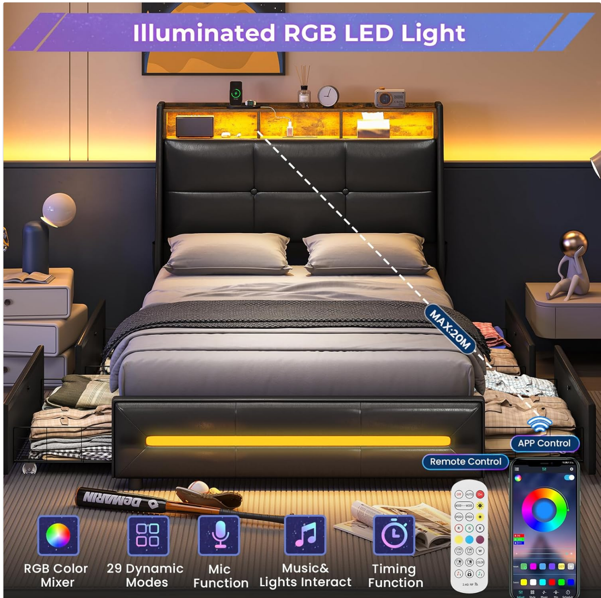
Image: Illuminated RGB LED lights with various control options including color mixer, dynamic modes, music interaction, and timing function.

Video: Overview of the MMask Upholstered Bed Frame, showcasing its storage features, LED lighting, and overall design. The video demonstrates the bed frame's aesthetic appeal and functional elements.