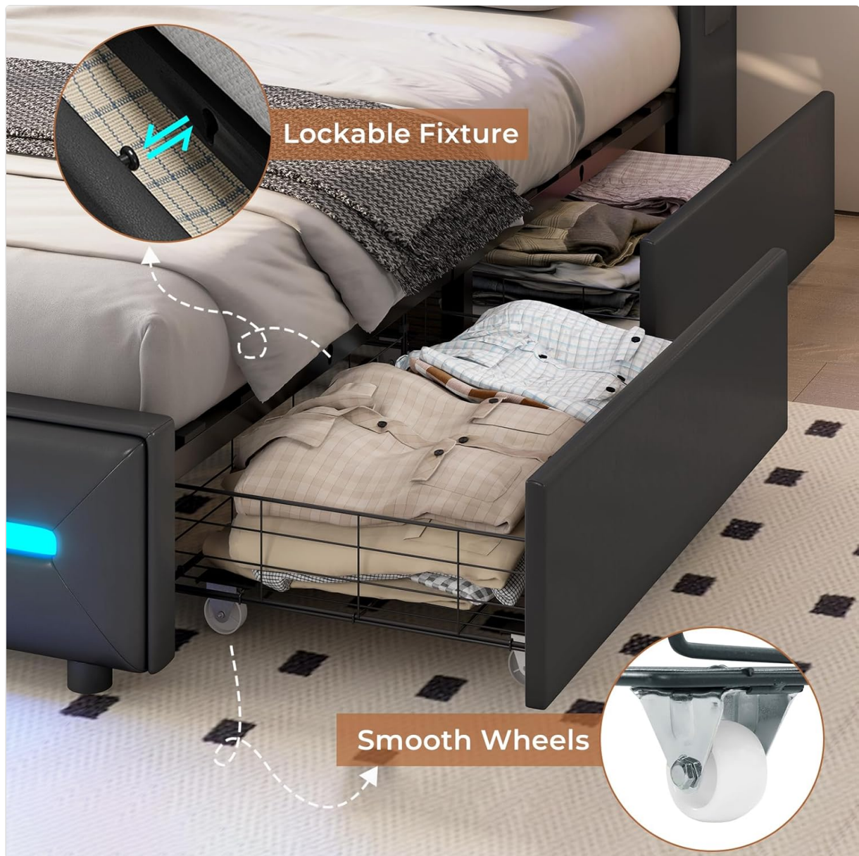
Image: Under-bed storage drawers with lockable fixtures and smooth wheels for easy access and secure storage.

Video: Demonstration of the MSmask Upholstered Bed Frame's storage capabilities, highlighting the spacious drawers and their functionality.