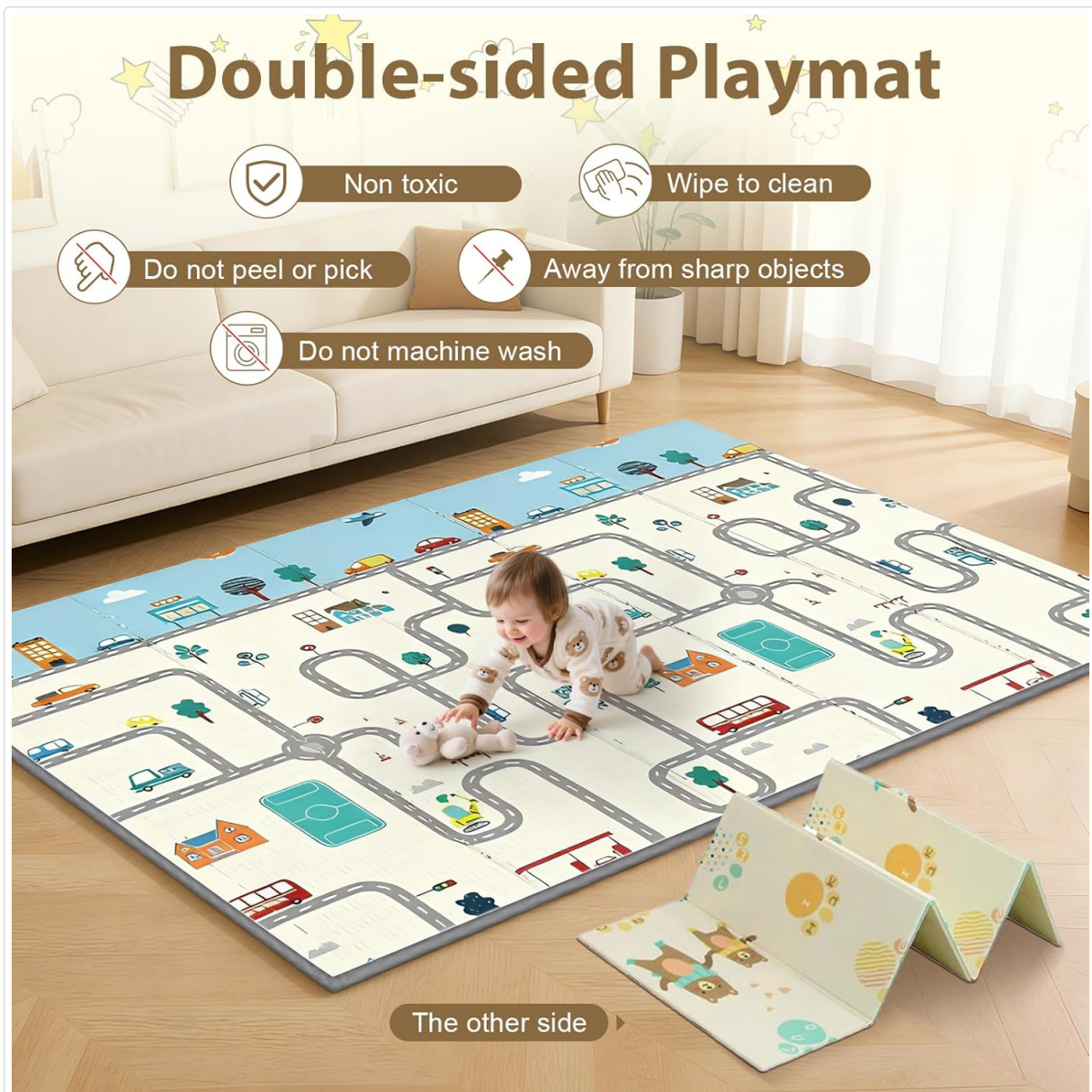
Figure 5: The double-sided playmat is easy to clean and made from non-toxic materials.