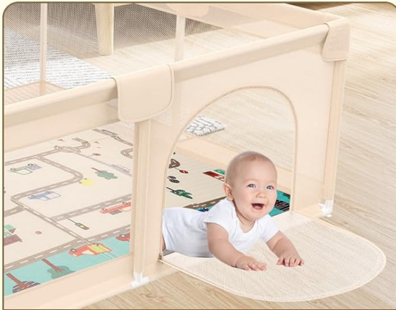
Zipper closure door easy to enter