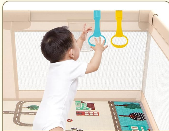
Help baby learn to walk