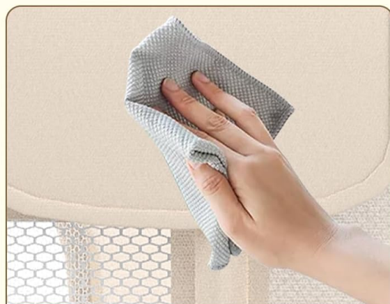
Easy to clean