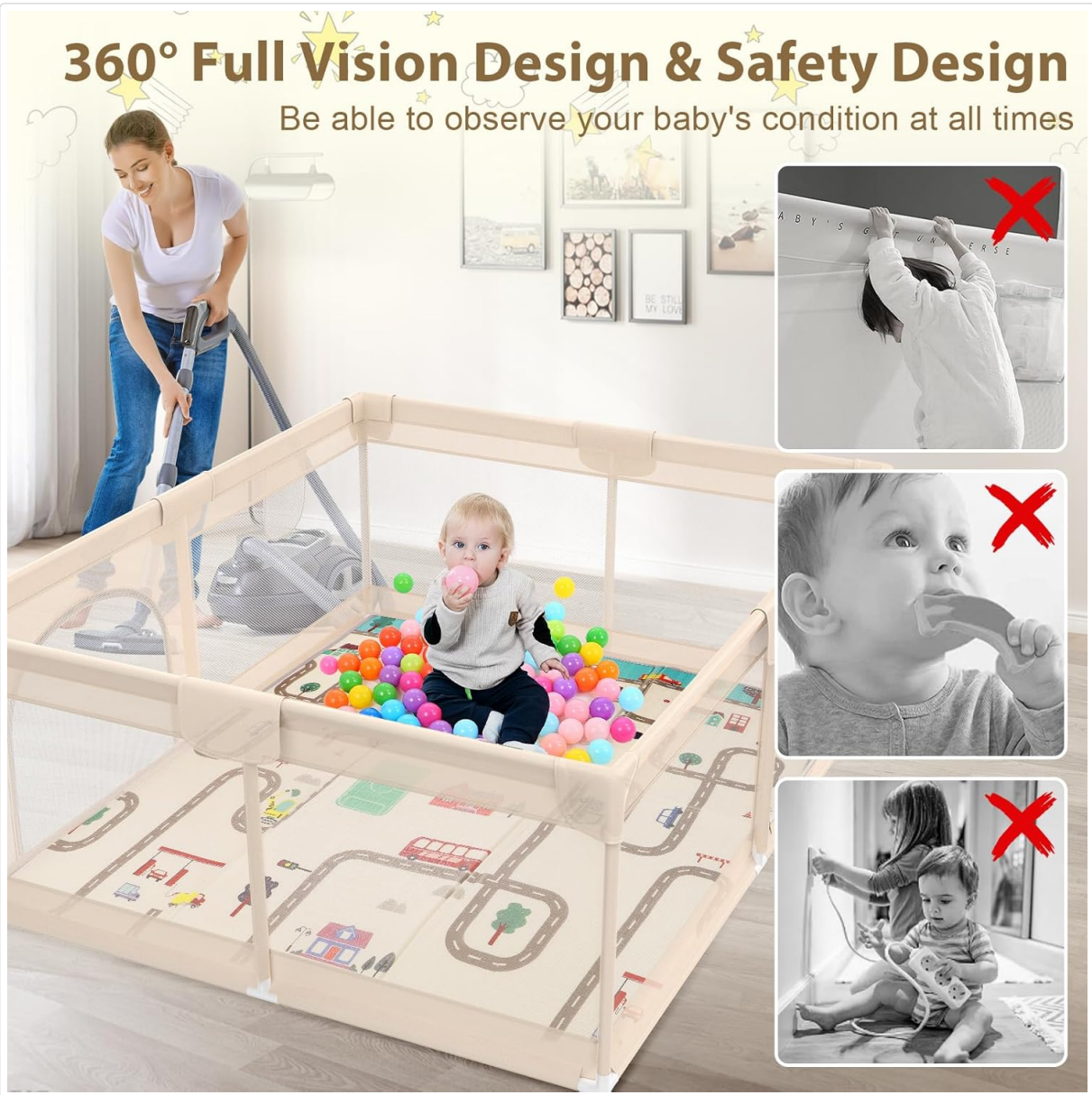
Figure 1: The 360° full vision design allows for easy supervision, ensuring your child's safety.

Be able to observe your baby's condition at all times