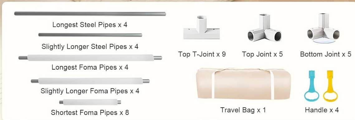
Figure 2: All components included in your Abdtech Baby Play Pen package.