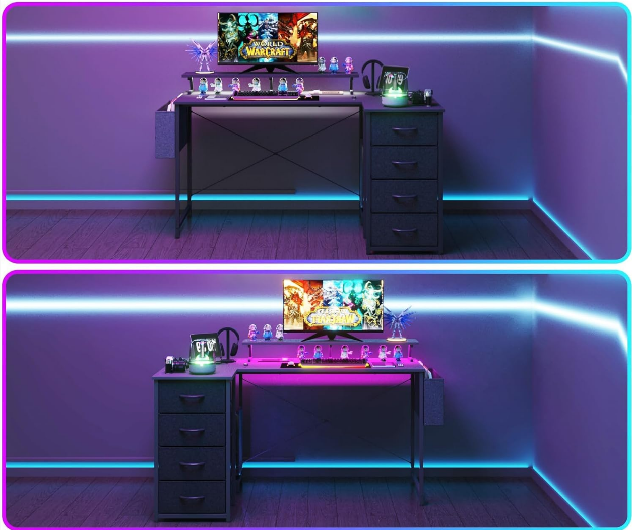
Image 4.1: The desk can be assembled with the longer section on either the left or right side.

You can install the storage shelf on your left or right-hand side according to your preference