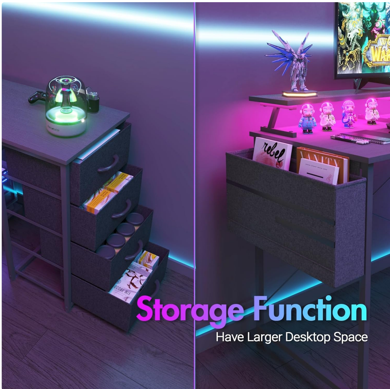
Image 5.2: Integrated storage solutions including drawers and a side bag.