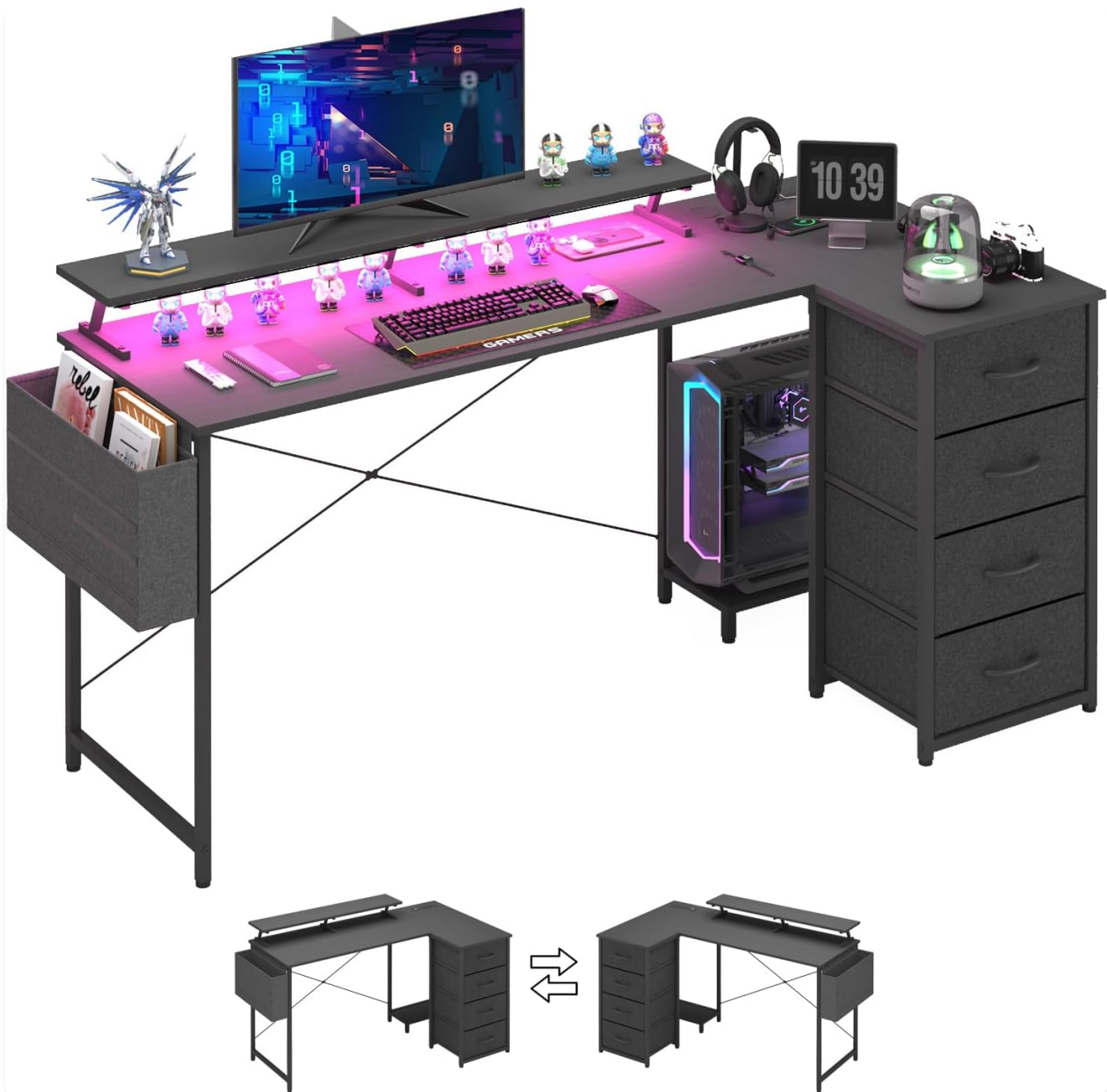
Image 1.1: Advwin 160cm L-Shaped Gaming Desk setup with monitor, keyboard, and accessories.