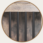
Heavy Duty Metal