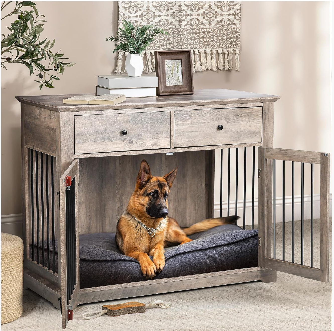
Image 1.1: The LEMBERI 44 Inch Large Dog Crate Furniture, showcasing its dual function as a pet enclosure and a piece of home furniture.