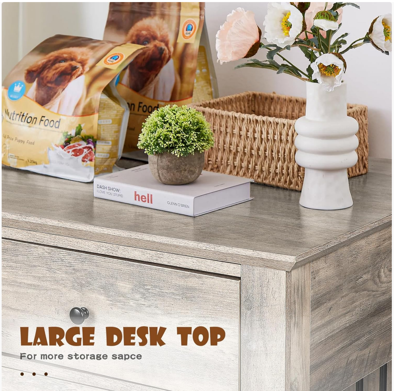
Image 4.3: The spacious table top, showcasing its utility for home decoration.