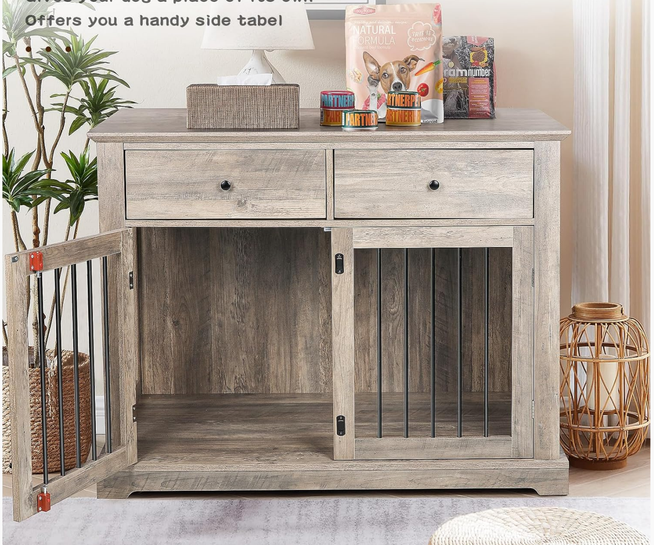
Image 3.1: The dog crate with doors open, illustrating the internal structure and drawer access.