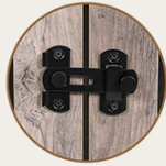
Front Door Lock