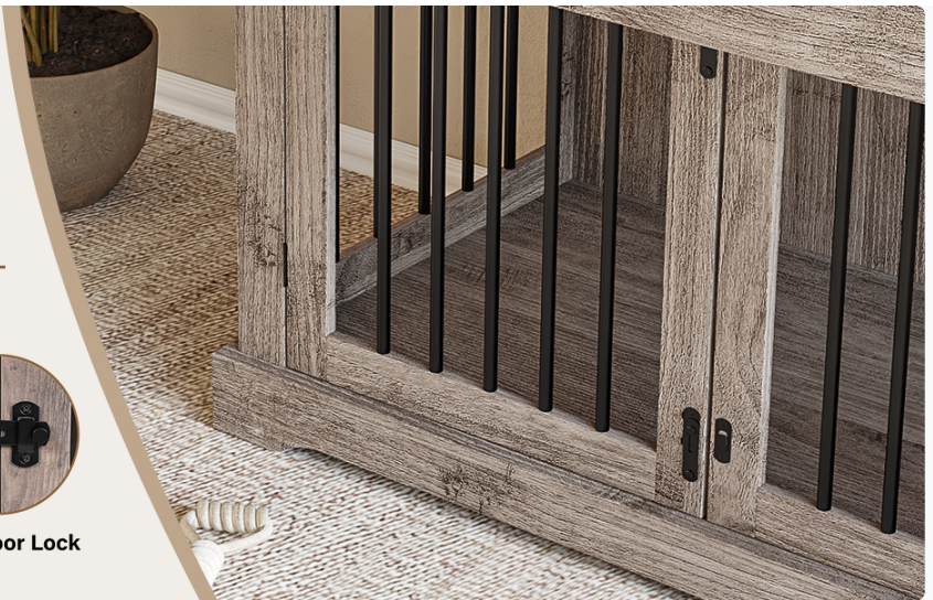
Image 4.1: Detailed view of the crate's features, including the robust metal bars and secure door latches.