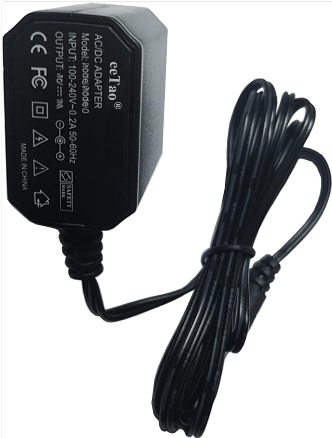
Image: A detailed view of the eeTao AC/DC adapter's label, displaying its input voltage (100-240V), output specifications (DC12V, 0.5A), and safety certifications.