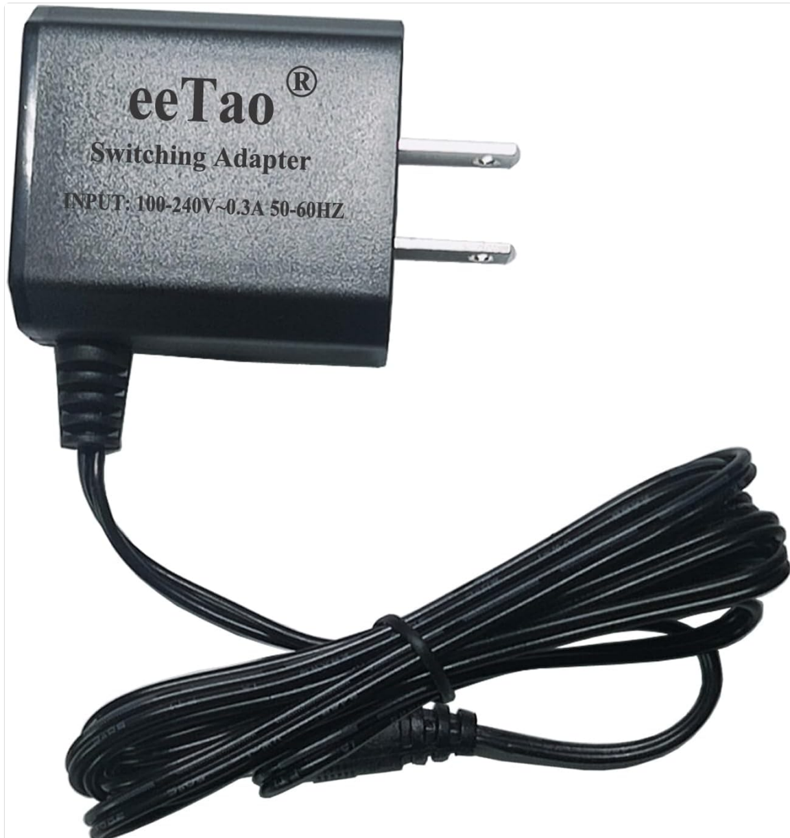
Image: The eeTao AC/DC adapter with its power cord extended, illustrating its compact design and standard two-pin plug for wall mounting.