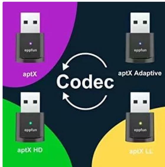
Image: A visual representation showing four eppfun adapters, each with a different colored LED (blue, green, yellow, purple), indicating the active audio codec: aptX Adaptive, aptX HD, aptX LL, and aptX, with a central "Codec" arrow suggesting the ability to switch between them.