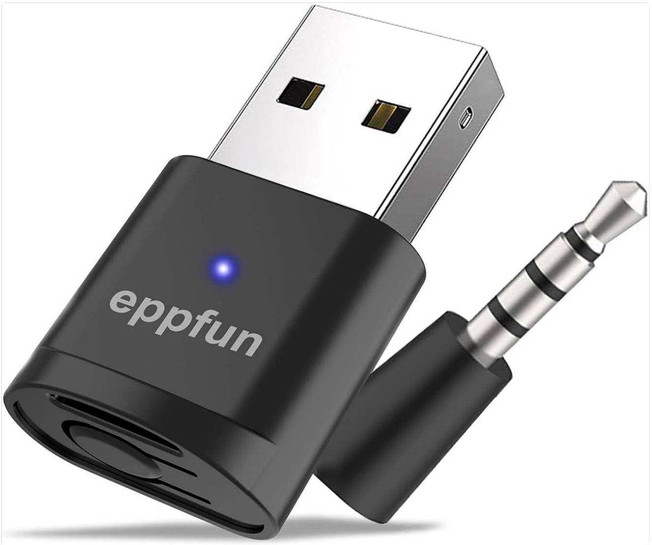
Image: The eppfun USB Bluetooth Adapter, a compact black dongle with a blue LED indicator, shown alongside a 3.5mm audio jack, highlighting its small size and primary function.