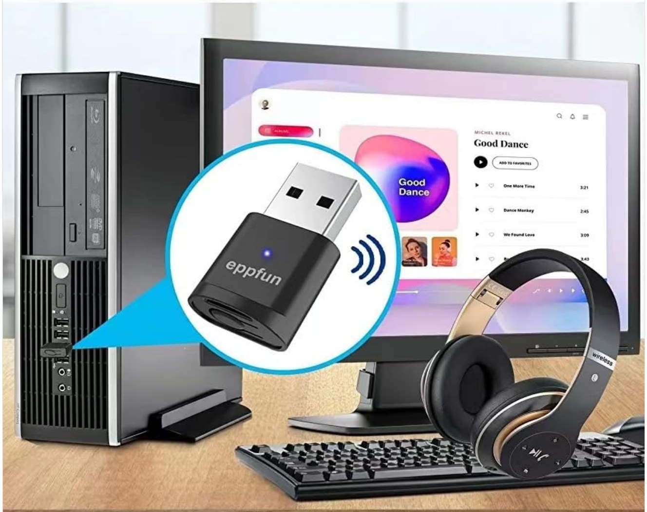
Image: The eppfun USB Bluetooth Adapter plugged into a desktop PC, with a pair of wireless headphones nearby, illustrating a typical setup for computer audio.