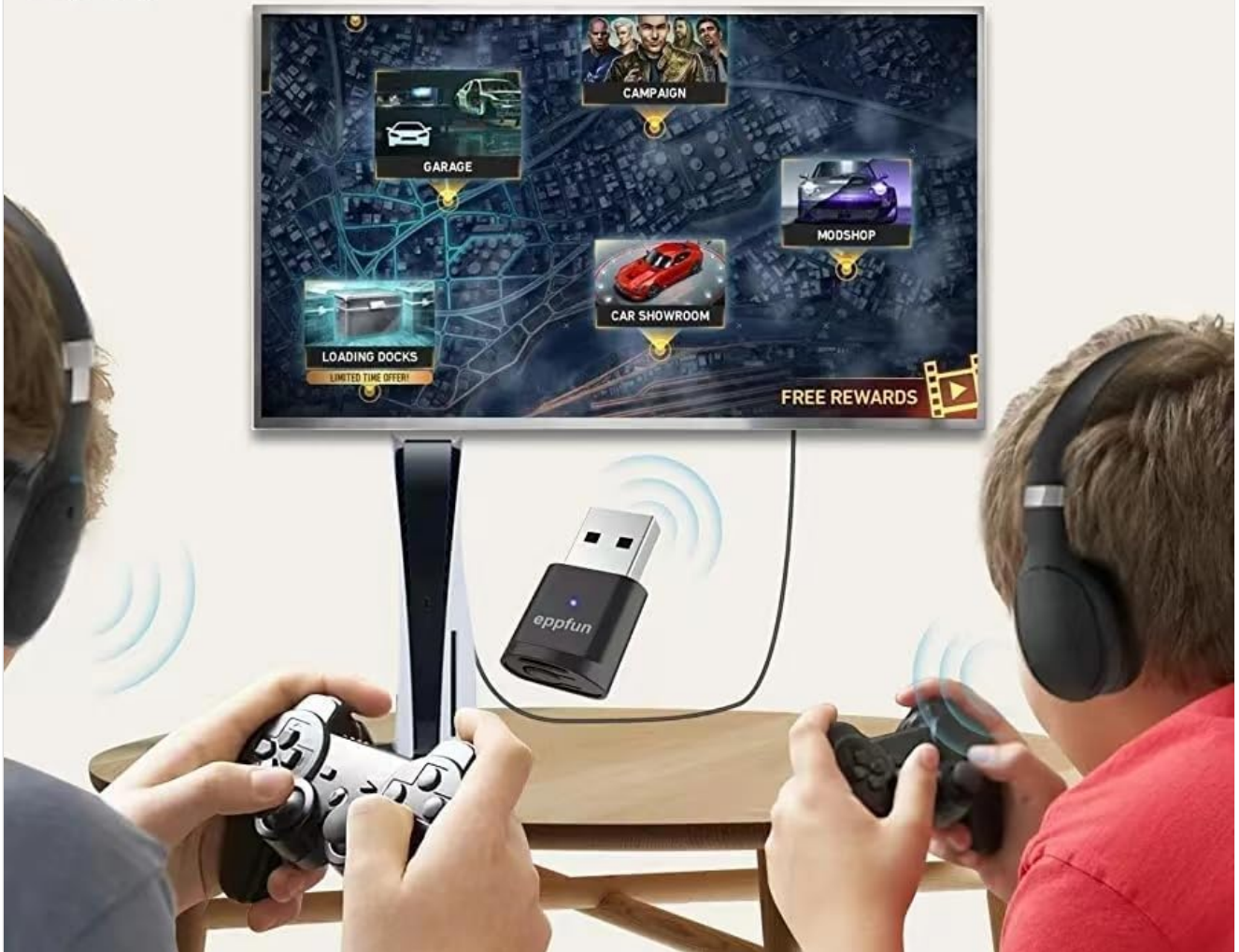
Image: Two individuals wearing headphones while playing a video game on a PlayStation 5, with the eppfun USB Bluetooth Adapter visibly connected to the console, demonstrating dual headphone connectivity for gaming.