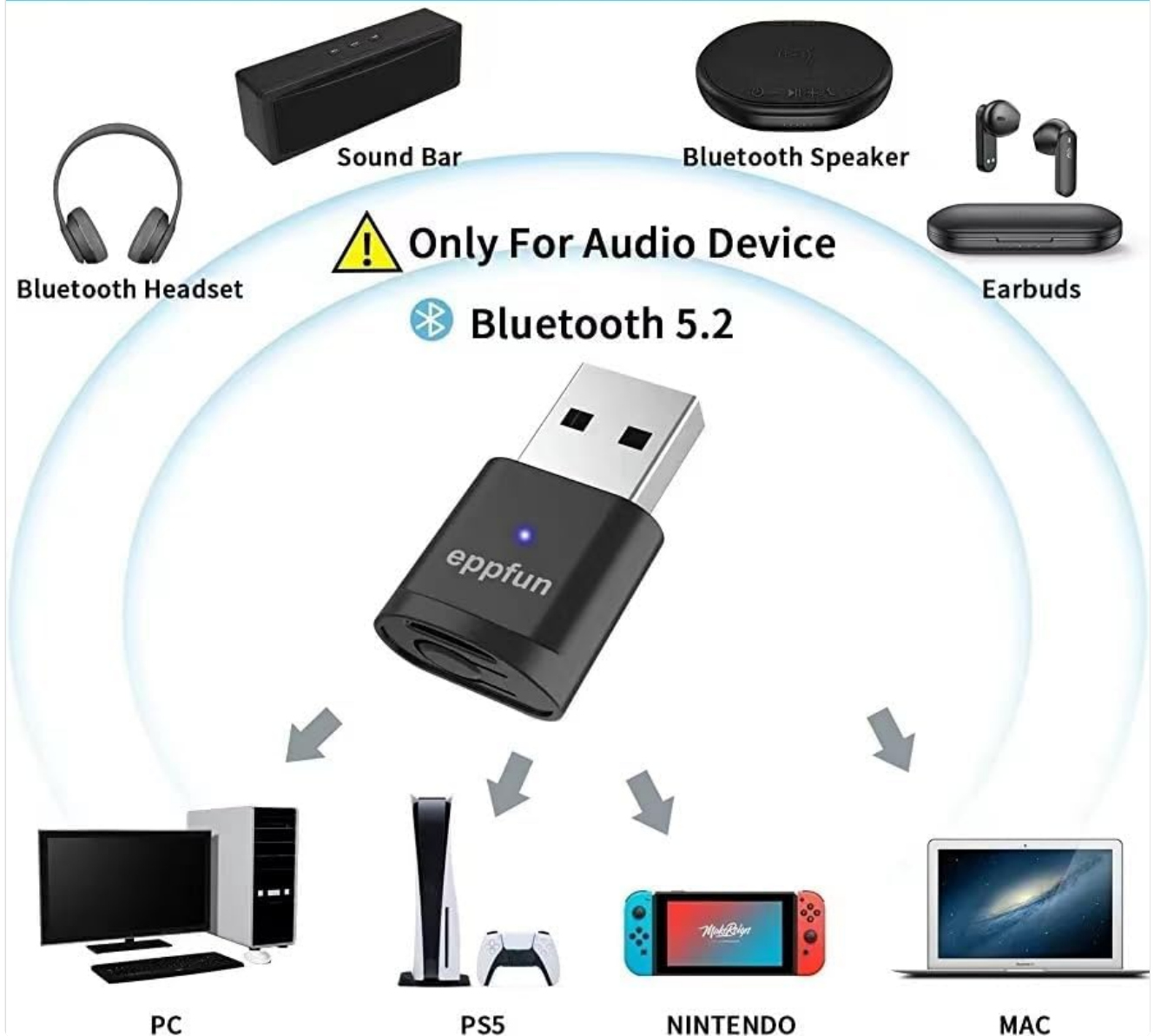
Image: A diagram illustrating the eppfun USB Bluetooth Adapter's compatibility with various devices, including Bluetooth headsets, soundbars, speakers, and earbuds, and source devices like PC, PS5, Nintendo Switch, and Mac, emphasizing it's for audio devices only and uses Bluetooth 5.2.