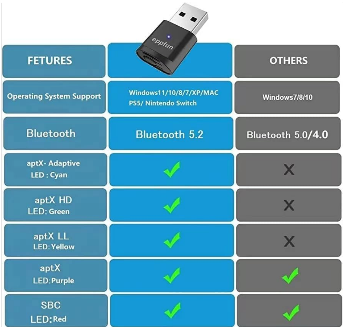
Image: A comparison table highlighting the features of the eppfun adapter (labeled 'FETURES') against 'OTHERS'. It shows the eppfun adapter supports Windows 11/10/8/7/XP/MAC, PS5/Nintendo Switch, Bluetooth 5.2, and all listed aptX codecs (Adaptive, HD, LL, aptX) and SBC, while 'OTHERS' have limited support.