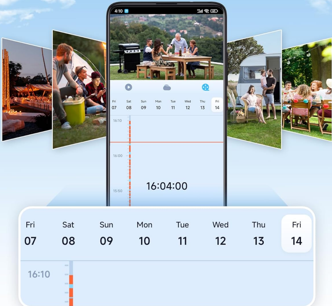
Image: View playback screen anytime, anywhere.