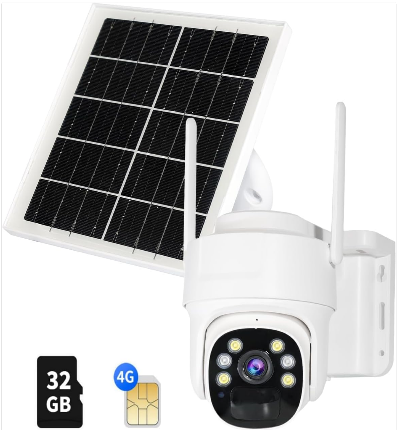
Image: All components included in the package.