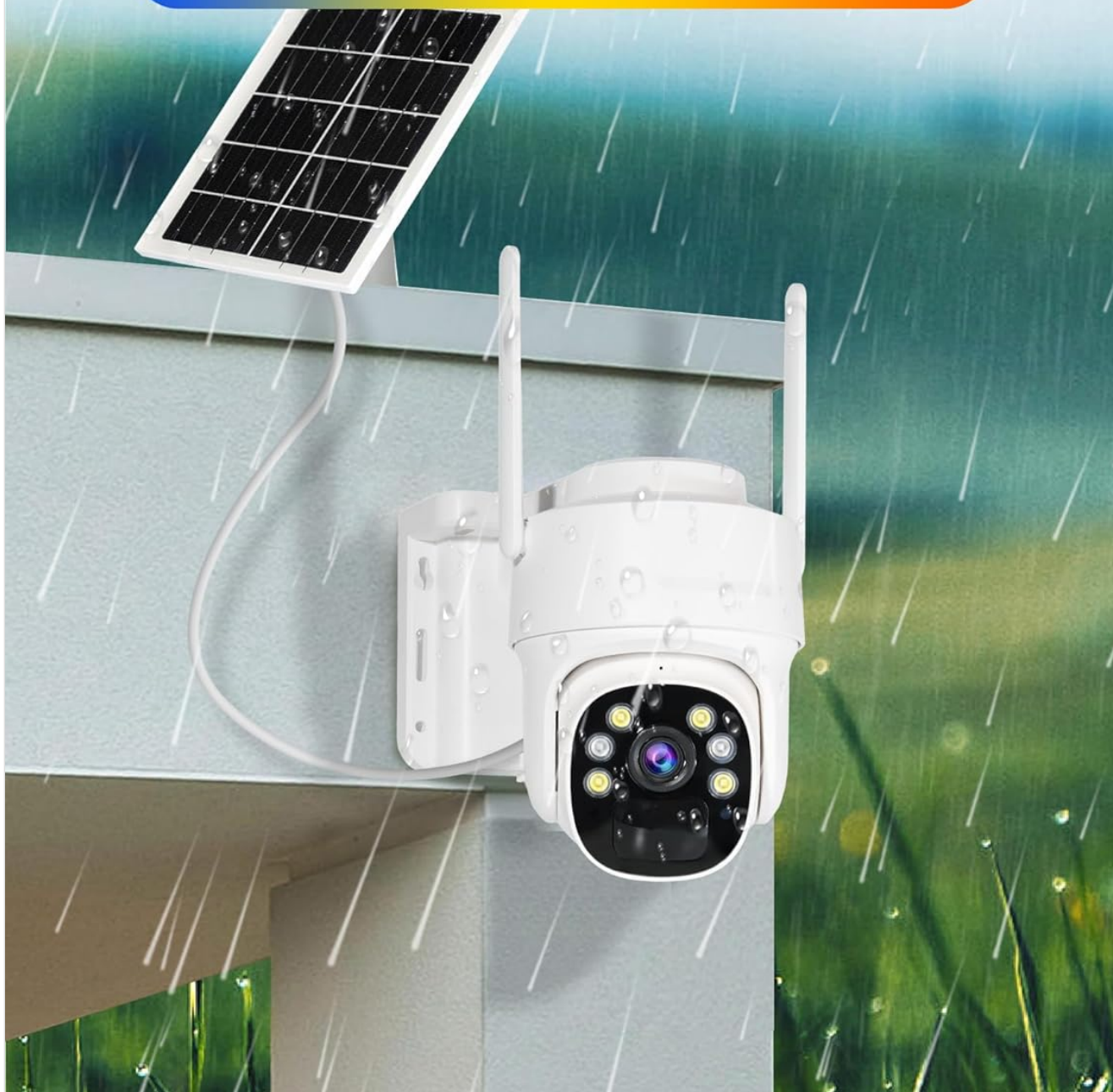
Image: IP65 Rainproof and Weather Resistant.

360° PTZ & 4X Digital Zoom: Control the camera's viewing angle remotely with 355° pan and 90° tilt, ensuring no blind spots. The 4X digital zoom allows for closer inspection of details.