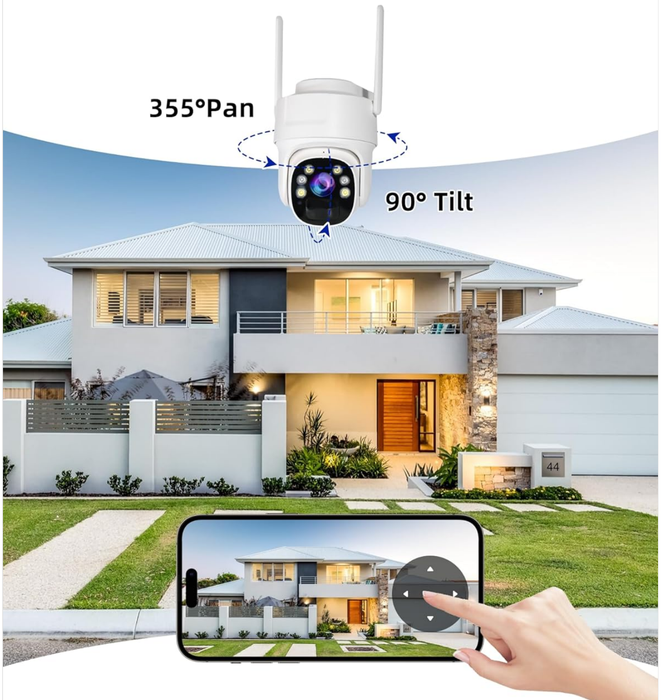
Image: Cover Every Corner of your Place with 355° Pan and 90° Tilt.

Two-Way Audio: Communicate with visitors or deter intruders using the built-in microphone and speaker.