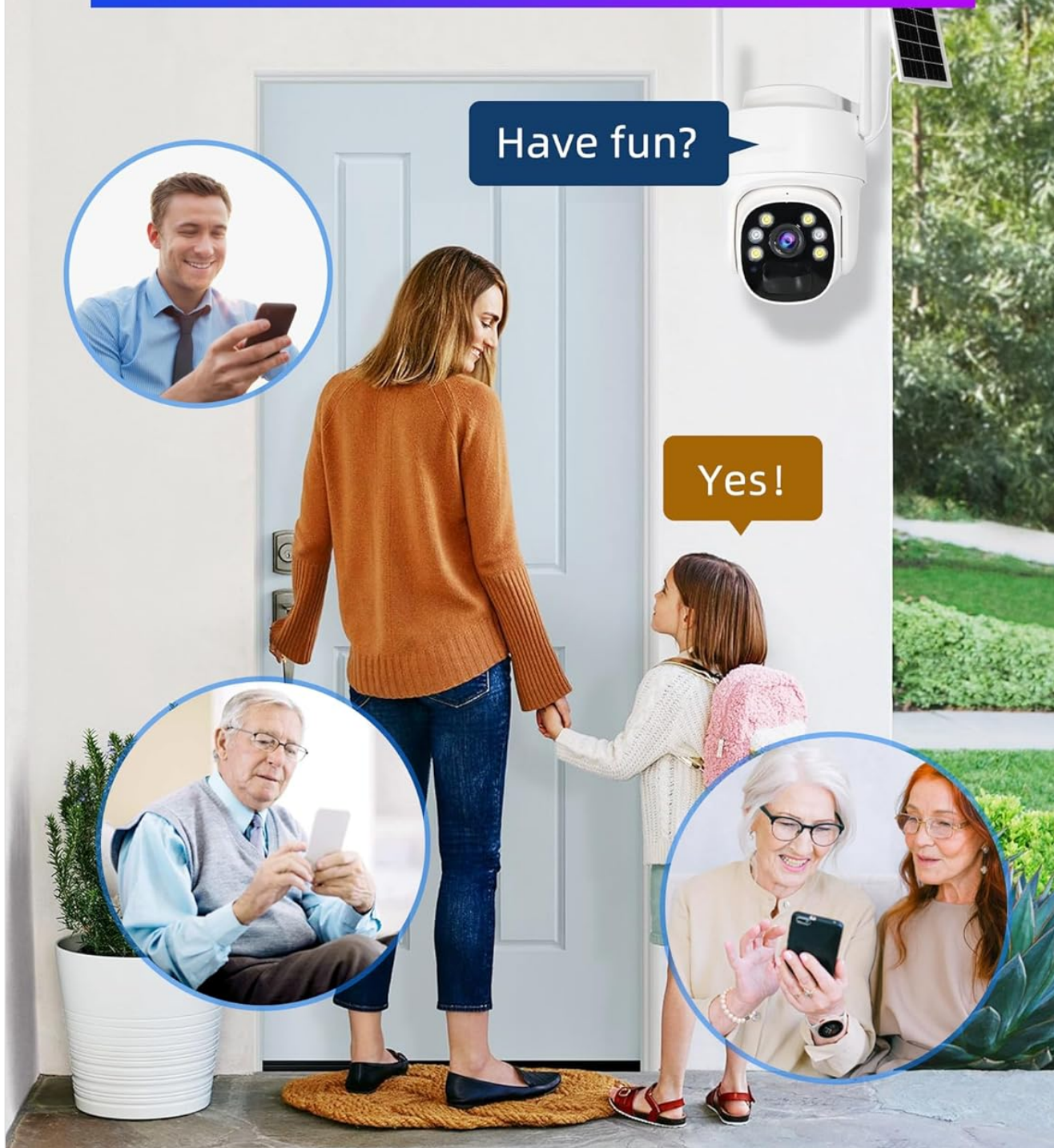
Image: Two-Way Audio & Users Sharing.

PIR Humanoid Detection & Mobile Alerts: Receive timely alerts on your mobile app when humanoid motion is detected, reducing false alarms.