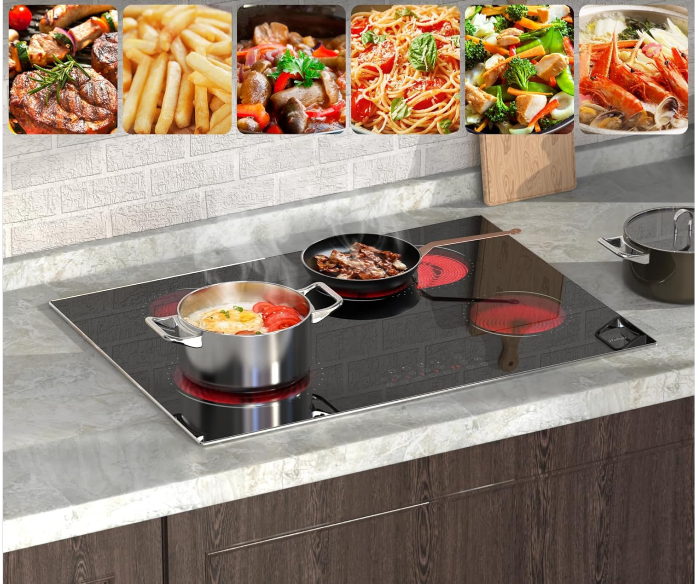
Figure 5.2: The Hobsir cooktop in use, demonstrating the versatility of 9 power levels for various cooking methods.