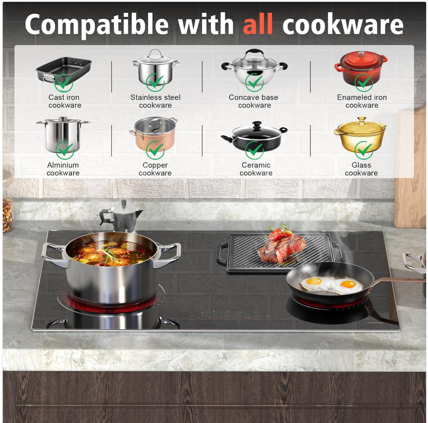
Figure 6.1: Visual guide to cookware compatibility, showing various types of pots and pans suitable for use on the Hobsir electric cooktop.

Ensure the base of your cookware is flat and makes full contact with the cooking zone for optimal heat transfer.