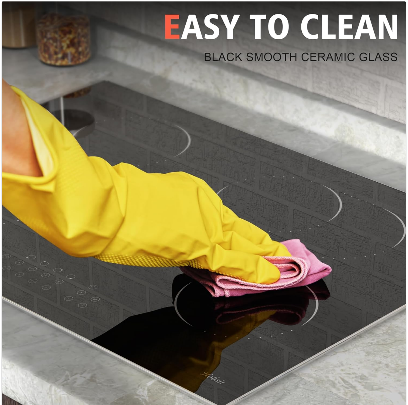
Figure 7.1: A hand in a yellow glove cleaning the smooth black ceramic glass surface of the cooktop with a pink cloth, demonstrating ease of cleaning.

After each use, allow the cooktop to cool down completely. Wipe the ceramic glass surface with a damp cloth and mild detergent. For stubborn stains, use a ceramic cooktop cleaner and the provided cleaning scraper.