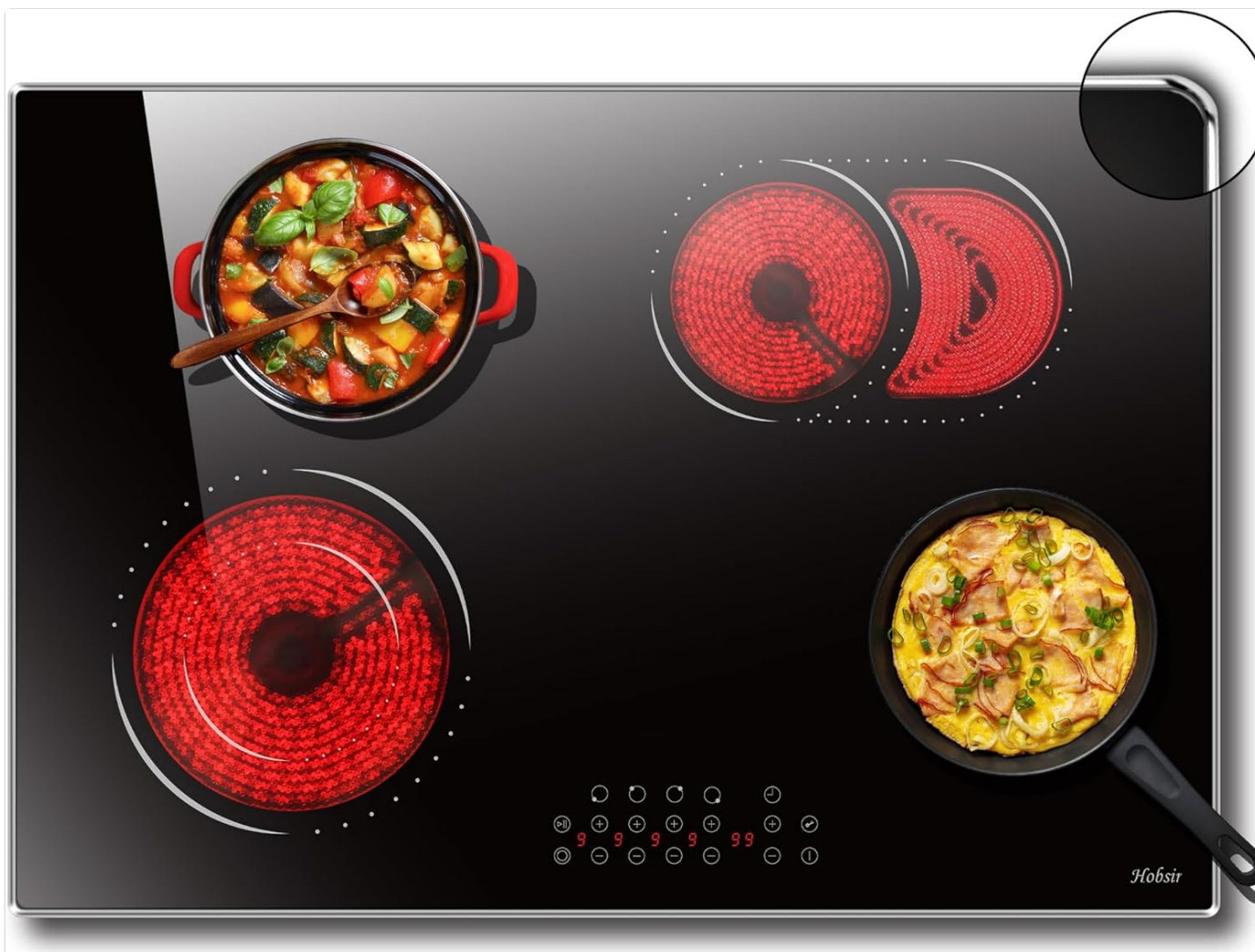
Figure 5.1: Top view of the Hobsir 30 Inch Electric Cooktop, showing the four radiant burners and the touch control panel at the front.