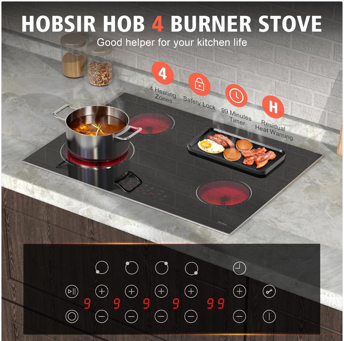
Figure 3.1: Overview of Hobsir Hob 4 Burner Stove features including 4 heating zones, safety lock, 99 minutes timer, and residual heat warning.