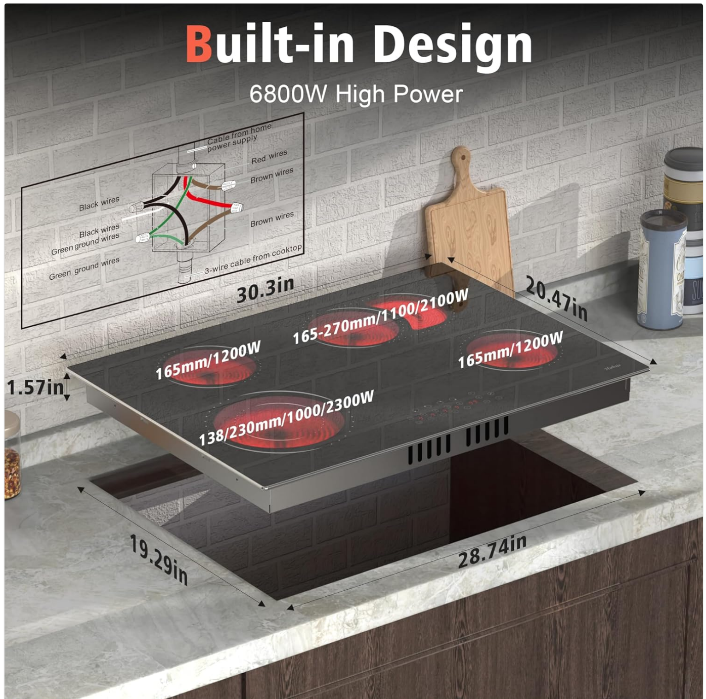
Figure 4.1: Detailed diagram showing the built-in design, 6800W high power, and precise dimensions for installation, including wiring diagram.

Cut-out Dimensions: Approximately 28.74 inches (Width) x 19.29 inches (Depth)