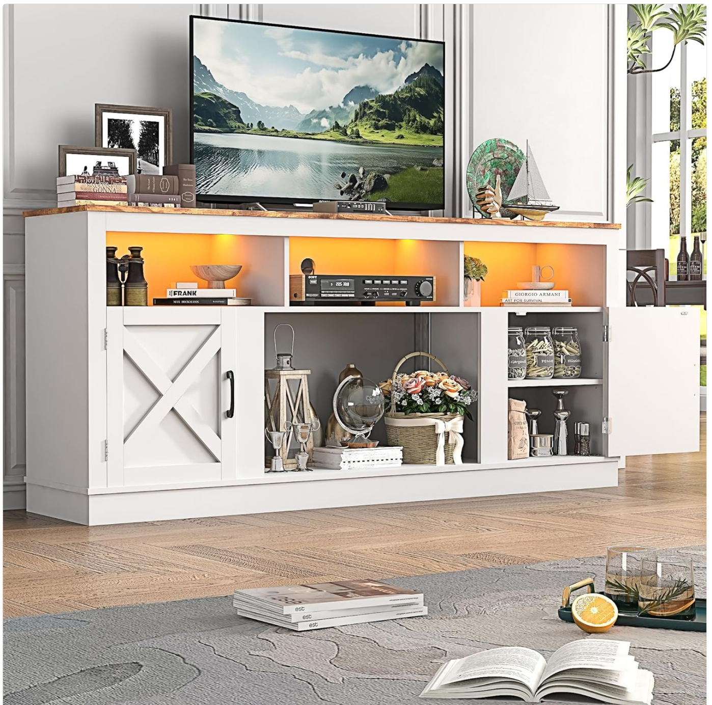
Figure 4: LED lighting features and remote control.