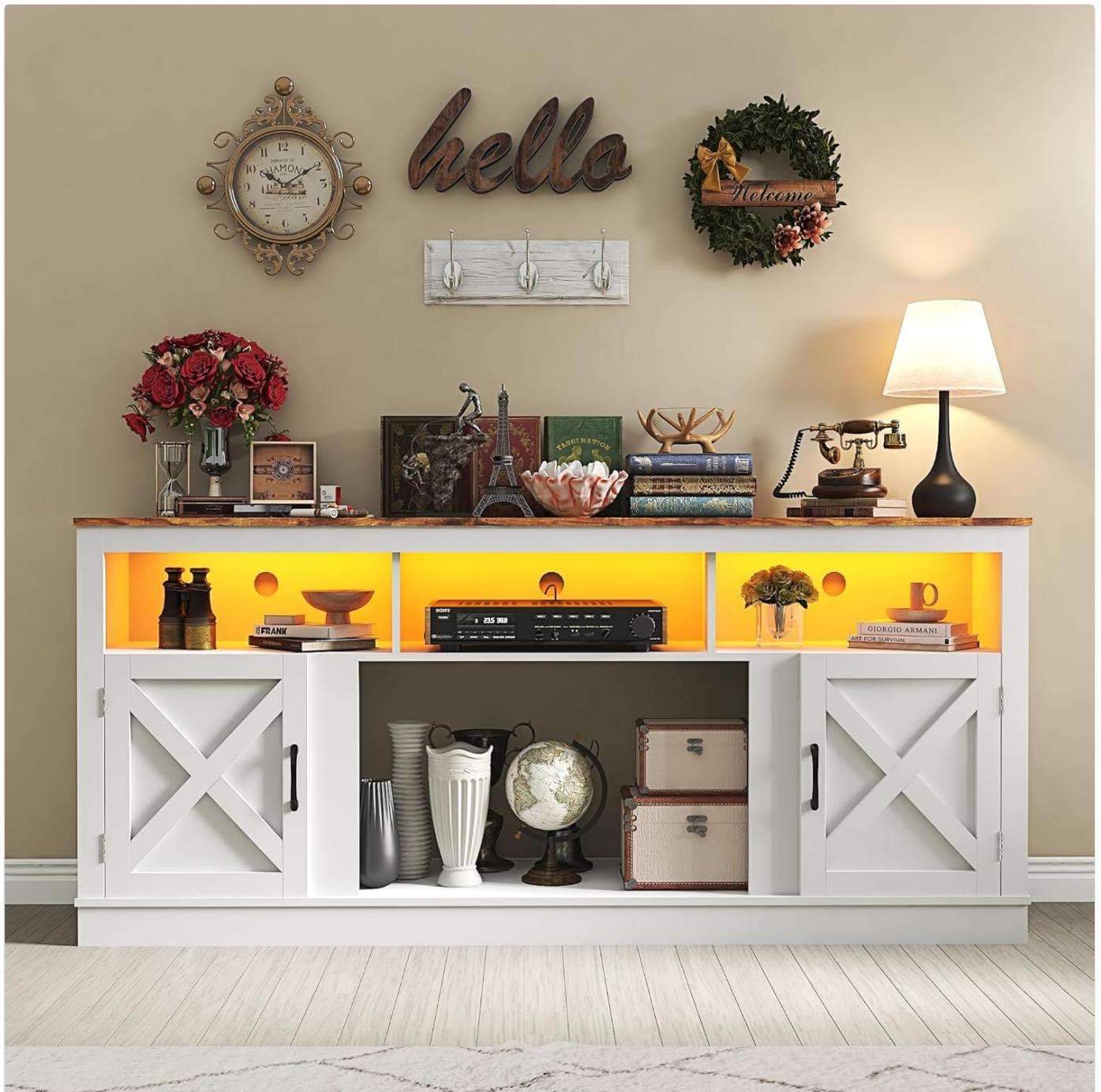
Figure 1: Front view of the Farmhouse TV Stand with LED lights illuminated.