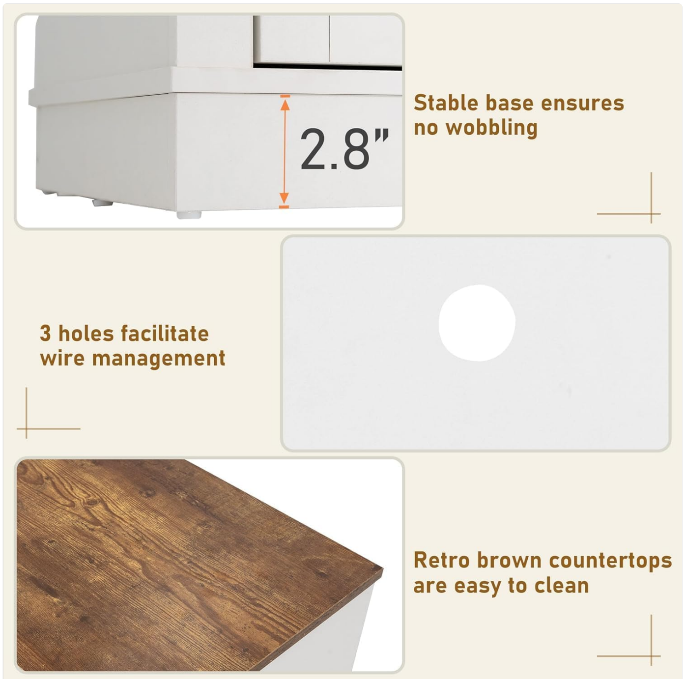
Figure 3: Details of the stable base, wire management, and countertop finish.