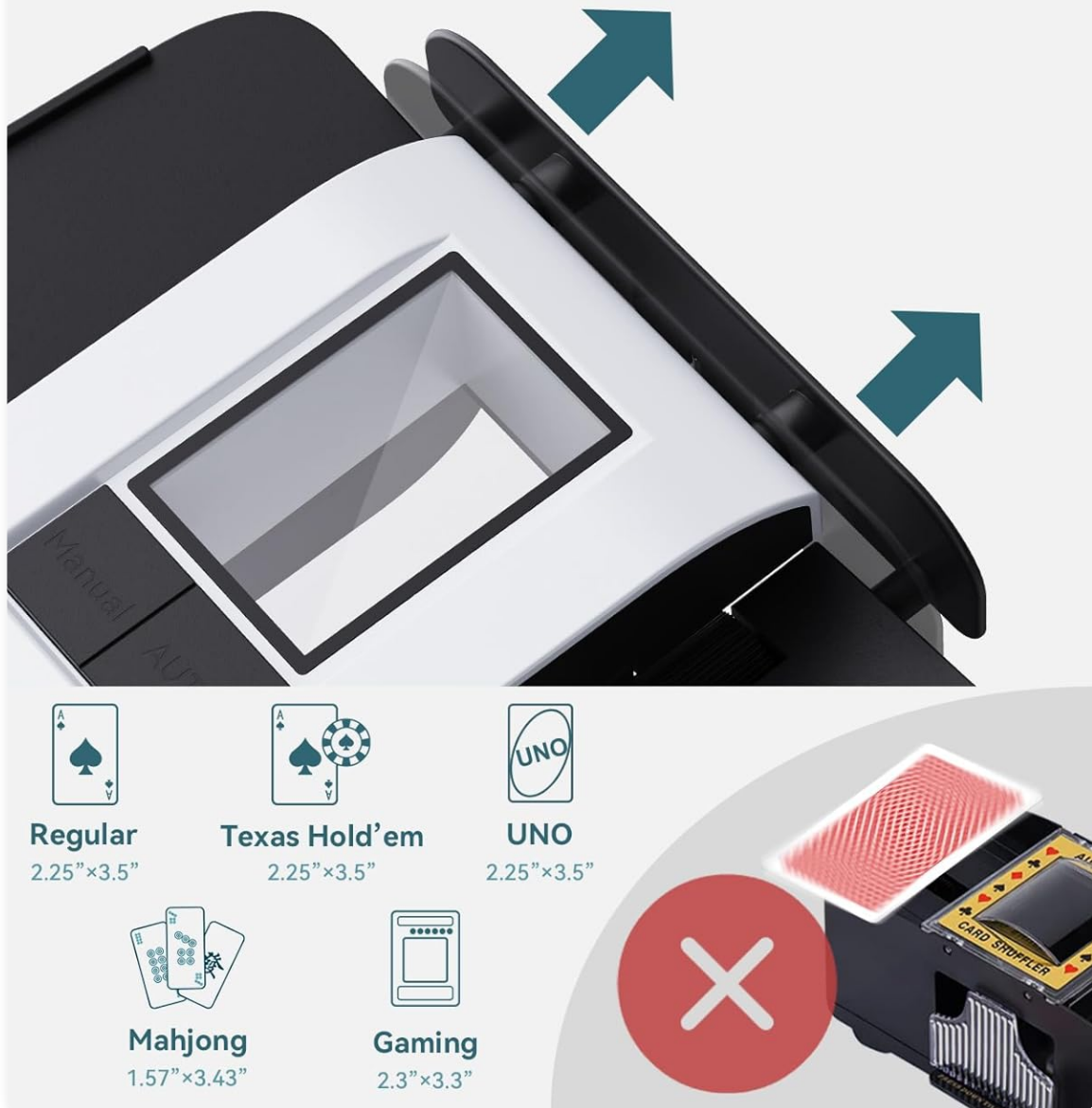
Image: Illustration of the retractable wings, demonstrating how they adjust to fit various card sizes like Regular, Texas Hold'em, UNO, Mahjong, and Gaming cards.