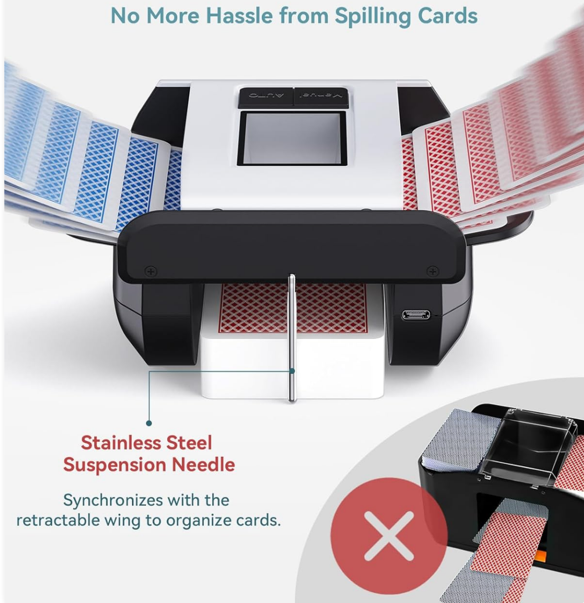
Image: The shuffler's internal mechanism, showing the stainless steel suspension needle that synchronizes with the retractable wings to organize cards and prevent spilling during shuffling.