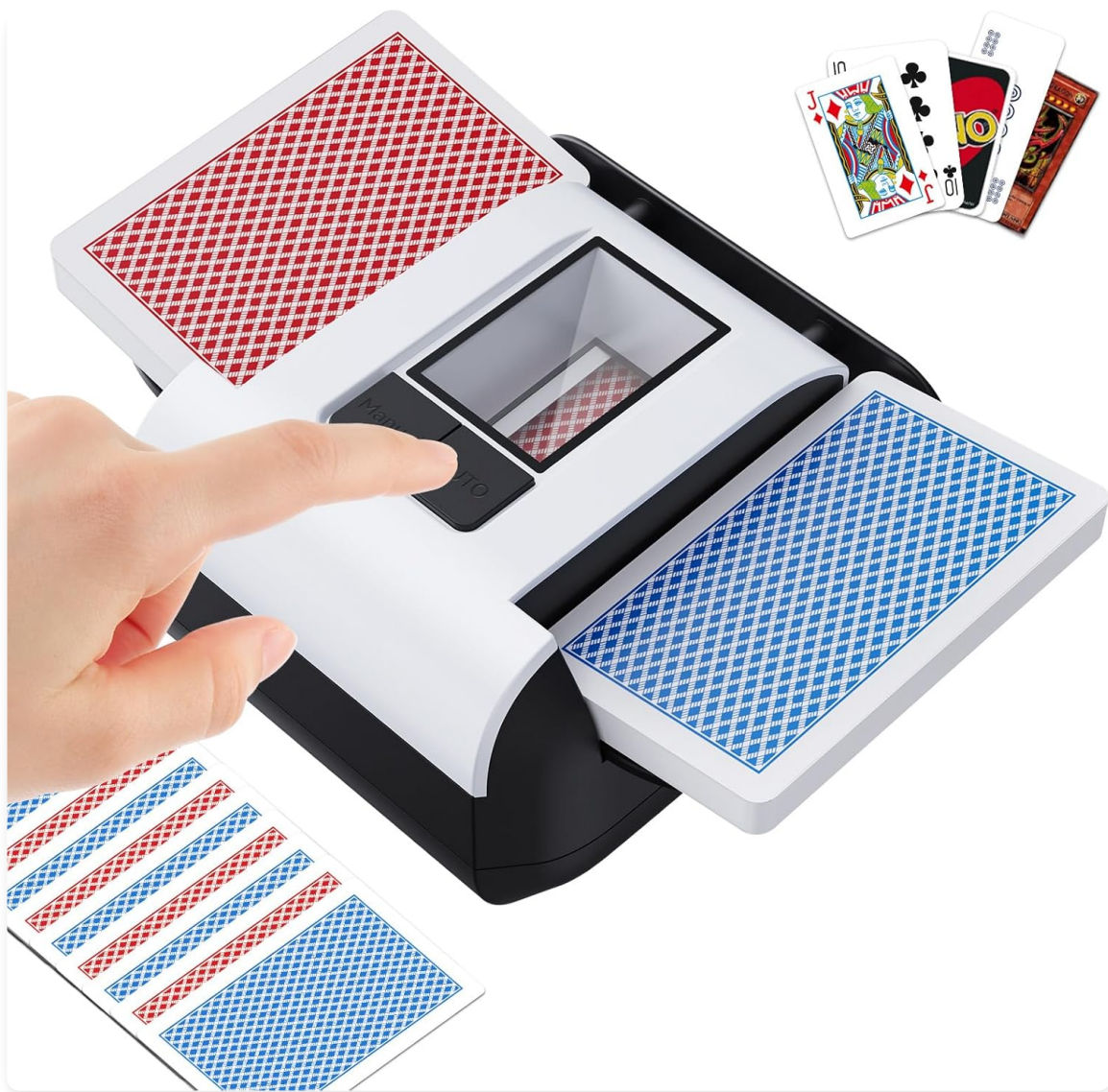
Image: The KPAW X1 Automatic Card Shuffler actively shuffling cards, demonstrating its primary function.