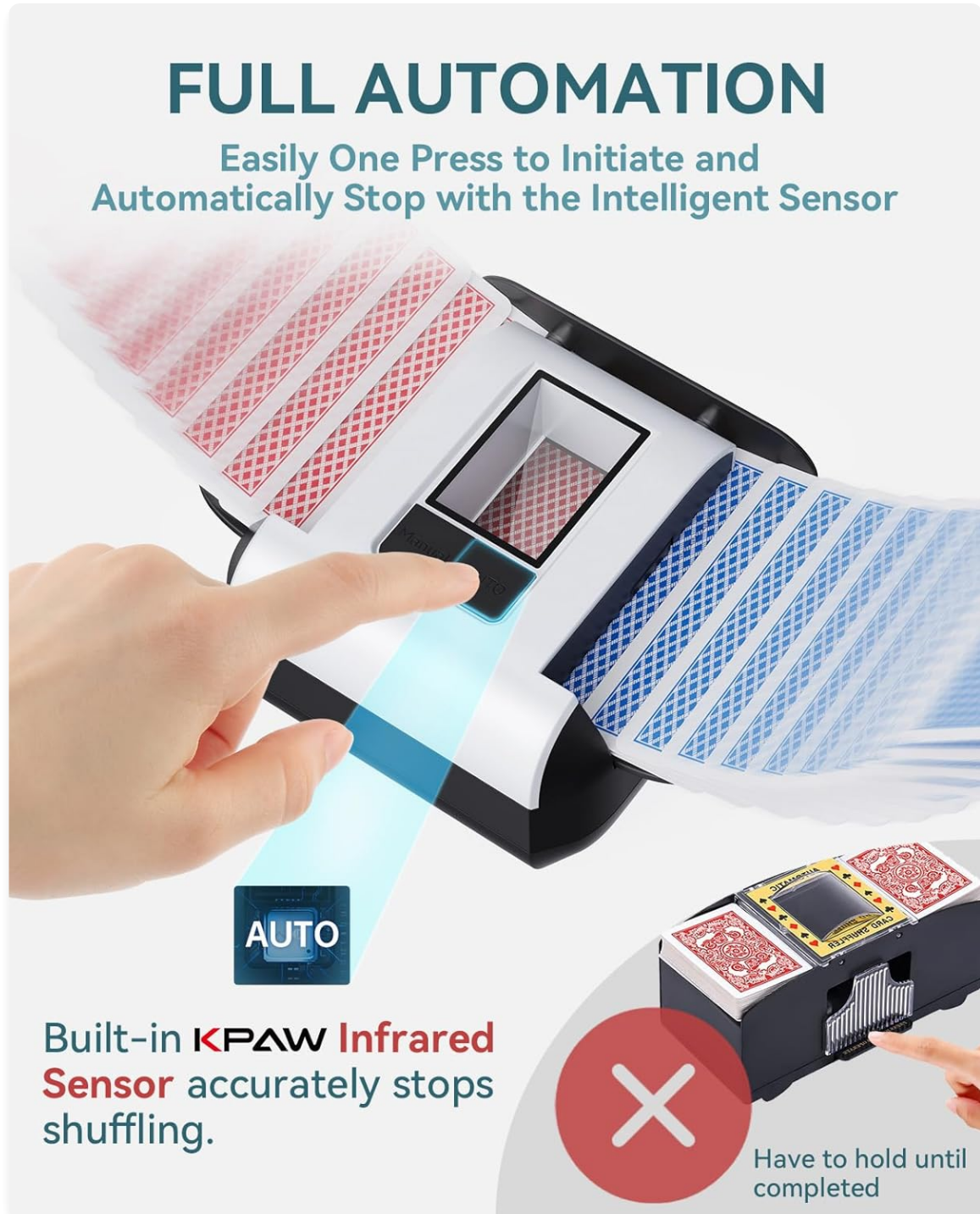
Image: A hand pressing the AUTO button on the shuffler, illustrating the one-press automatic shuffling feature.