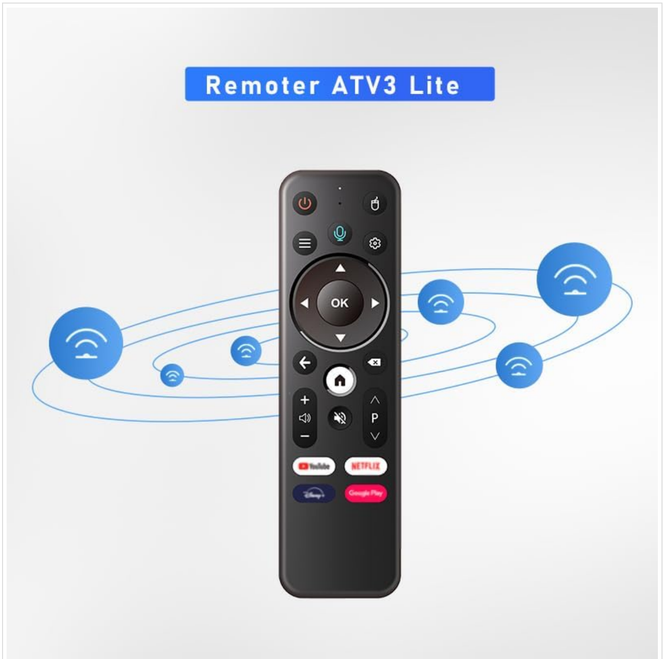
Image: Bluetooth connection diagram for the ATV3 Lite remote.