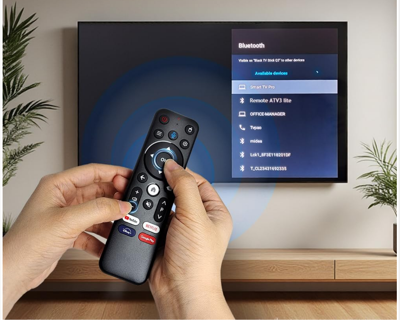
Image: User pairing the ATV3 Lite remote via Bluetooth on a TV screen.

Control information at your fingertips, Enjoy infrared remote control