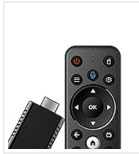
Image: Detailed view of the remote control buttons.