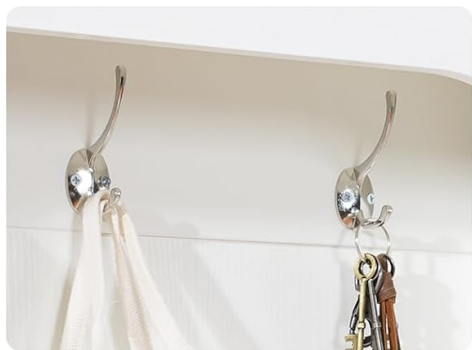
4 Coat Hooks