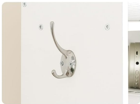
2 Side Hooks