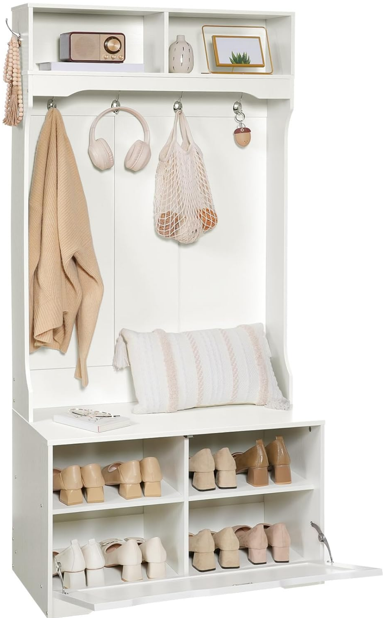
Image: A close-up view of the open shelving unit at the top of the hall tree, displaying small decorative items, along with the coat hooks below.