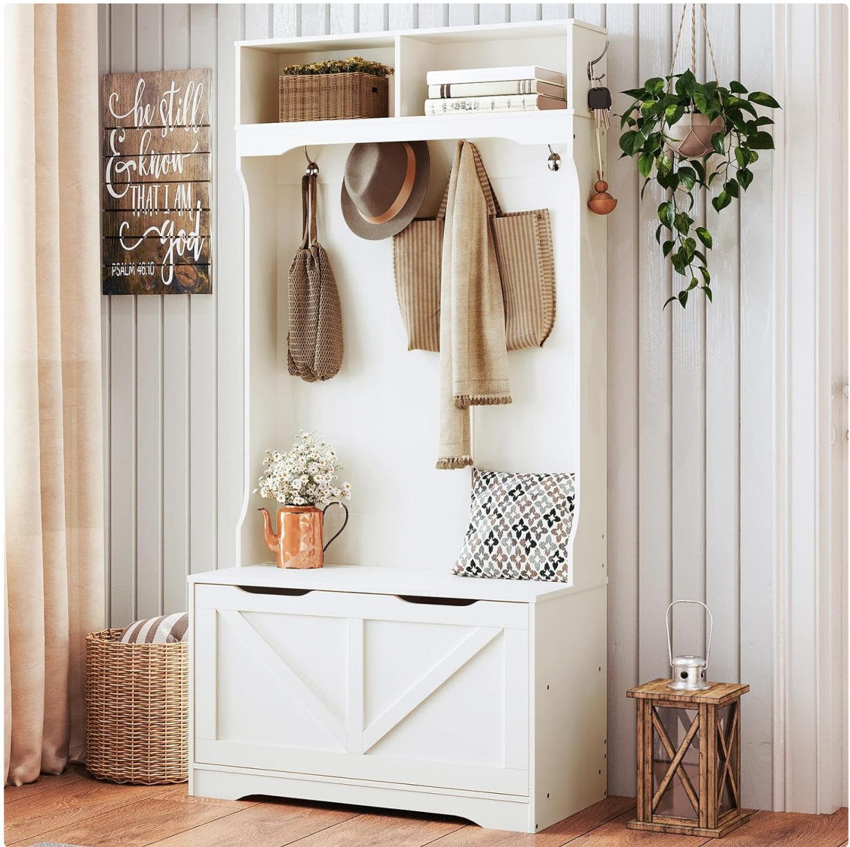
Image: The HOOBRO Hall Tree, a multi-functional unit for organizing entryways, featuring a bench, coat hooks, and shoe storage.