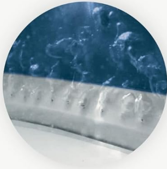
170 High-Powered Bubble Jets