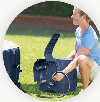
Easy FastFill Inflation

Image: The pump and control unit connected to the side of the inflatable spa, showing the various ports and the digital display.