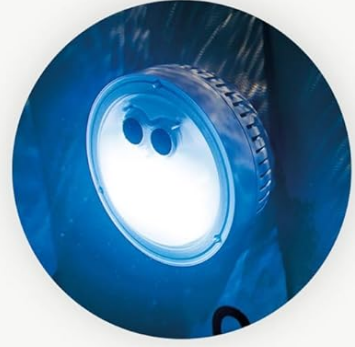
Multicolor LED Light