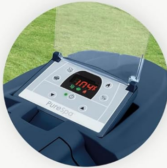
Easy-to-Use Control Panel