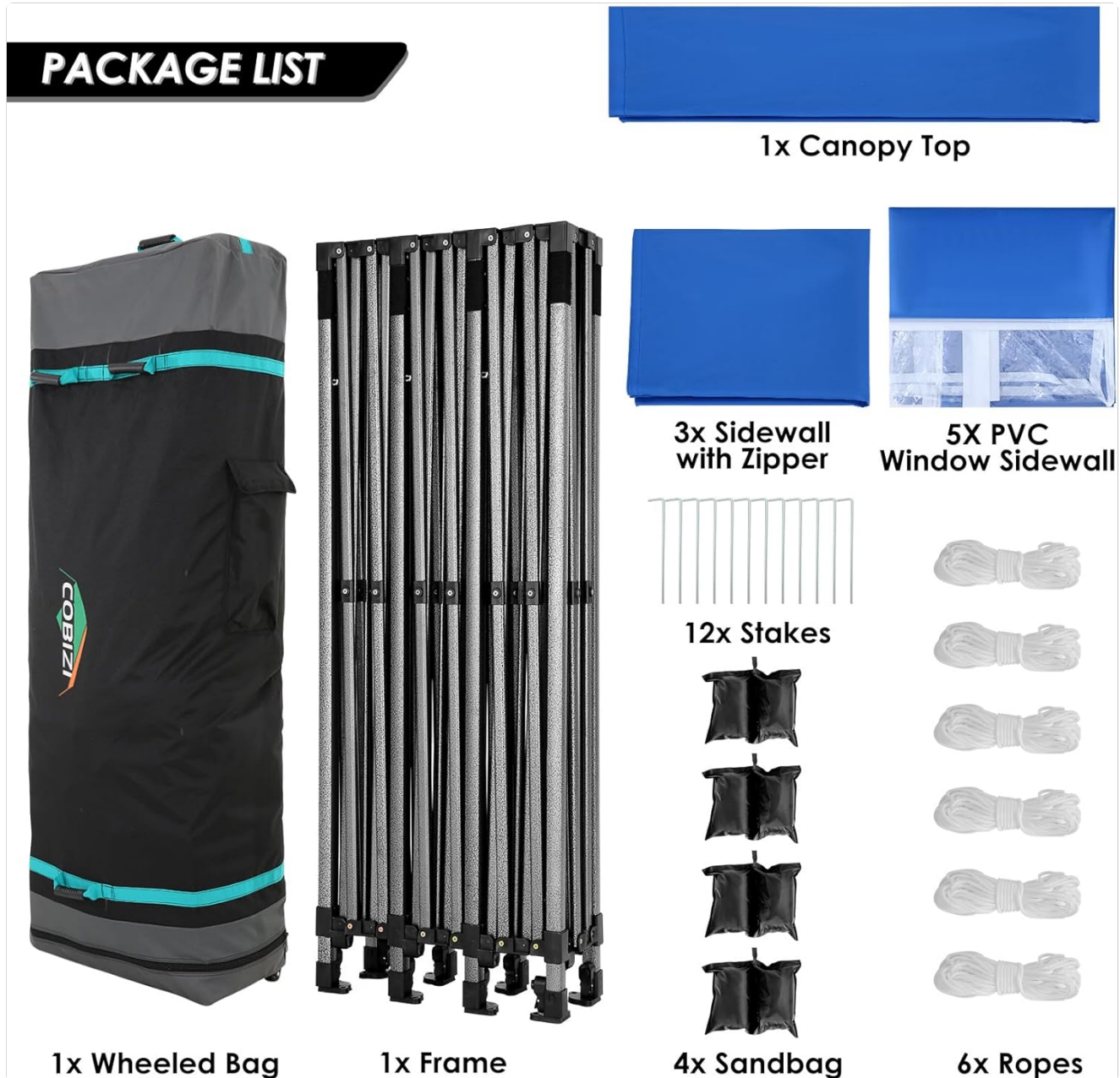
Image showing all components included in the COBIZI 10x30 Pop Up Canopy package: frame, canopy top, sidewalls, sandbags, ground pegs, wind ropes, wheeled bag, and manual.