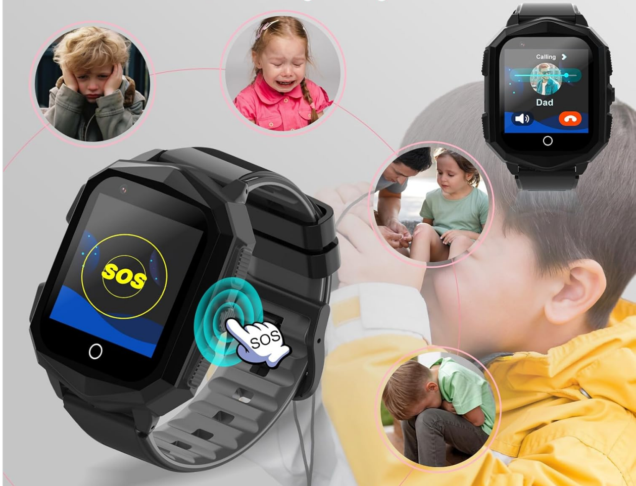
Figure 4.3: SOS Emergency Calling

One-click to ask for help by pressing the SOS button for more than 3 seconds, then the watch will call family numbers presented in the APP and send messages to the guardians.