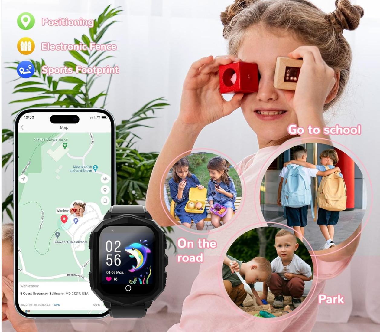
Figure 4.4: Real-time GPS Tracking

Your browser does not support the video tag.