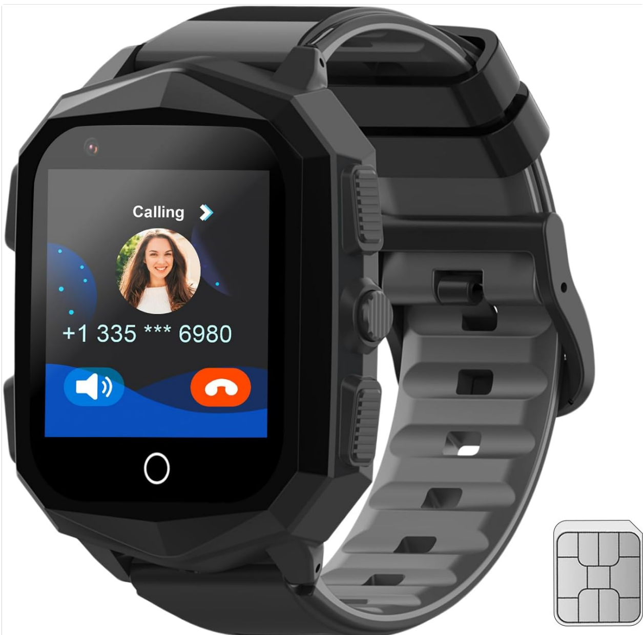
Figure 4.1: Video Calling on the Smart Watch