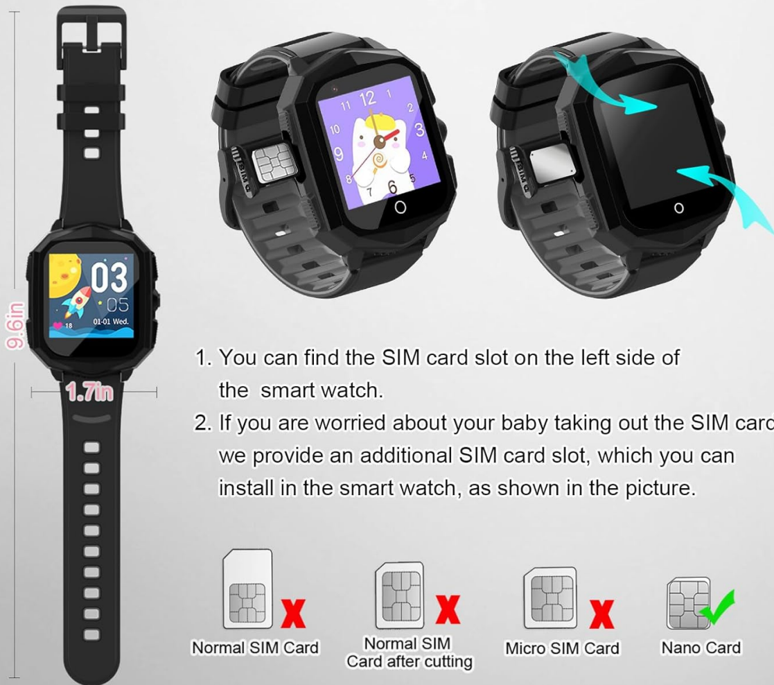
Figure 3.1: SIM Card Installation