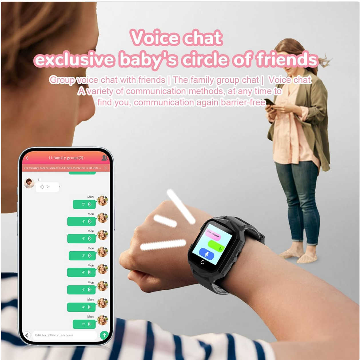
Figure 4.2: Voice Chat Functionality